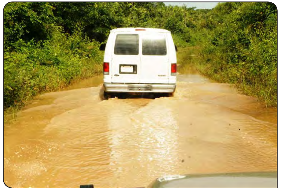
A van full with Food Stuff headed to Flowers Bank

After leaving Flowers Belize River Valley area, Bank, Castro and the NEMO Team took some food stuff but when it does, the condition normally persists