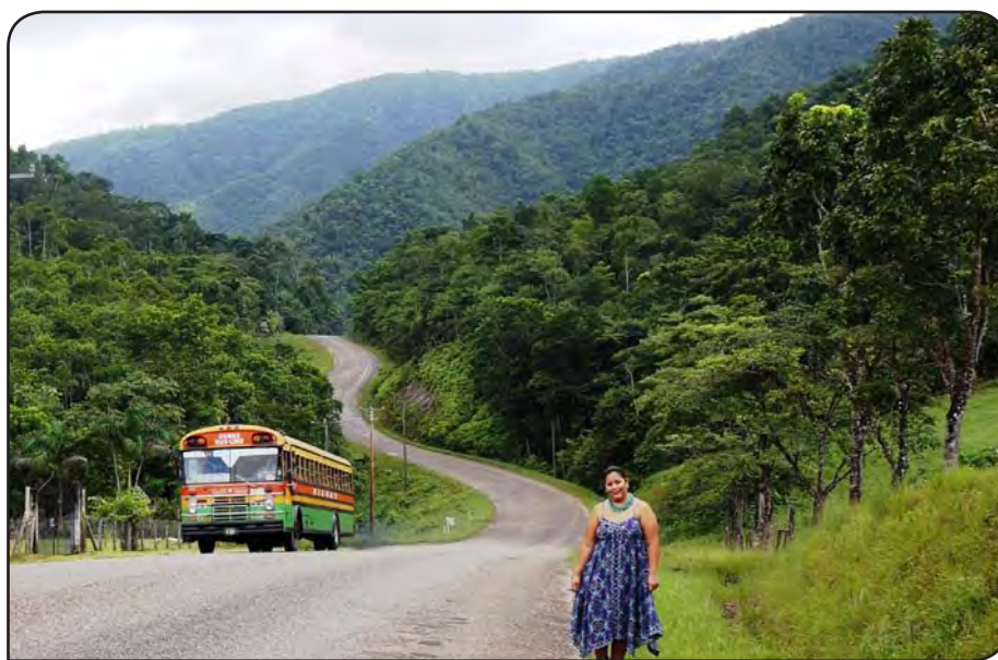
The scenic Hummingbird Highway to be Rehabilitated

The loan motion is for US $12 Million (Bz$24 Million) from the OPEC Fund for International Development (OFID), which is only a portion (39 percent) of funds secured for the rehabilitation of the Hummingbird Highway. These monies will be expended, as spelled out in the loan motion, "towards the general mobilization and site