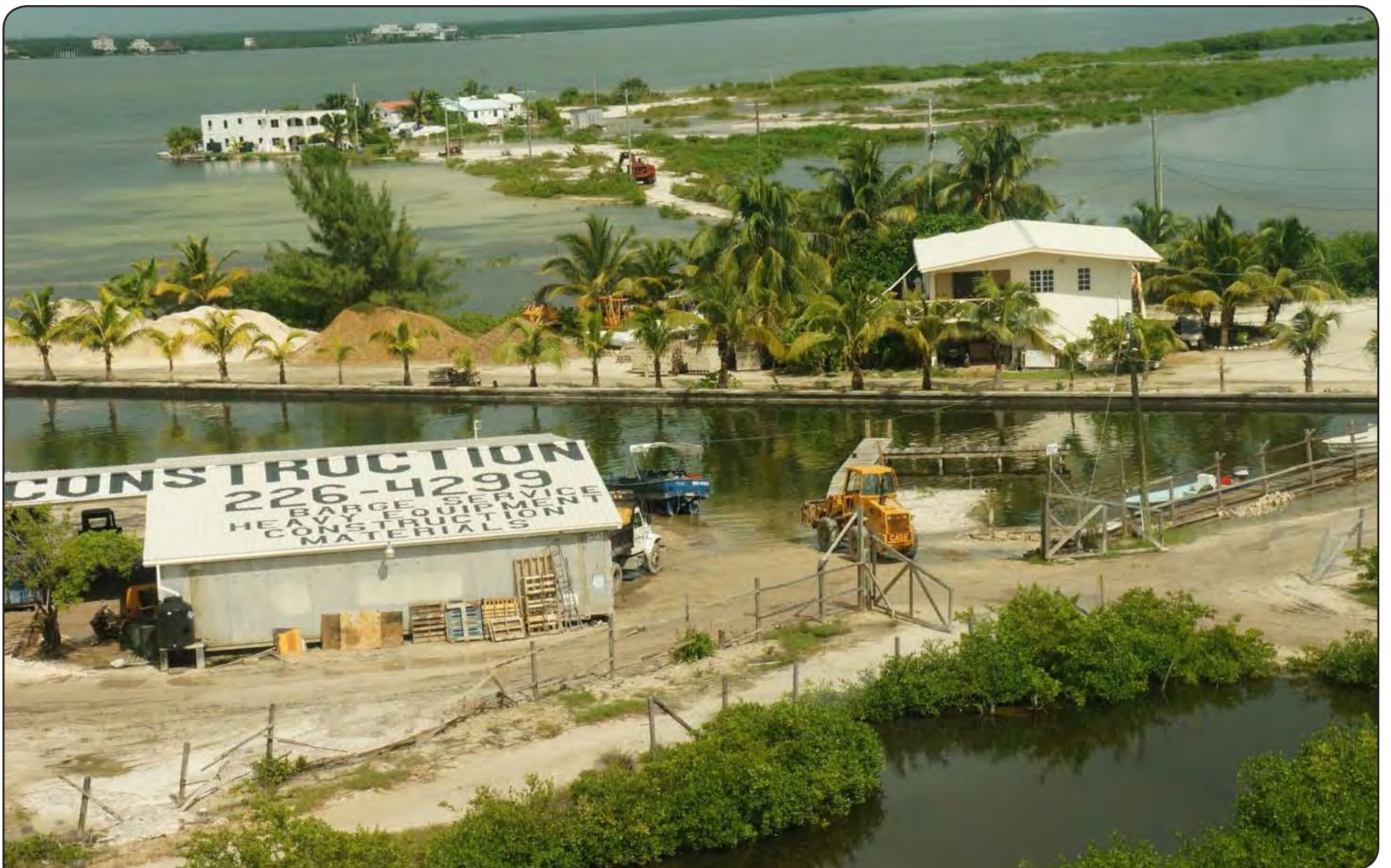
Ongoing Development and Construction on one of Belize's most popular Island Tourism Destinations

One of two loan motions tabled and passed at the first business session of the House of Representatives was one for a loan of US $15 Million ($30 Million Belize) from the Inter-American Development Bank, called the Sustainable Tourism Program II Loan Motion, 2015.