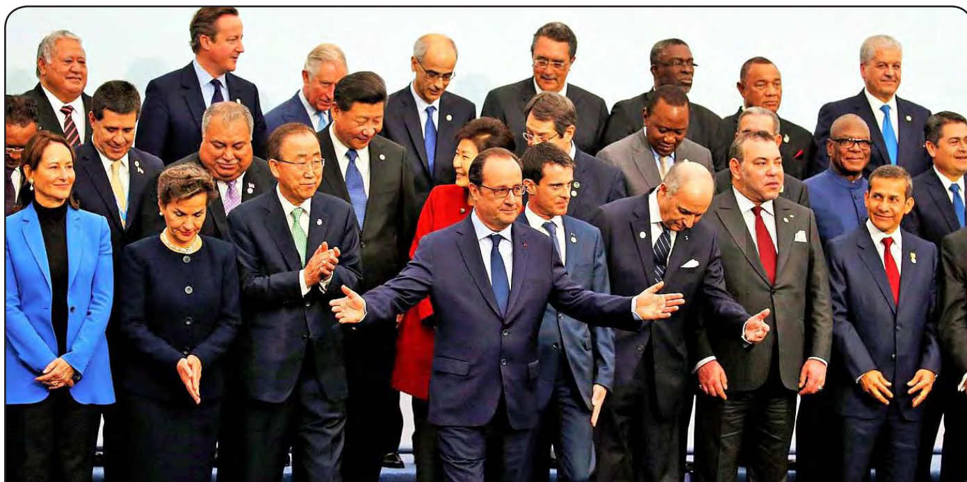
French President Francois Hollande among other world leaders at the world summit in Paris