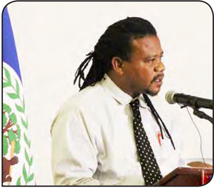
Hon. Edmond Castro Minster State for Transport