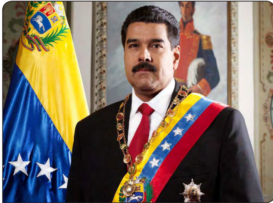
Venezuelan President Nicolas Maduro-Moros

It is the worst-ever defeat for the leftist movement founded by former leader Hugo Chavez in 1999. The Socialists have gained 46 seats, with an-