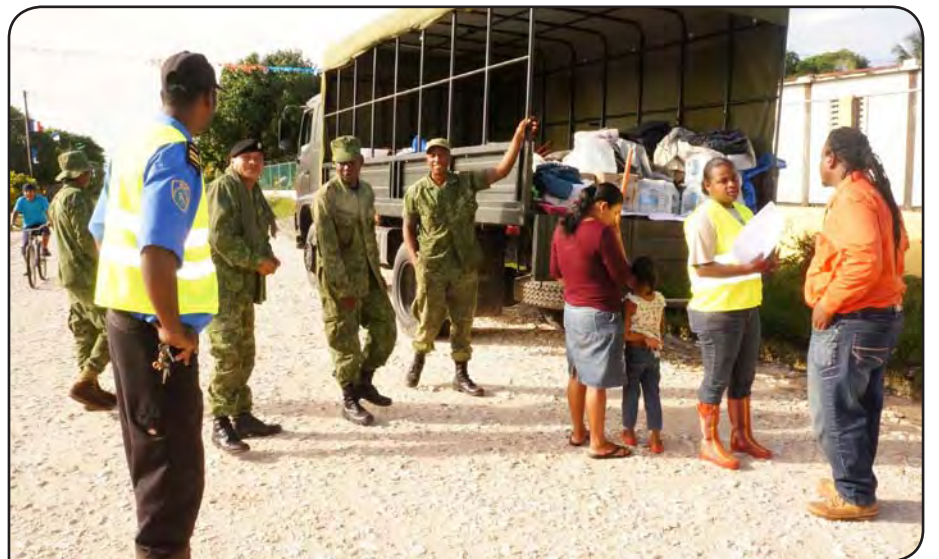
Hon. Edmond Castro in Bella Vista Village

departments and agencies it encompasses, along with local volunteers in the communities affected. A characteristically hands-on politician, Hon. Edmond Castro was himself immediately on the ground. After making his rounds through his own constituency of Belize Rural North and the Cayo District on Saturday, Castro arrived in the South on Sunday. In Stann Creek, he visited the village of Sarawee, which had been affected by flash flooding. Thankfully, the deluge had already subsided in that community.