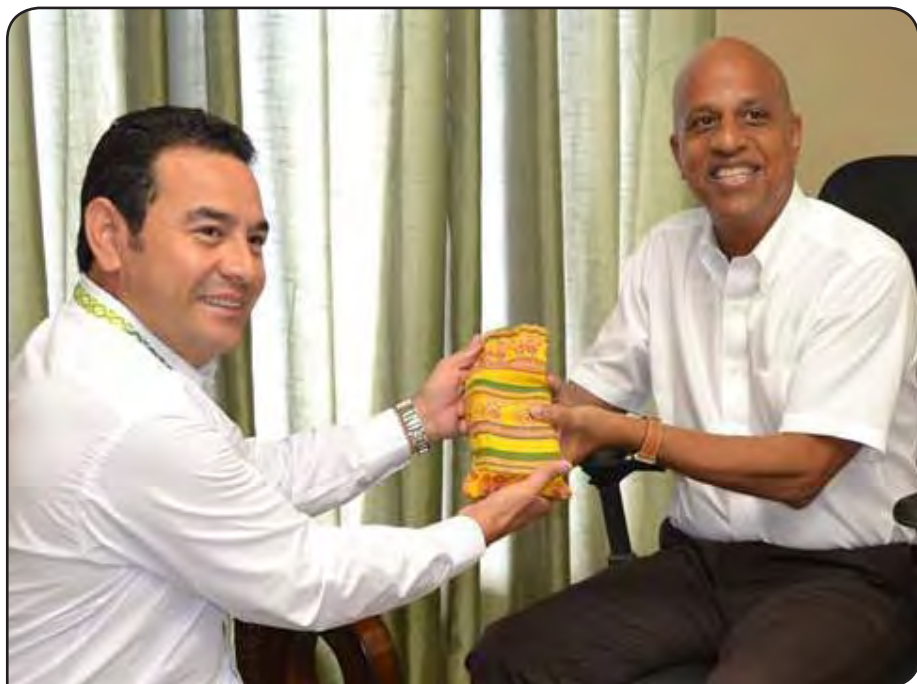
Guatemalan President Jimmy Morales and Belize Prime Minister Dean Barrow meet and exchange gifts at the PM's Belize City Office

New Guatemalan President Visits PM Dean Barrow