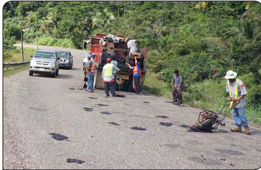
Short-term patching on portions of the Hummingbird Highway which will become unnecessary after complete resurfacing