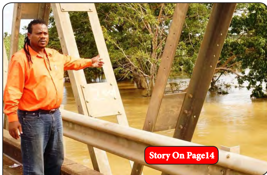
Story On Page 14

New NEMO Minister Hits The Ground Running