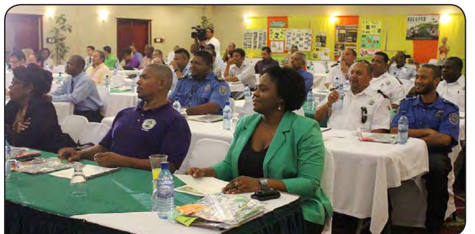
Participants at the Opening of the Annual Review 2015 for the Road Safety Project at Biltmore Best Western Plaza Hotel