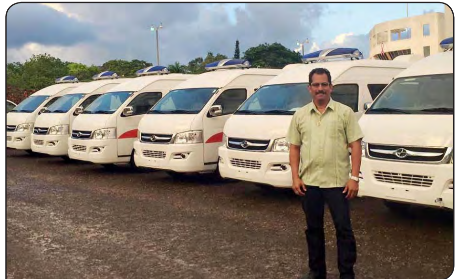
The six new ambulances acquired by the Ministry of Health