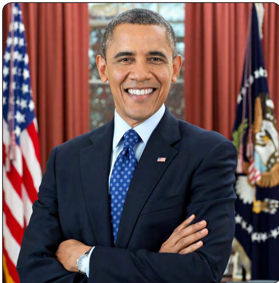
United States President Barack Obama in the Oval Office

Over the last few years, however, the terrorist threat has evolved into a new phase. As we've become better at preventing complex, multifaceted attacks like 9/11, terrorists turned