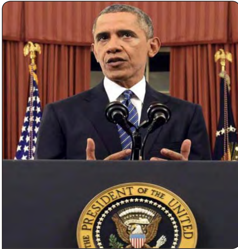
US President Barack Obama delivering address from the Oval Office

We also need to make it harder for people to buy powerful assault weapons like the ones that were used in San Bernardino. I know there are some who reject any gun safety measures. But the fact is that our intelligence and law enforcement agencies — no matter