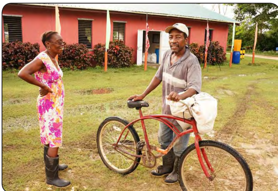
Two residents thankful for the food stuff distributed

was largely impassable, residents were unable to leave the village to stock on these basic food items. tive, while acknowledging his duty to the entire Nation as Minister of National Emergency Management.