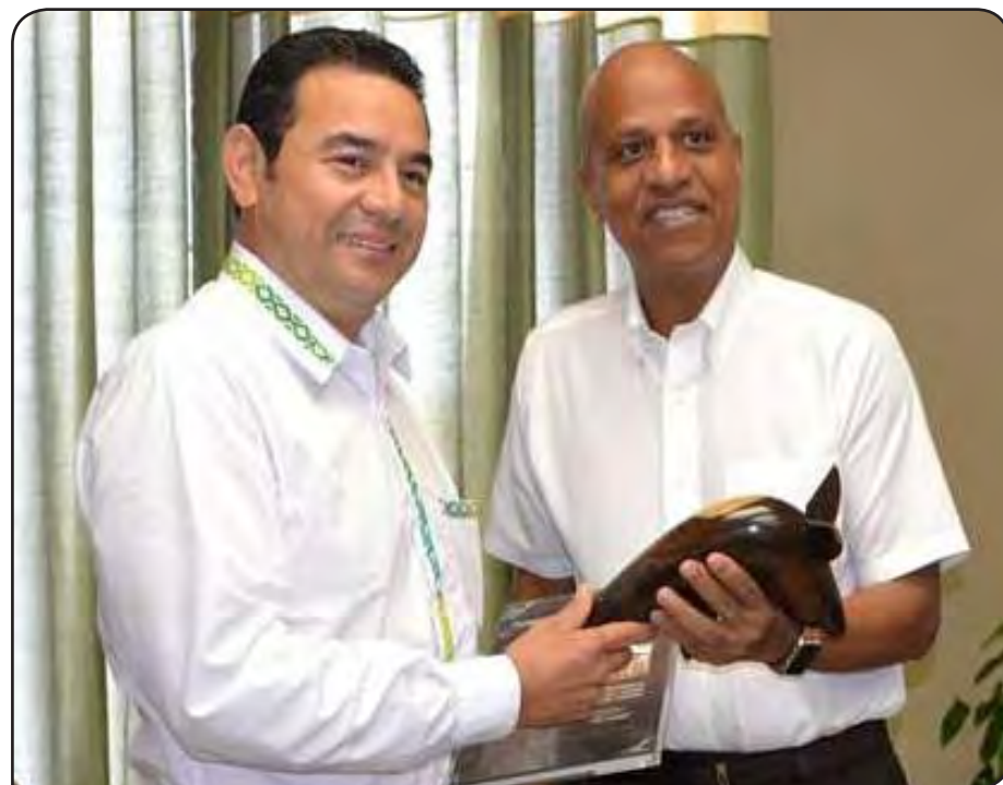
President Jimmy Morales and Prime Minister Dean Barrow Exchanging Gifts at the PM's Belize City Office

President-elect Jimmy Morales was accompanied by