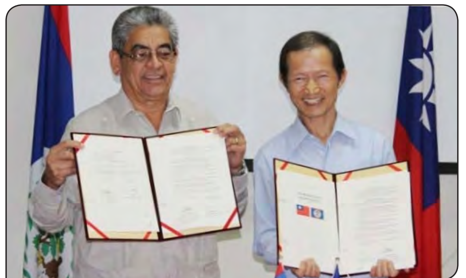
Deputy Prime Minister of Belize and Minister of Agriculture Hon. Gaspar Vega and Taiwan Ambassador H.E. Mr. Benjamin Ho

This project will complement other ongoing initiatives and place the industry on a firm footing for development. In particular, the traceability/registry component will provide the base on which an export market could develop.