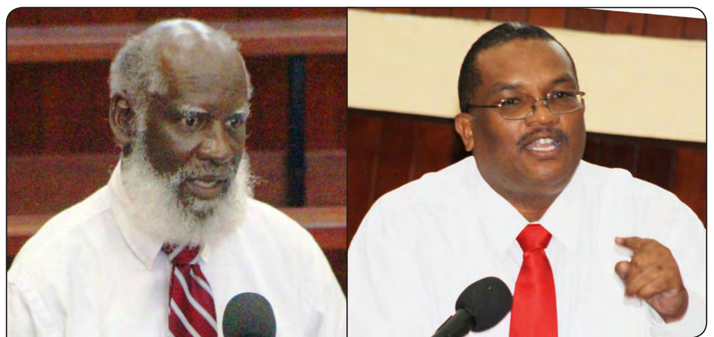
Hon. Wilfred 'Sedi' Elrington and John Saldivar, two of the most seasoned debaters in the House, alongside the master communicator himself, Hon. Dean Barrow, and the young lion from Collet, Hon. Patrick Faber

A four-time area representative, Patrick Faber is still one of the youngest members of the House of Representative, and he is clearly coming into his own. The impressive lineup on the