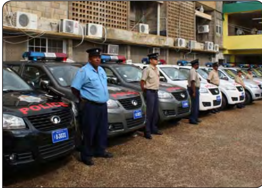
Designated Drivers pose with the New Vehicles at the Police Headquarters Compound in the City of Belmopan

The Police Department which has been consciously and steadily increasing the number of boots on the ground through regular new recruitment, is also consistently expanding its vehicular fleet, adding new wheels for better