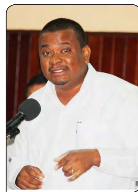
Hon. Patrick Faber debating in the House of Representatives

Responding to the most senior member of the Opposition and the House, Fort George Representative Hon. Said Musa, Faber noted that his constituency of Collet was one of the hardest hit by the pre-election flooding disaster. Faber told Musa that as an area representative it was his responsibility to ensure that the needs of his peo-