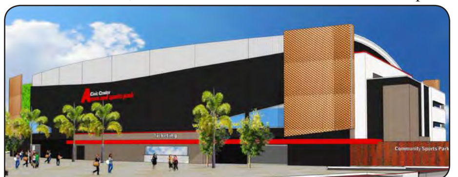
Side View of the New Belize Civic Center Design

The Government of Belize, through BIL, has committed to provide the residents of Belize City and the entire Country of Belize with an innovative, well equipped state-of-the-art Arena and Cultural Complex.