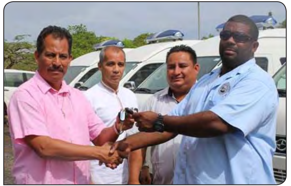
Hon. Pablo Marin handing over the new Ambulances

The Ministry of Health has added six new ambulances to its national fleet. The ambulances are being posted in Punta Gorda, San Antonito, Independence, Orange Walk, Dangriga and San Ignacio/Benque Viejo. They were officially handed over to the regional managers and administrators of the respective hospitals