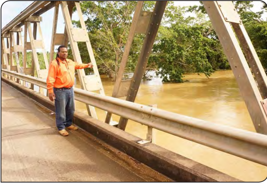
Hon. Edmond Castro at Bladen Bridge - River Flooded

In the wake of the United Democratic Party's third consecutive general election victory, Prime Minister Dean Barrow named the new Cabinet on Monday, November 16, 2015. The only three-time area representative on the government side who did not receive a full ministry this time around, Edmond Castro had, as acknowledged by the Prime Minister himself, expressed some initial dissatisfaction.