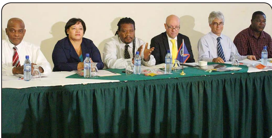
Honourable Edmond Castro at Head Table, flanked by Ministry CEOs, CDB Representatives and other officials at the opening

A news release from the Road Safety Project states, "We need to continue the ongoing battle to prevent needless death through drinking and driving, speeding, texting and driving, overtaking on curves, overtaking on double solid lines or unsafe places, or not wearing seat-belts or helmets or adequate protective gears to shield the brain."