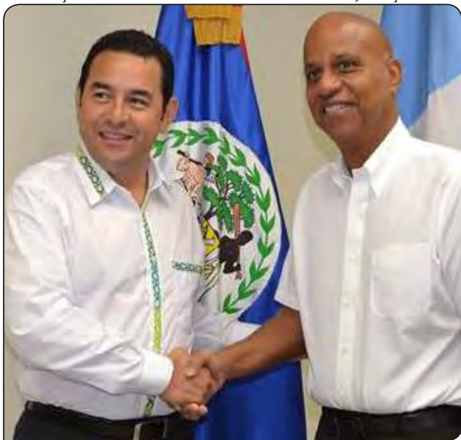
President Jimmy Morales and Prime Minister Dean Barrow Sharing a Cordial Handshake at the PM's Belize City Office