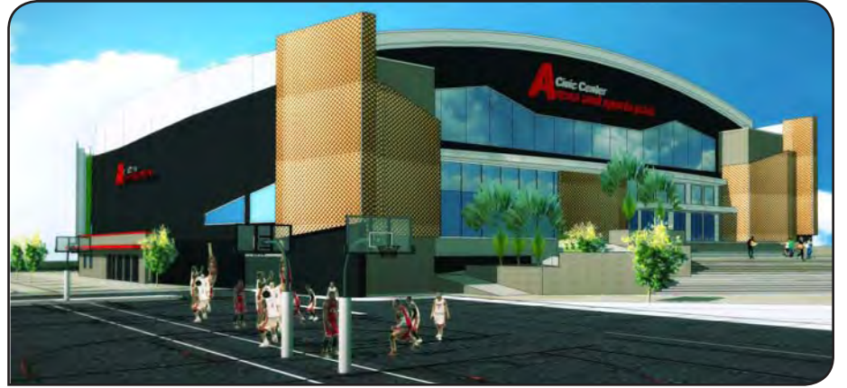
Front View of the New Belize Civic Center Design

Belize Infrastructure Limited (BIL), a public sector agency of the Government of Belize (GOB), has undertaken the design, construction and management of capital projects in Belize with current emphasis on sporting and other multipurpose facilities.