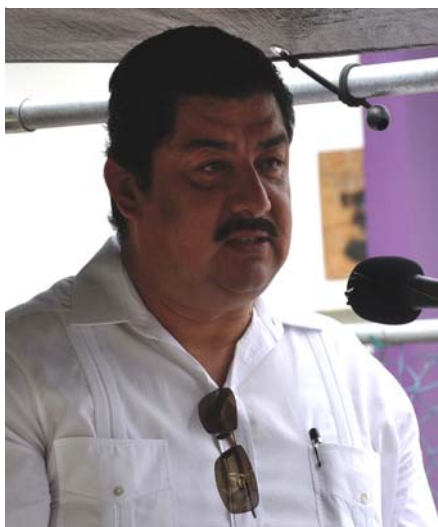
Delivering the Keynote Address, Hon. Erwin Contreras, Minister of Trade, Investment Promotion, Private Sector Development and Consumer Protection and Area Representative for Cayo West

The works will include the installation of proper traffic safety measures for ease of enforcement by the respective municipal traffic departments. The works will also address health issues that normally