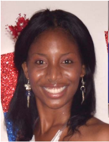
The New Queen of The West 2012 - 2013