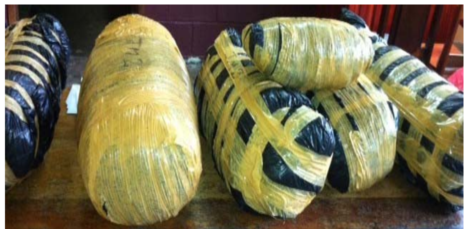
The 55½ Pounds Of Marijuana