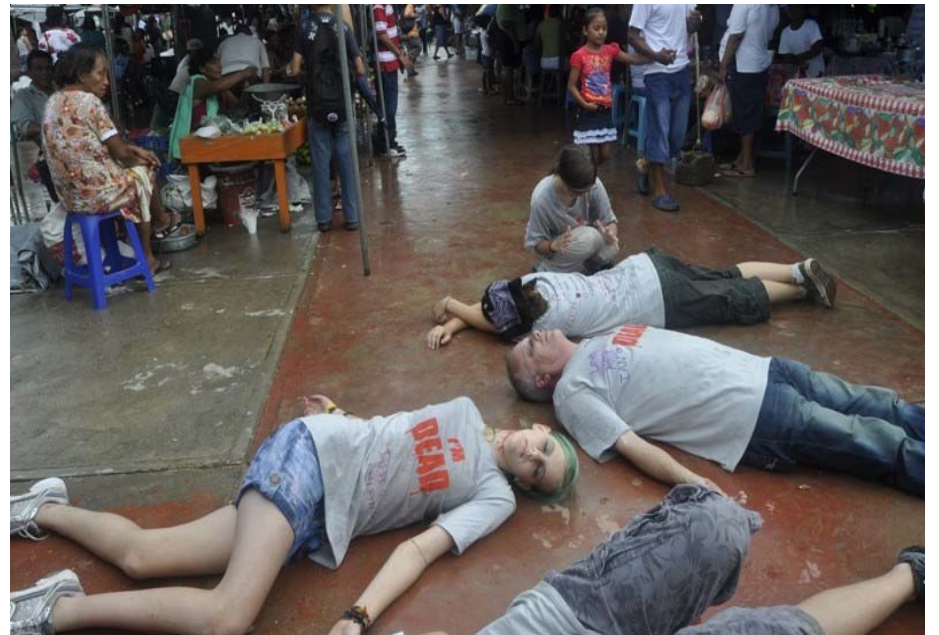
Students Lying Down In The Middle Of The Market

The group is planning another Ghost Walk to kick off Drug Awareness Week, as well as other activities designed to get teens and adults talking about the problem and solving it together. You can learn more on their facebook page