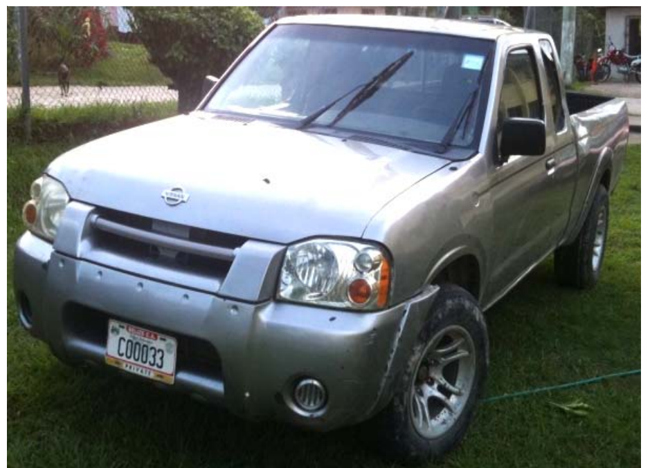
The Grey Nissan Pickup Truck with Belmopan private license plates C00033

While the search continues for the driver, police reports that a trace of the vehicle registration indicate that ownership of the Nissan was recently transferred from one owner to another.