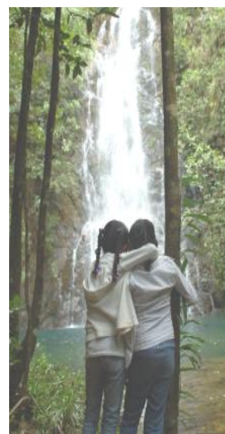
Admiring The Water Fall