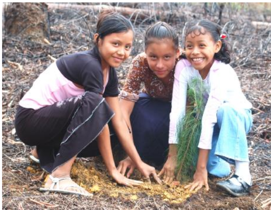
The Children Planting A Caribbean Pine Tree Seedling On The Scorched Earth Left By Recent Forest Fire That Ravaged The Pristine Mountain Pine Ridge

They paid keen interest to the lessons on the importance of trees, birds, snakes and tourism. They were also introduced to the employment prospects that Hidden Valley Inn has to offer as well as the various environmental projects in which the Inn is engaged including the Peregrine Fund's Orange-breasted Falcon Restoration Project and Belize Raptor Research Institute's study on the Stygian Owl as a means of teaching them the importance of conservation of flora and fauna.