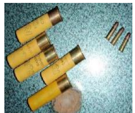
The Eight Bullets

other insignificant charges such of illegal entry ($1,000 - 6 months) by the Immigration Department as well as Forestry Department charges of illegal entry into a National Park ($150 - 3 months), Illegal conversion of forest products ($500 - 6 months), Unlawful possession of forest produce ($500 - 6 months) all of which are to run concurrently which, in effect, means that Coronado will simply serve out the two years sentence for the firearm charge which will automatically cancel every single one of the four other fines and sentences.