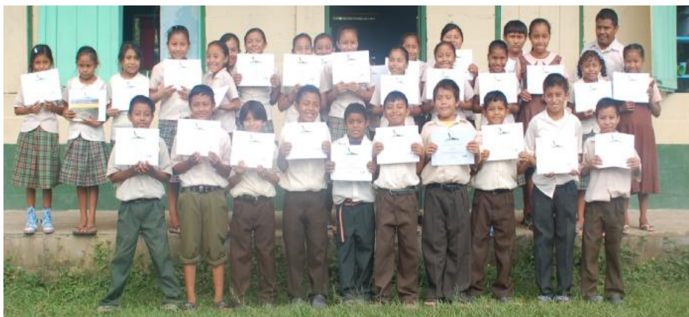
Displaying Their Certificates Received A Few Days After The Expedition

The children were taken to the highlights of Hidden Valley Inn's estate. Including a hike to the crown jewel, Butterfly Falls, the unique King Vulture Falls where they saw King Vultures and the rare and iconic Orange-breasted Falcon along with a panoramic view of the Tiger Creek Falls.