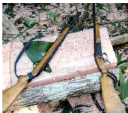
The Two Guns

other insignificant charges such of illegal entry ($1,000 - 6 months) by the Immigration Department as well as Forestry Department charges of illegal entry into a National Park ($150 - 3 months), Illegal conversion of forest products ($500 - 6 months), Unlawful possession of forest produce ($500 - 6 months) all of which are to run concurrently which, in effect, means that Coronado will simply serve out the two years sentence for the firearm charge which will automatically cancel every single one of the four other fines and sentences.