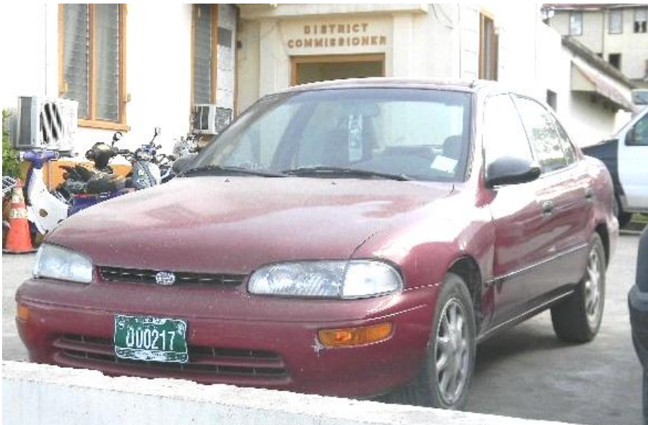
The Alleged Get-Away Car With License Plates D00217

family made the early morning trip from the village of Cristo Rey to open their business as usual at around 3:30 am. Activities were proceeding normally until shortly after 11:00 am when the husband stepped out on an errand. Lilian Juarez told the police that at around 11:20 that Saturday morning she was behind the counter inside the store when two male persons, with stockings over their faces, stormed into the store. One of them armed with a hand gun pointed it at her. They both jumped over the counter and removed the contents of her purse estimated at around five thousand dollars. In addition to the cash, they also made off with a lap top computer and a cellular telephone. Juarez estimates the total loss at seven