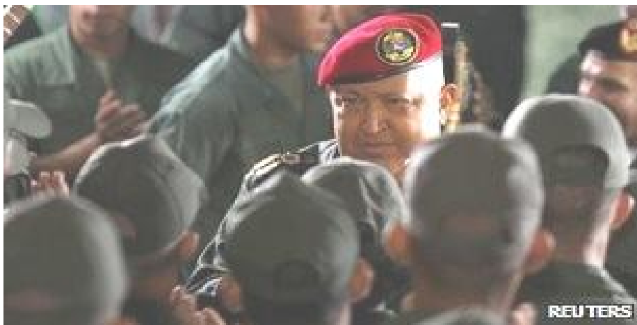
President Hugo Chavez reviewing the troops