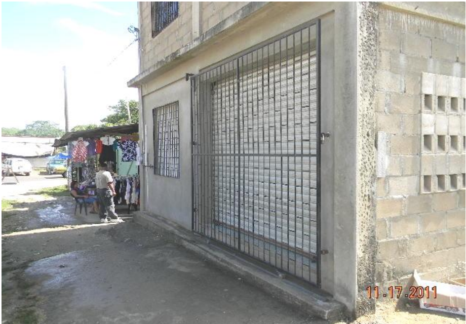
The Burglar Barred Candy Store - Normally Closed On Week Days - Opens On Saturdays

thousand three hundred and fifty dollars. With the loot and merchandise in hand the two robbers ran out of the store, boarded a small red taxi cab which sped off, passing in front of the police station, over the Hawksworth bridge, into Santa Elena and down the Western Highway. Armed with the identity of the driver and the D00217 license plate number of the car, police was on their way to the Red Creek residence of the driver but before reaching, they intercepted the car near Three Flags Supermarket in Santa Elena as it was heading back into town. The police took possession of the car, ordered the driver out and into the front passenger seat and drove it under escort to the station in San Ignacio.