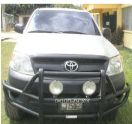
The Hilux pickup truck, with Guatemalan license plate P-175DGS Temporarily held at the police station in Benque Viejo Town