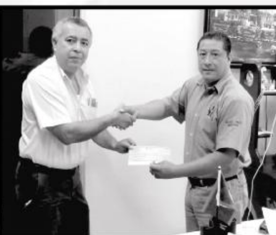
St Francis Xavier Credit Union