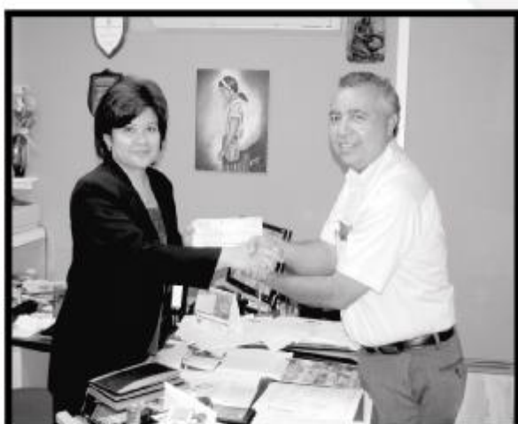
La Inmaculada Credit Union

For more information on the Student Loan Program, please contact the participating credit unions in your area.