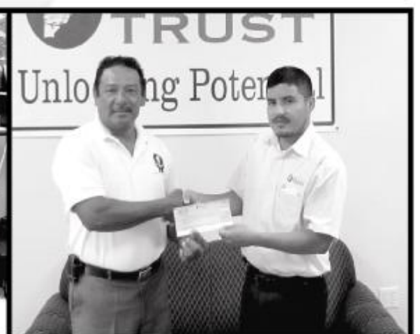
Toledo Teachers Credit Union

The Trust is a partnership between the Government of Belize and Belize Natural Energy Ltd.