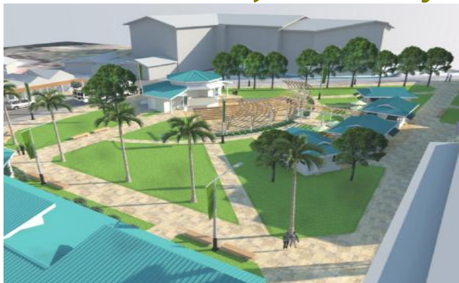
Architectural Concept of the Cayo Welcome Center