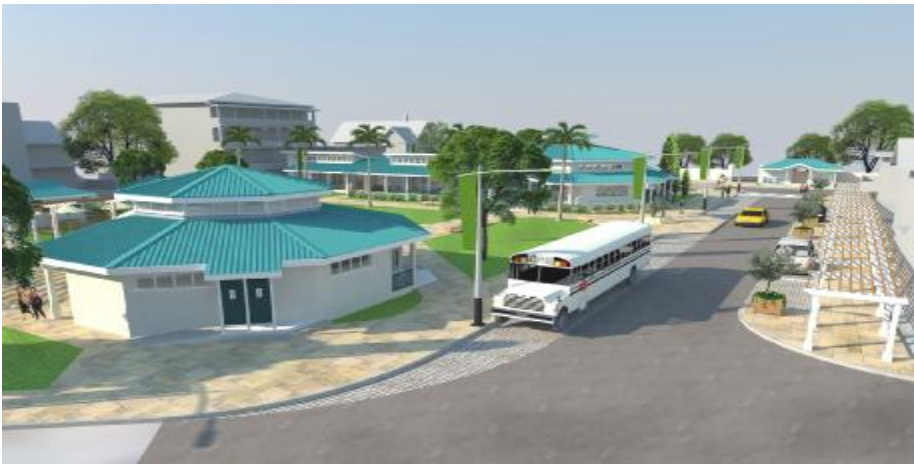
Architectural Concept of the Cayo Welcome Center from another angle

The Welcome Center – showcasing the attractions of the district and providing opportunities for the private sector to market their products and tourism offering. The interior design will maximize audience engagement with the opportunity for touch screen technology. It will create a sense of place, encourage exploration and above all welcome visitors with keen professionalism. Provision will be made for an area for the local schools and community to create displays and include