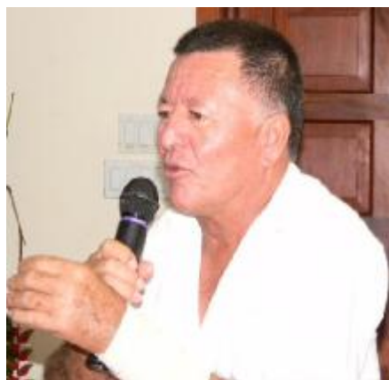
Tourism Minister, Hon. Manuel Heredia

infrastructure and this is one of those infrastructures that will be constructed in this community ”. Minister Heredia also used the opportunity to thank the Hon. Prime Minister for his unwavering support for the overall Sustainable Tourism project encompassing an investment of over 30 million dollars in the program country-wide.