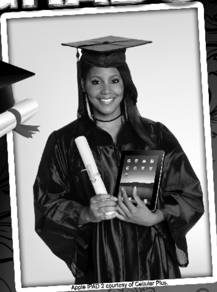
Apple iPad 2.