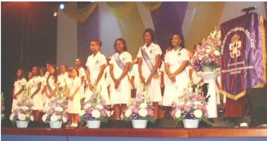
Anglican Cathedral College’s Class of 2011

The program ended just like it began with the benediction again led by Deacon Barbara Rosado after which the activity moved over to the Anglican Cathedral College where a variety of delicious food and refreshing drinks was served.