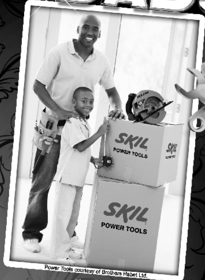
Power Tools courtesy of Brothers Habel Ltd.

Starting June 10th Get a DigiCell Package for $199