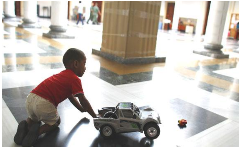
A male child plays in the courtyard of Venezuela's Foreign Ministry building, part of which President Hugo Chavez opened up to people left homeless by winter flooding. He also declared it legal for them to occupy some private properties.

That legal basis materialized in late January when Chavez issued a decree authorizing the takeover of land and buildings to provide housing for thousands of people left homeless by devastating floods over the winter. The government then relocated them to entire floors of