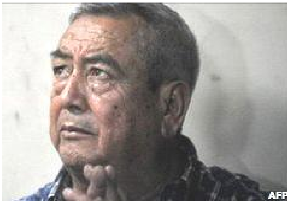
Waldemar Lorenzana, 71, could face extradition to the US

Lorenzana Lima, a Guatemalan national, was stopped in the municipality of El Jicaro, 65km (40 miles) from the capital, Guatemala City.