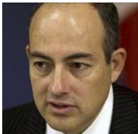
Former Attorney General, Arturo Chavez

Chavez's departure comes at a time of soaring violence in the drug war that has claimed more