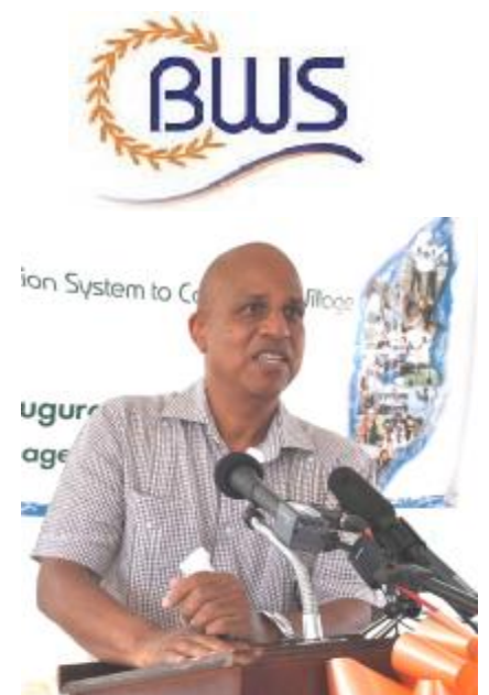
Hon. Dean Barrow, Prime Minister of Belize