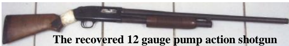
The recovered 12 gauge pump action shotgun