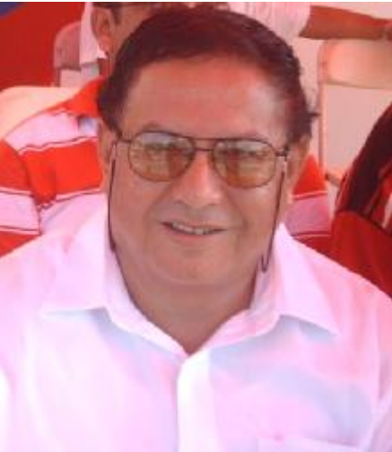
Minister of Agriculture and Fisheries, Hon. Rene Montero

The release ends by informing that the Government of Belize, though