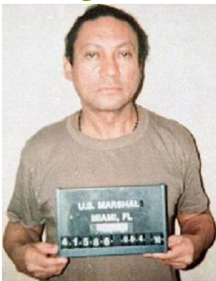
Gen. Manuel Antonio Noriega, 76

Noriega, who waged a long battle from his Miami prison cell to fight extradition to France,