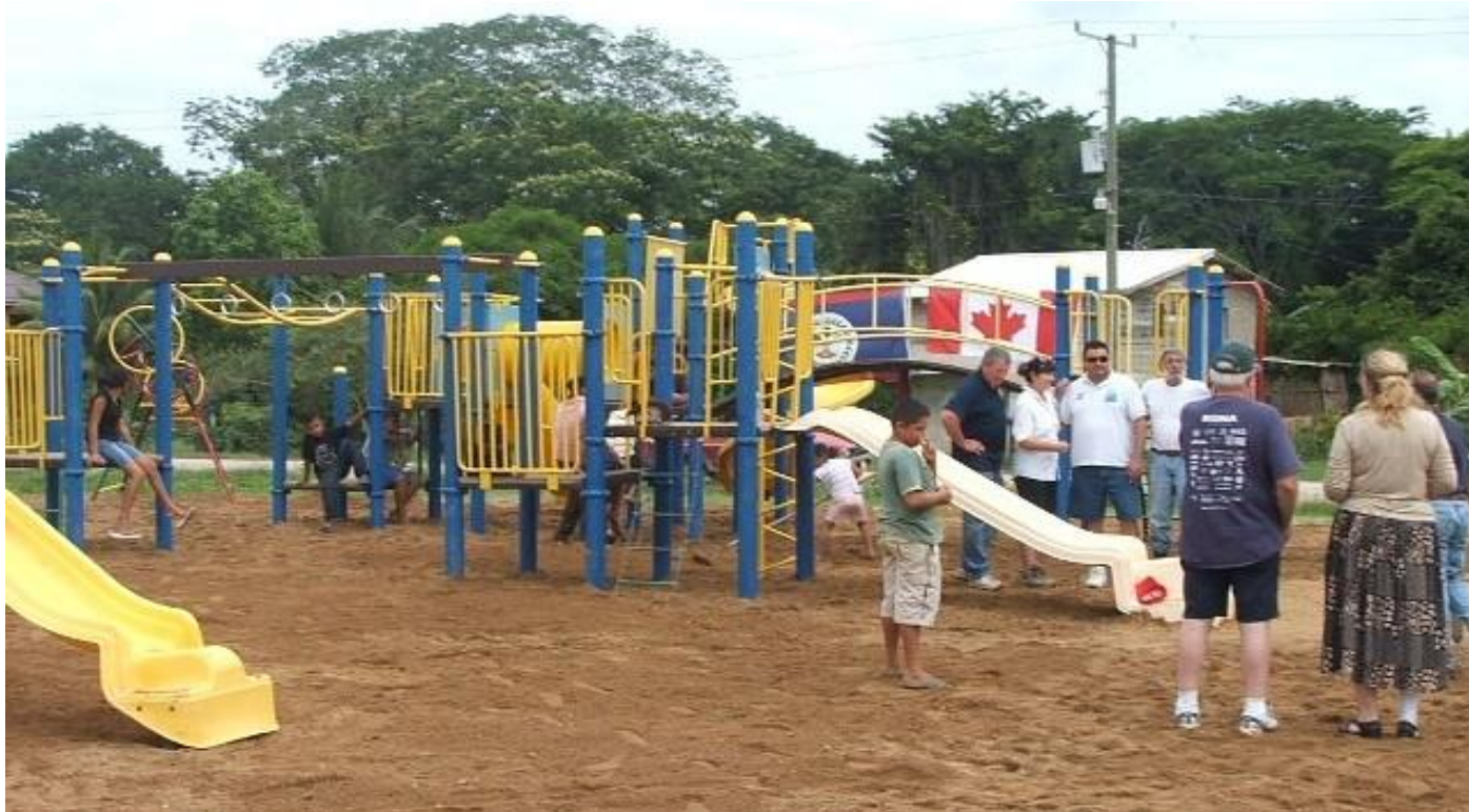
The Playground in Bullet Tree Falls Village, Cayo

The thanks of the people of Santa Familia are joined with Bullet Tree's in saying "gracias" to all of these wonderful people who came together to make this possible.