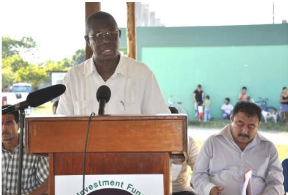
Hon. Edén Martínez, Area Representative and Minister of Human Development and Social Transformation, delivering the main address

These villages are considered poor communities along the