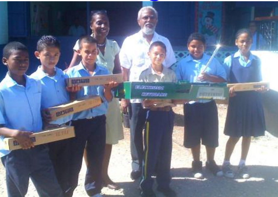
Governor General Presenting to the Principal and Students