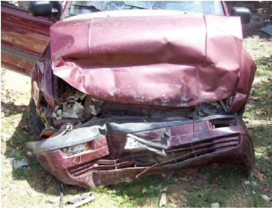
Front view of the Mitsubishi Mini-Van