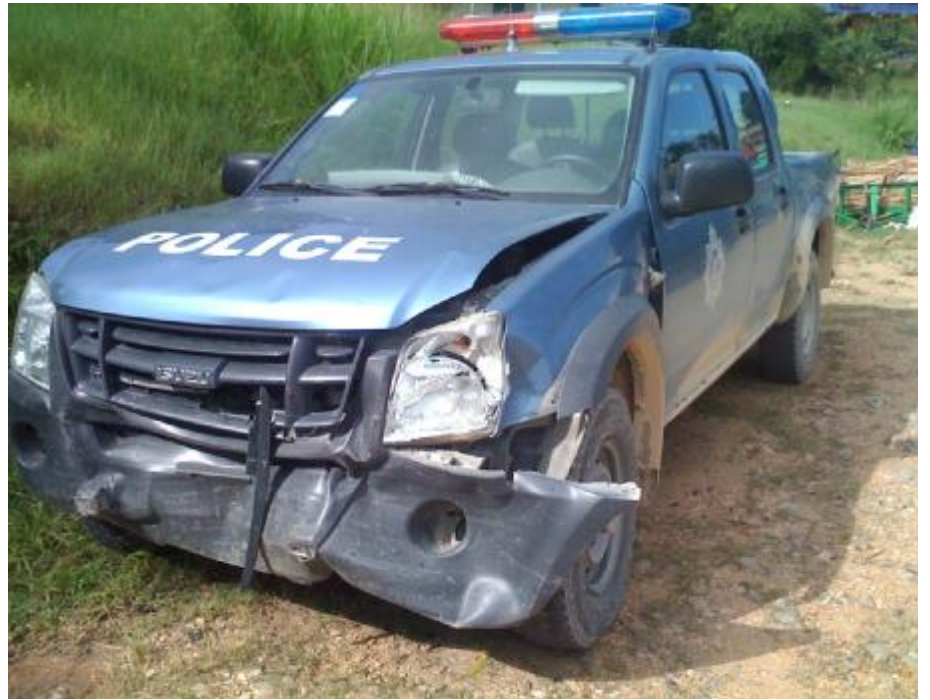
The police Izuzu D-Max pickup truck

SAN IGNACIO TOWN, Cayo, Monday, October 5, 2009: