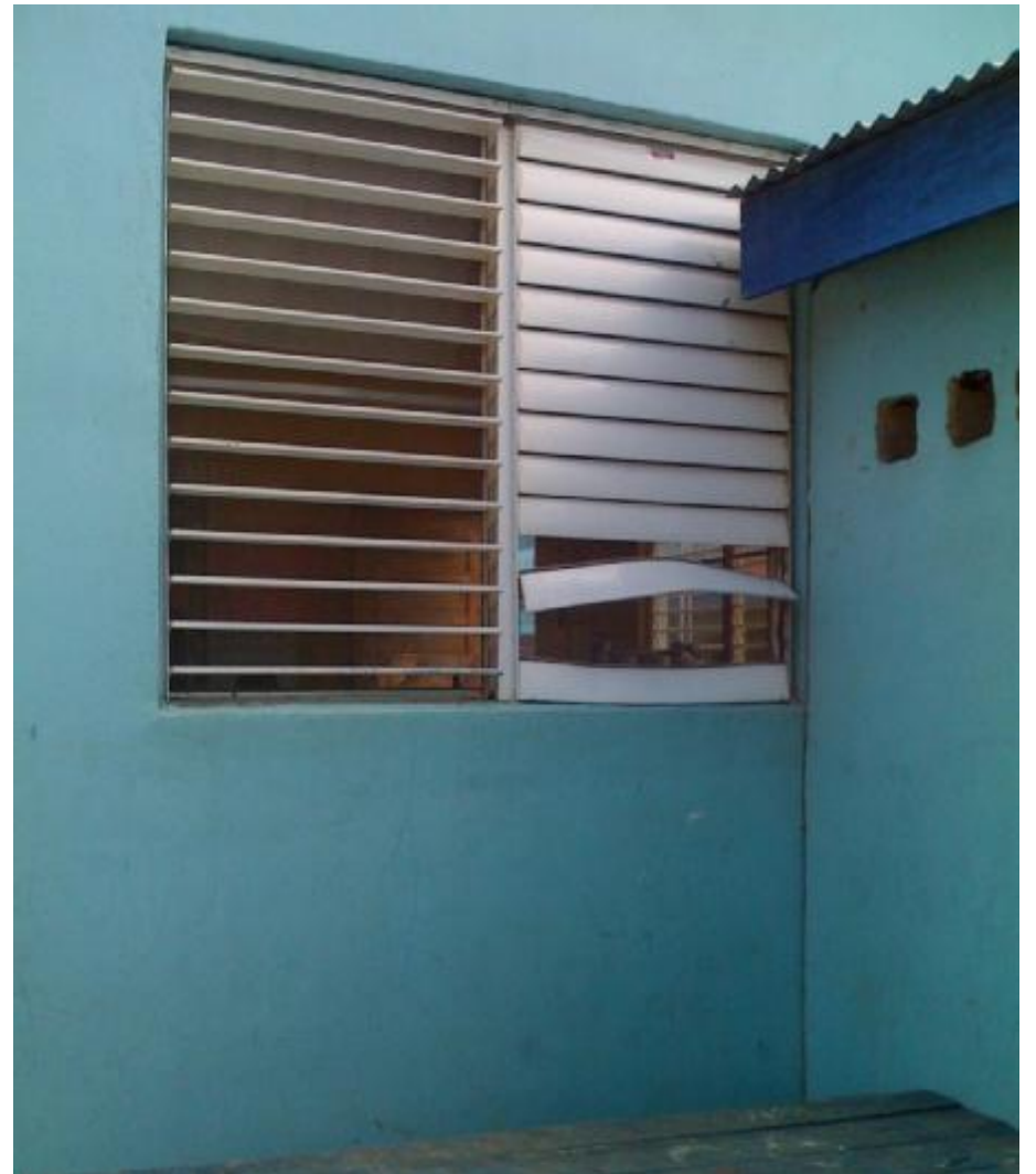
The suspected point of entry into the infant 1 classroom

He was obviously in the classroom with intention to steal and therefore the teacher's expression of surprise at seeing