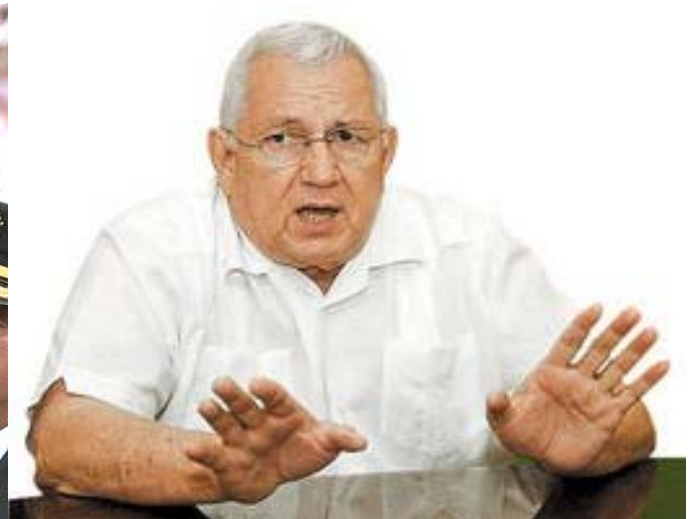
Coup Installed President Roberto Micheletti Bain

A source with close connections to the de facto government said Micheletti might now be willing to consider Zelaya's return if given assurances that the ousted president does not try to derail