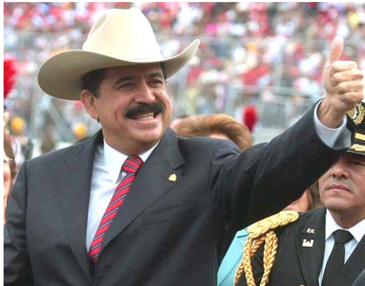
Ousted President Manuel Zelaya Rosales

"This dialogue, this effective communication should include all parts of civil society, our churches, professional groups, student groups, business associations, media