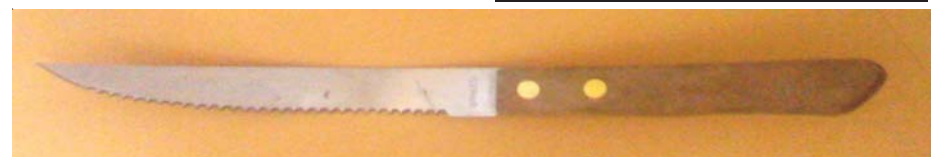
The Knife, Suspected To Be The Murder Weapon