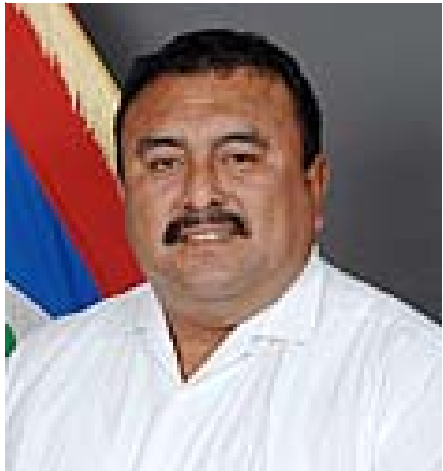
Hon. Gabriel Martinez, Minister of Labour, Local Government and Rural Development.

Just as the Hon. John Saldivar , Minister of the Public Service, Governance Improvement and Elections & Boundaries, is winding up his 10-week tour of all government offices countrywide, the news surfaced of the commencement of a nation wide tour by the Hon. Gabriel Martinez , Minister of Labour, Local Government and Rural Development.