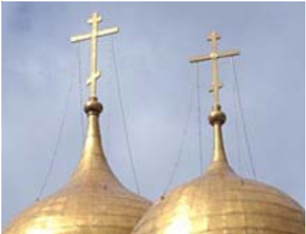
Thieves frequently target churches in Russian countryside

Local prosecutors had been informed and an investigation was under way, a spokesman for the local Russian Orthodox Church said. The disappearance of the Church of the Resurrection, some 300 km (186 miles) north-east of Moscow, was not