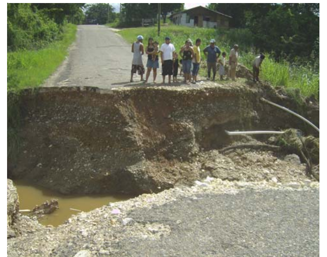
The Gap Caused By The Erosion

Westby additionally informed that the Ministry of Works is now charged with the responsibility to replace the culverts and repair the damaged roadway so that life in the area can return to normal.