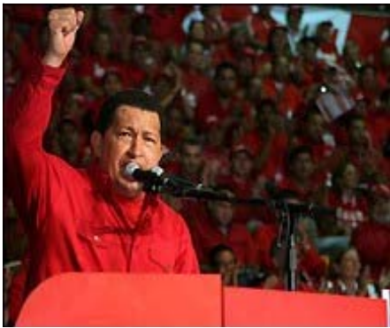
Venezuelan President Hugo Chavez

Such a move would be likely to increase US concerns at the growing ties between the two nations, correspondents say.