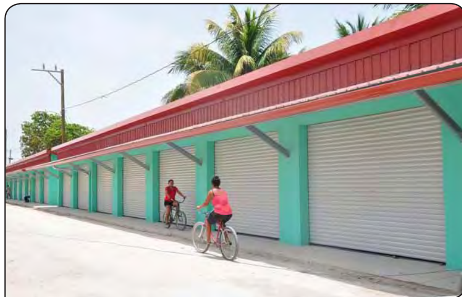
Rehabilitated Corozal Market, re-named Gabriel Hoare Market

In this regard, the paved surrounding streets, namely 1st Street South & 6th Avenue, will facilitate and provide Corozaleños, in particular pedestrians and drivers, with better access to smoother road surfaces, thus enabling men, women and children to traverse this area