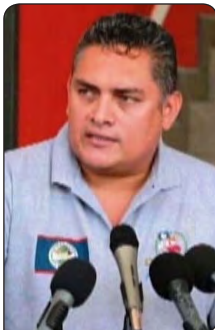
Hon. Elodio Aragon - Minister of State for Youth and Sports