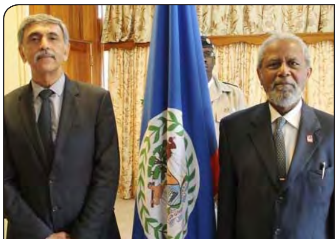
H.E. Aitzaz Ahmed, Ambassador of the Islamic Republic of Pakistan and the Governor General