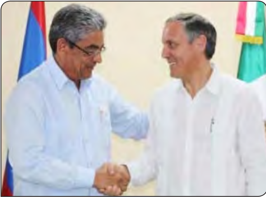
Hon. Gaspar Vega and H.E. Ambassador Bruno Figueroa

In Belize 'Mesoamerica without Hunger' drives the Pilot Project of sustainable schools in the Toledo district