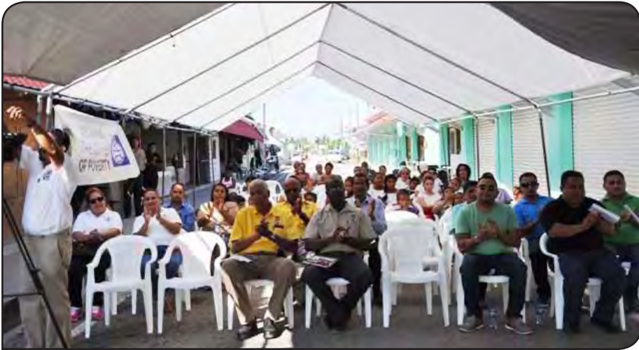
Invited Guests at the Inauguration of Rehabilitated Corozal Market