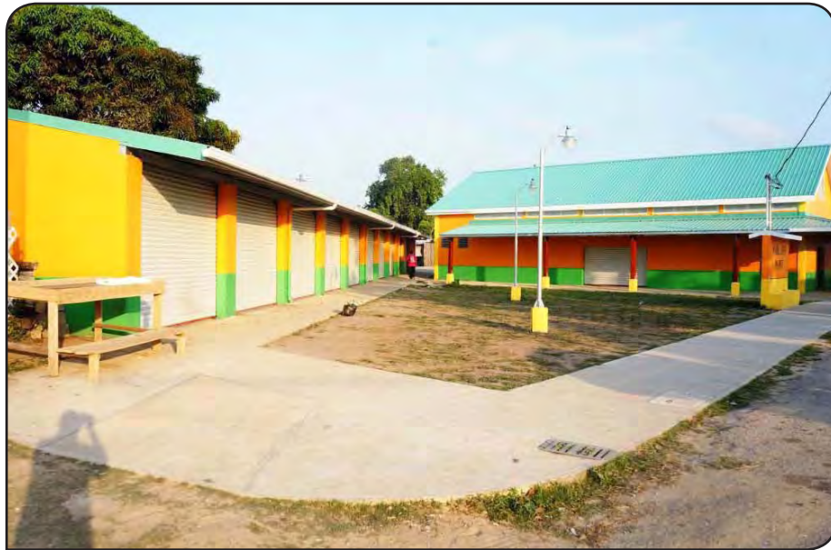
The recently inaugurated Punta Gorda Market renamed the MAURA LOPEZ MARKET in honour of one of Punta Gorda's outstanding women, refurbished at a cost of almost a Million Dollars, with funding by the European Union and Government of Belize

Renamed the MAURA LOPEZ MARKET, tribute to one of the outstanding women of Punta Gorda, it was refurbished at a cost of almost a Million Dollars with financing from the European Union and the Government of Belize. That project included the refurbishment of the old structure to accom-