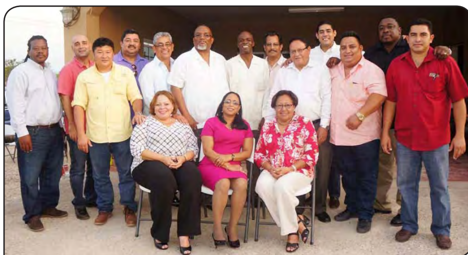
16 of the 19 area representatives and constituency caretakers who are endorsing Honourable John Saldivar for UDP Deputy Leader, including 13 out of 19 members of Cabinet

The post was left vacant by Deputy Prime Minister Hon. Gaspar Vega when he announced his decision not to seek re-endorsement as the Party's Deputy at its National Convention in Dangriga on Sunday, March 20, 2016. The day after that national convention, Monday March 21, 2016, two aspiring candidates publicly confirmed