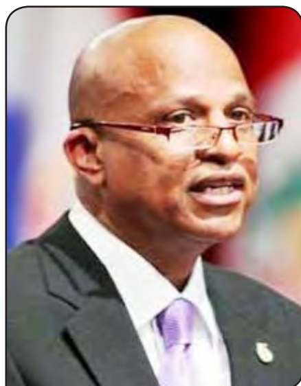
Right Hon. Dean Barrow Prime Minister of Belize

Following his meeting with the Prime Minister, Briceno commented, "We felt that it was important for us to meet to have a better analysis or understanding of what really is taking place. We in the PUP have said that when it comes to the unfounded claim that Guatemala has over Belize, that it is something of national importance, and that it is something that all of us are supposed