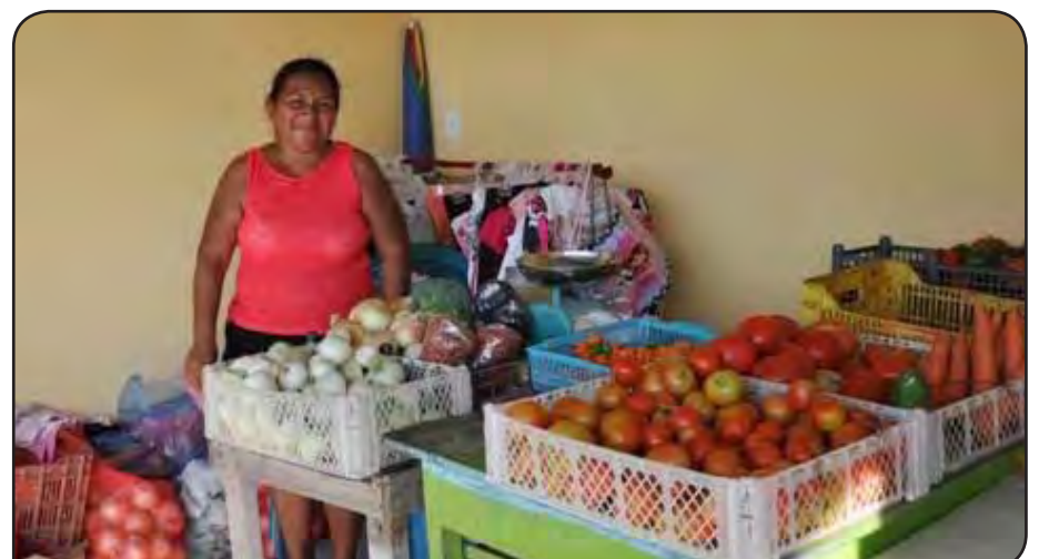
A Vendor in the Newly Rehabilitated Corozal Town Market