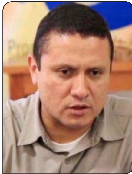
Carlos Raul Morales Guatemalan Foreign Minister

Hon. Elrington, who has often been accused by the local press of being blunt and insensitive in his public comments on the Belize Guatemala issue,