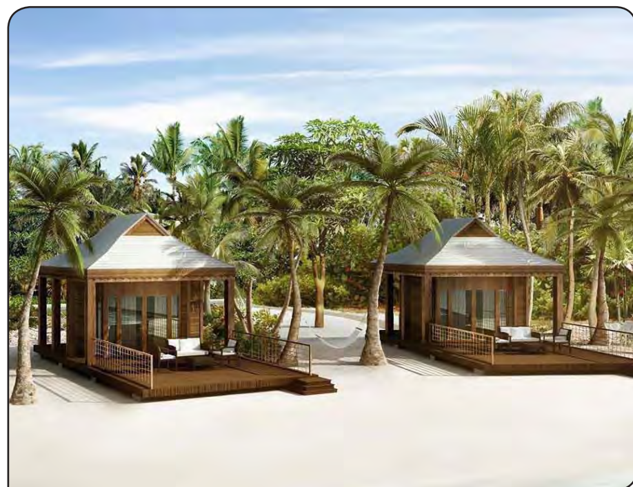
Massive Investment on Harvest Caye by Norwegian Cruise-Line