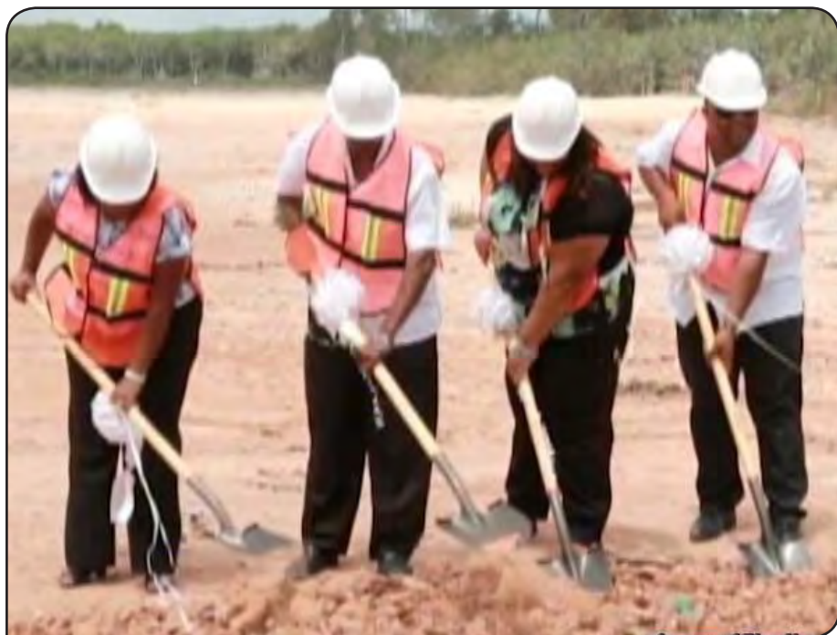
Ground being broken for the Lake Independence Resource Center

The Lake Independence Resource Center project is scheduled to be completed by September, 2016.