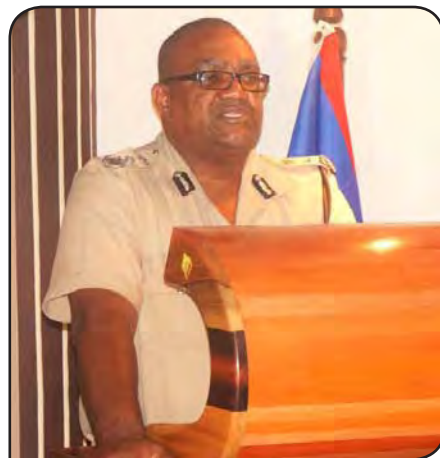
Mr. Allen Whyllie Commissioner of Police

A s Minister of National Security, Hon. John Saldivar is currently on a nationwide tour of Police Formations to re-assess and re-evaluate the effectiveness of the Police and explore ways of improving the work of the Department in its fight against crime and its function of increasing safety and security throughout our communities.