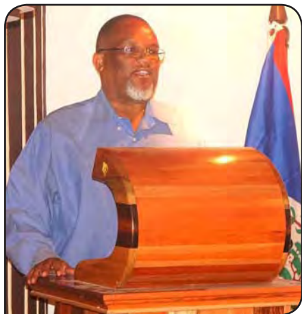
Honourable John Saldivar Minister of National Security

“In spite of the scarce resources, I continue to believe that the biggest resource that can contribute to the fight against crime is right here in your heart”