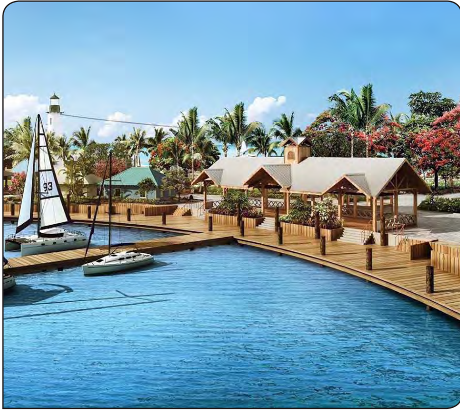
Massive Investment on Harvest Caye by Norwegian Cruise-Line

Last week, the owners of the project, Norwegian Cruise Lines, invited the Belizean media for a local launch of the facility and updated them on the status of the project. Head of Destina-