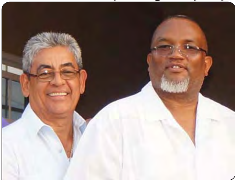
Deputy Prime Minister Hon. Gaspar Vega and Aspiring Deputy Hon. John Saldivar in Belmopan Tuesday following Cabinet Meeting

The Post of UDP Deputy Leader was made vacant by his voluntary resignation a month ago; and now he is making it known who he wants to succeed him as Deputy Leader of the Party.