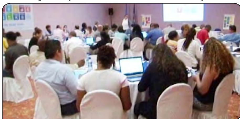
UNDP Meeting on Sustainable Development Goals held in Belize City

terms of the Millennium Development Goals, but when you say the 2030 agenda or post-2015 sustainable development goals, we don't mean that we stop what we've been doing with the MGD and move to the new agenda. It's a continuum actually, but the new agenda brings the opportunity to expand those eight goals to seventeen goals. For example in the past there was an education goal. It continues to be an education goal. There were health goals. It will continue as well. Those for which we have not achieved the full extent will be achieved during the SDG era."