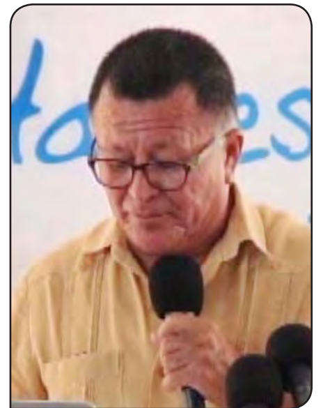
Honourable Manuel Heredia Belize Minister of Tourism

So we chose Belize because Belize it is the jewel, and we felt that it is a wonderful passenger experience, and we just felt that creating something in the South was the right direction for us. So we are very proud, as I say, today," the NCL Vice-President expressed.