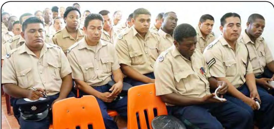
Room full of officers from Toledo Formation prepare for open session with the Police Minister Hon. Saldivar and Commissioner Whyllie