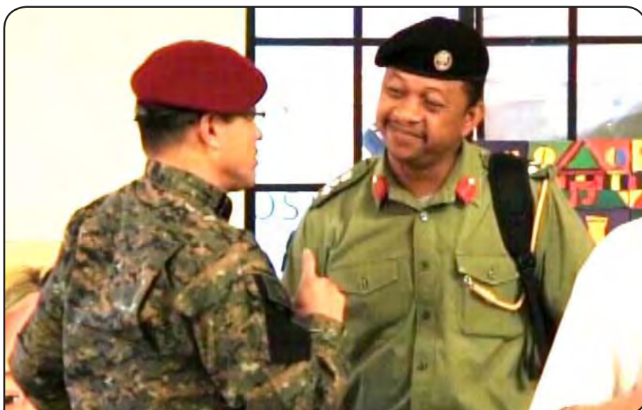
Guatemalan General speaking with BDF General David Jones

It is important to understand that cooperation between both countries is very important to work against organized crime. Organized crime works in both countries, and organized crime is present in different areas of both countries; and the only way