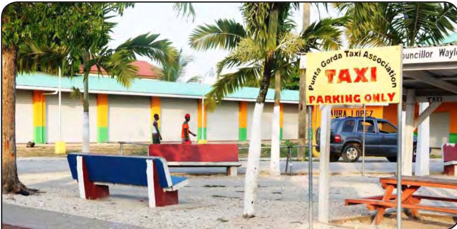
The recently inaugurated Maura Lopez Market in Punta Gorda

The market was inaugurated on January 21, 2016, but the images we bring you were captured just two weeks ago while on an assignment in the South.