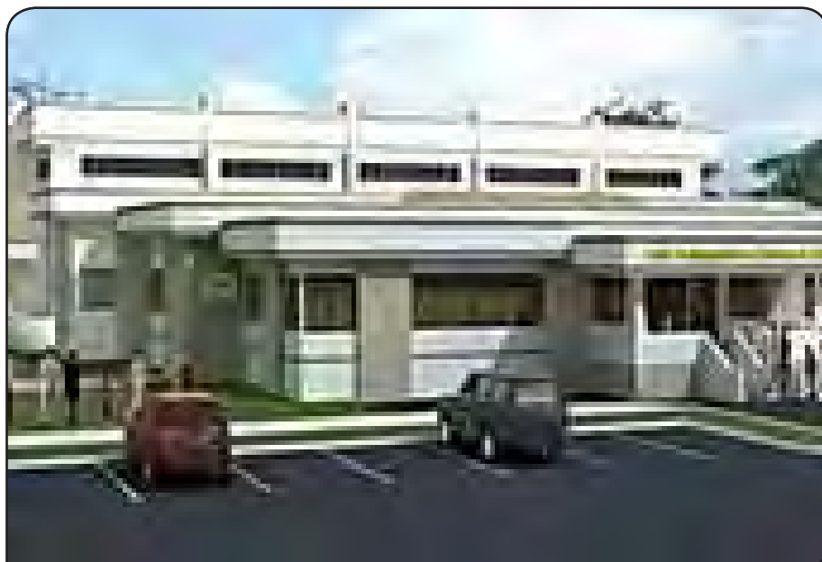
How Lake Independence Resource Center will look when completed