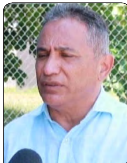
Hon. John Briceno Leader of the Opposition