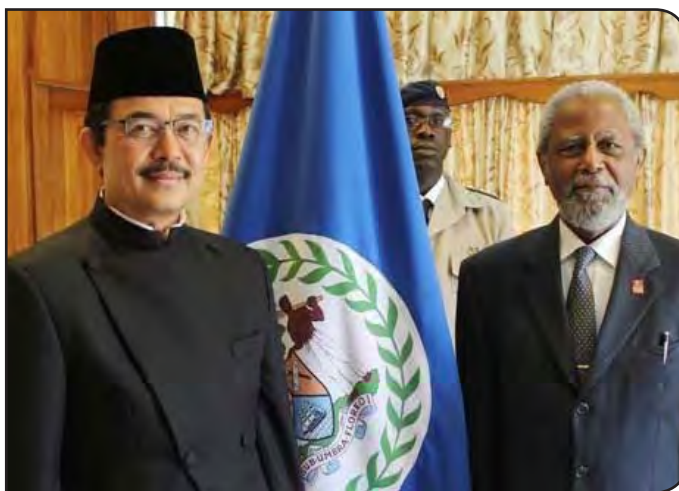
H.E. Yusra Khan, Ambassador of the Republic of Indonesia and Governor General Sir Colville Young

Four ambassadors presented their credentials to the Governor General of Belize H.E. Sir Colville Young on Monday, April 11, 2016 at Belize House in the City of Belmopan.