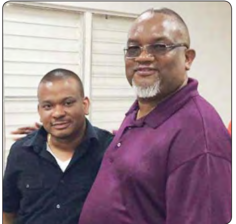
Hon. Patrick Faber and Hon. John Saldivar at Saturday's UDP National Party Council Meeting pledging to keep it positive and clean