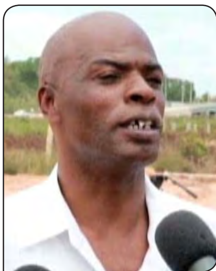
Honorable Anthony Martinez Minister of Human Development Social Transformation and Poverty Alleviation

Speaking with Channel Five News, Minister of Human Development, Social Transformation and Poverty Alleviation, Hon. Anthony 'Boots' Martinez stated, "It is a welcomed initiative, in my view. I think that I support it wholly because, by extension, this project is not only for Lake Independence, you know; it is for the south-