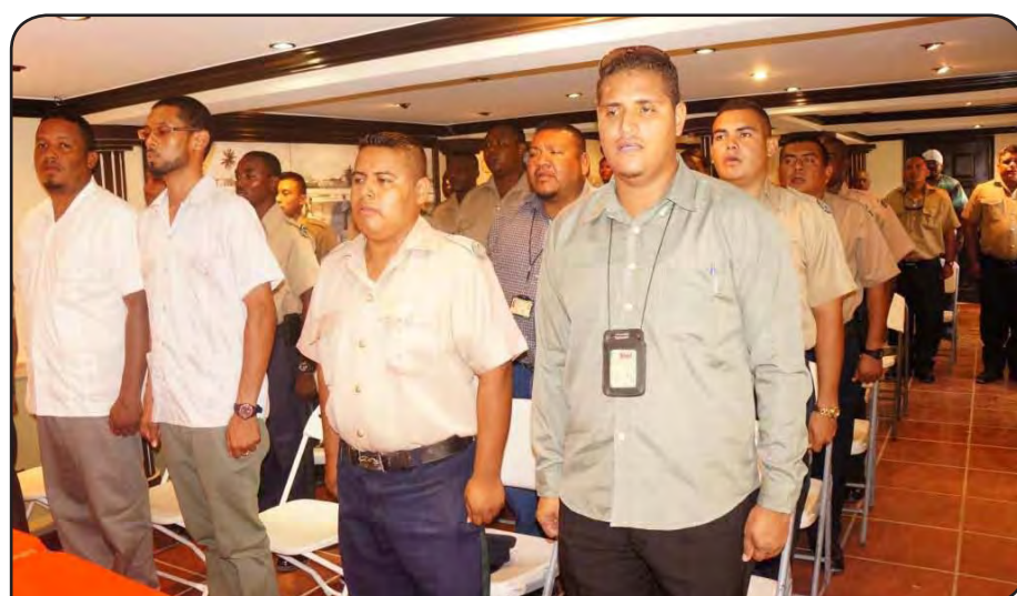
Police Officers of San Pedro Formation sing Belize National Anthem