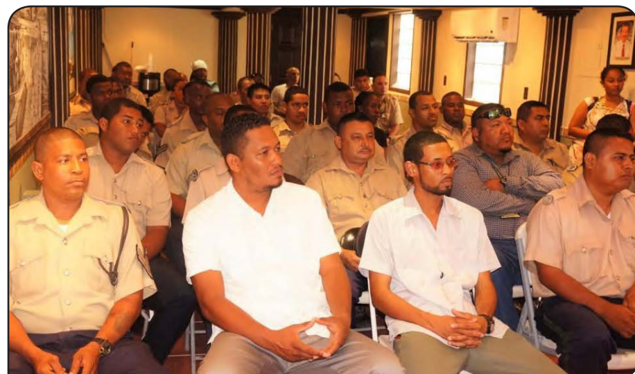
A Conference-room full of Police Officers from San Pedro Formation