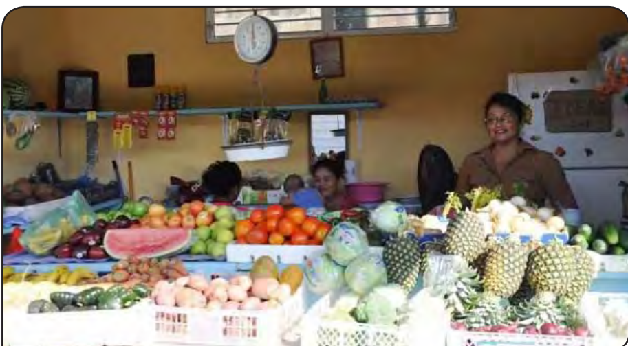
A Vendor in the Newly Rehabilitated Corozal Town Market

(The BMDP is a $30 million dollar project financed by the Government of Belize through a loan from the World Bank. The project, which aims to provide much needed infrastructure in seven major municipalities in the country, is being implemented by the Project Implementation Unit (PIU) of the BMDP, under the umbrella of the Social Investment Fund; and aims to provide access to basic municipal infrastructure, and enhance municipal management in selected Town and City Councils of Belize: Belmopan, Benque Viejo del Carmen, San Ignacio and Santa Elena, Dangriga, Punta Gorda, Corozal and Orange Walk.)