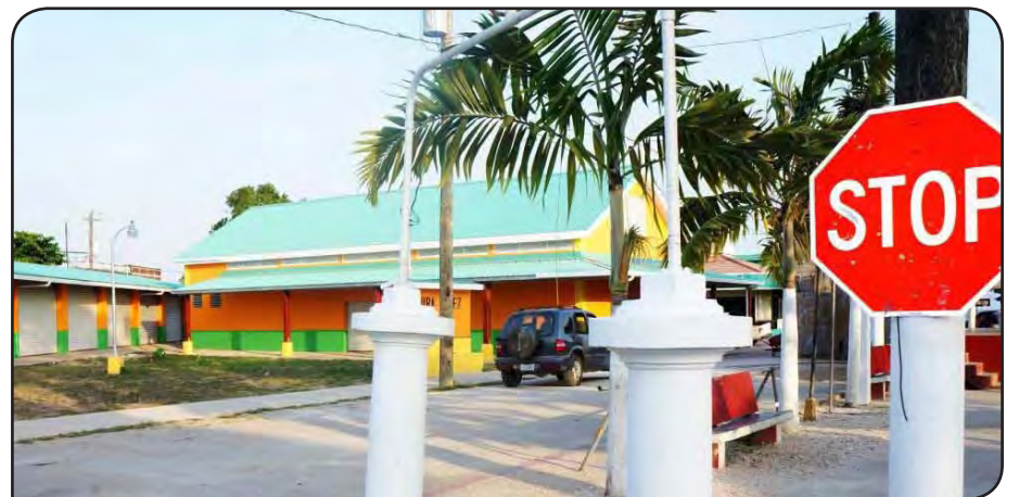
The recently inaugurated Maura Lopez Market in Punta Gorda