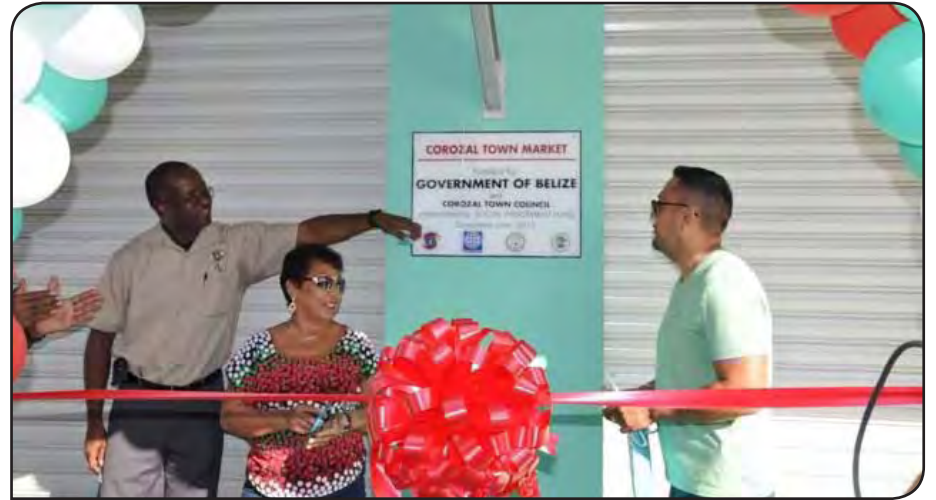
The Symbolic Cutting of the Ribbon to mark the Inauguration

The newly rehabilitated Corozal Town Market Annex and surrounding streets, built by the Government of Belize at an estimated cost of $298,757.30 and $390,543.00 respectively, through a loan from the World Bank under the Belize Municipal Development Project (BMDP) with counter-part funding of three per cent by the Corozal Town Council, was officially inaugurated on Friday April 8, 2016.