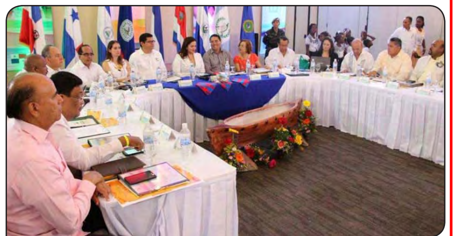
Hon. Aragon among Regional Secretaries of Education and Culture

This past Friday and Saturday, April 1 and 2, 2016, Minister of State in the Ministry of Education, Youth and Sports, Honourable Elodio Aragon was in Tela, Atlántida, Honduras, where he attended a two-day meeting for Central American Secretaries of Education and Culture.