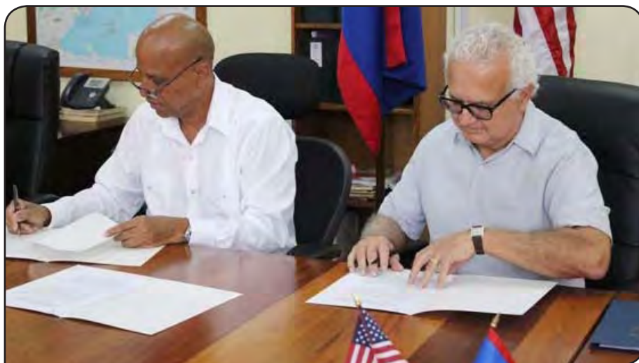
Signing the Agreement, Prime Minister of Belize Right Honourable Dean Barrow and United States Ambassador H.E. Carlos Moreno

The U.S. Government has provided over $35 million in programs and grants to Belize through the Central America Regional Security Initiative (CARSI) since 2008. The current agreement provides USD $6,450,000 in funding to be used for the following projects: Improved Border Inspection, Vetted Units, Capacity Enhancement, Justice Sector Reform, and Community Policing. To date, the US Government, through