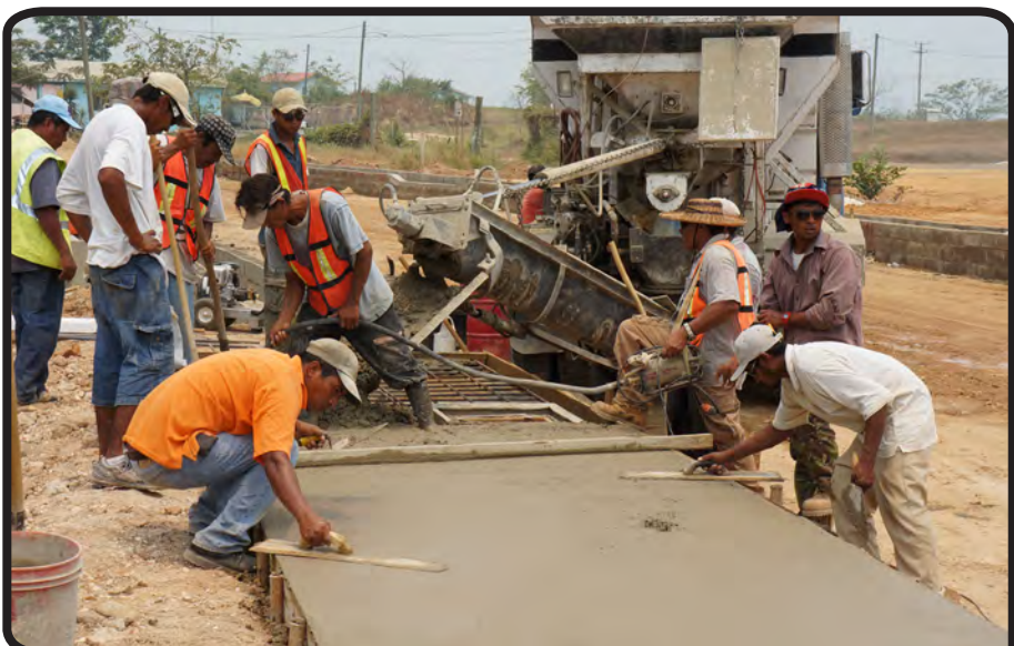
Workmen building side-walk drain on La Loma Luz Boulevard