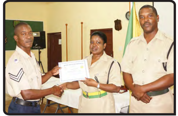
Three of the Twenty One Participants in the Adjudicators and Presenters Course receiving their certificates at the Closing Graduation Ceremony