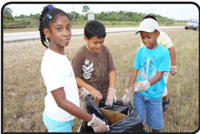
Younger members of the Cleanup Crew

"It's a dirty job, but someone has to do it." Well, in for the Audubon Society, which normally spearheaded