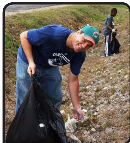
Leading by Example

The cleanup campaign was belatedly in observance of this years' Earth Day, celebrated on April 22, 2013.