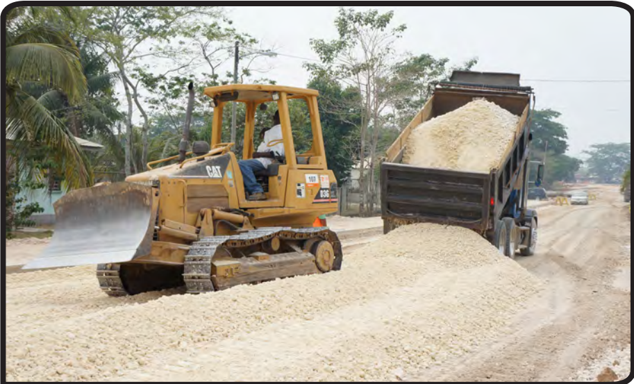
Bulldozer and Dump-Truck on La Loma Luz Boulevard

The first phase of the project, defined as Lot 1, is for the upgrading of La Loma Luz Boulevard, which begins the new loop from the Western Highway