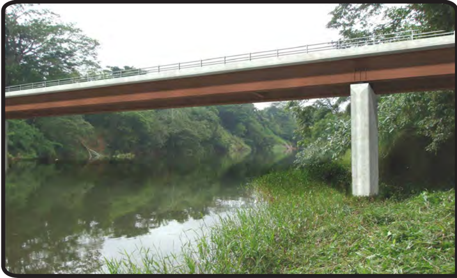
What the new Macal River Bridge will look like when completed

dent levels of national debt is onerous enough, but the weight is made much heavier and unbearable by the fact that when one looks around, there is virtually nothing to show for the over 2 Billion (with a B) in national debts racked up by the Musa Administration during its ten long years in office.