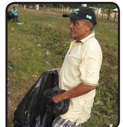
Another Exemplary Senior