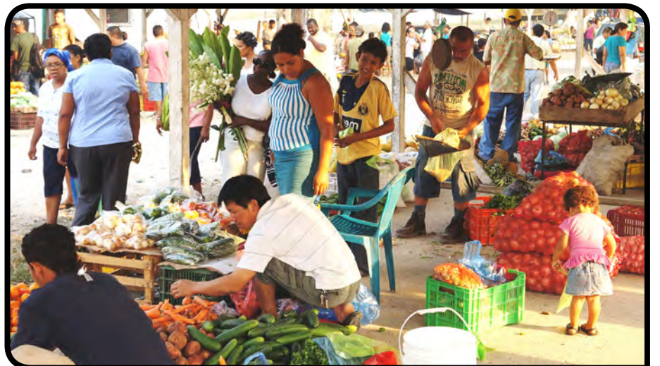
The lively and colorful atmosphere of the marketplace

One of the added benefits of the temporary venue is the fact that there is abundant parking space, both immediately in front of the show grounds,