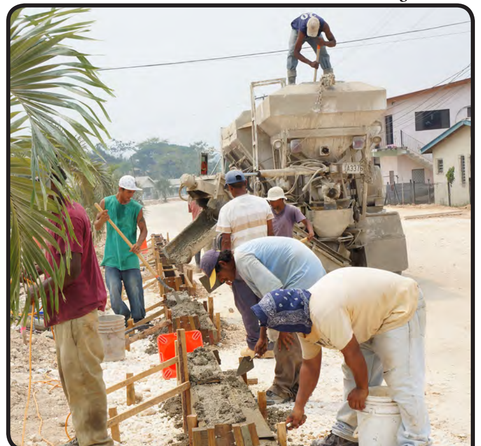
More skilled workers on La Loma Luz Boulevard