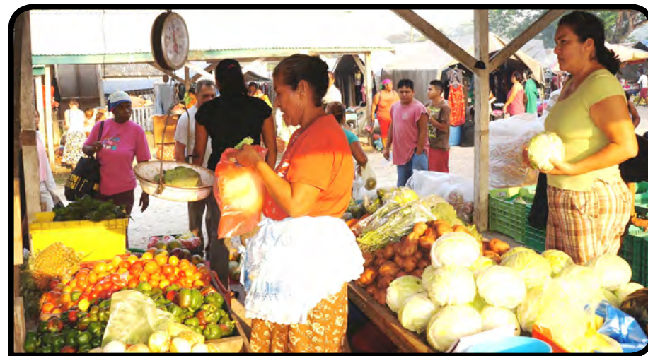
Inside one of the busy fresh fruit and vegetable stalls

and determination of the Belmopan City Council, in concert with the Central Government, aided by grants from friendly governments and concessionary funding from multi-lateral international agencies.