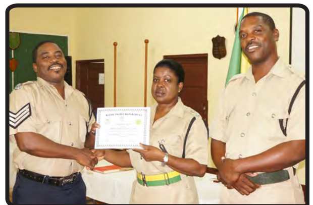
More Participants in the Adjudicators and Presenters Course receiving their certificates at the Closing Graduation Ceremony