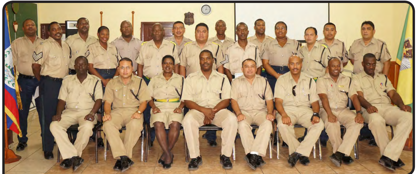
All participants in the Course along with coordinators from the Police Training Academy