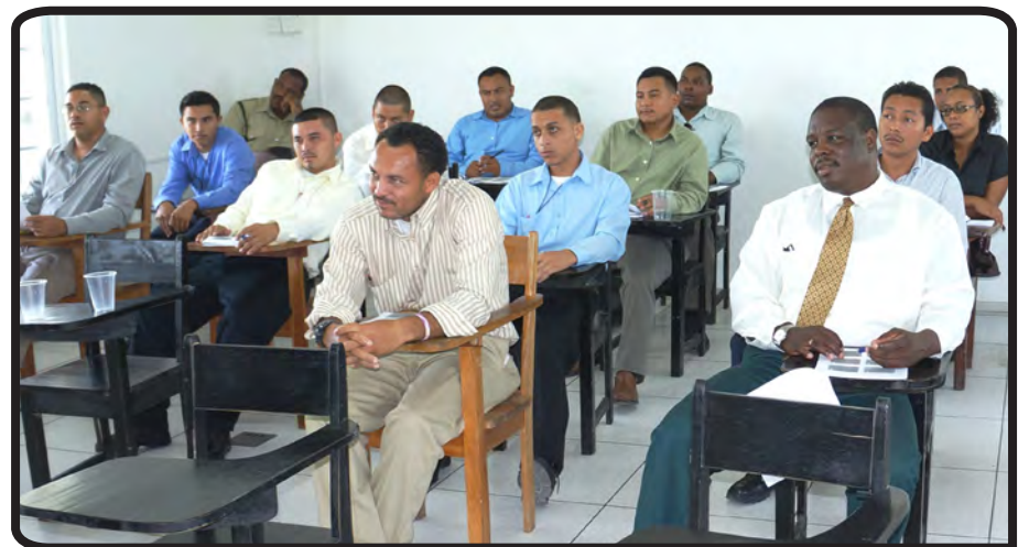
Participants in the National Crime Investigators Training Course

Three new training courses got underway last Monday morning, May 13, 2013, at the Belize National Police Training Academy in Belmopan.