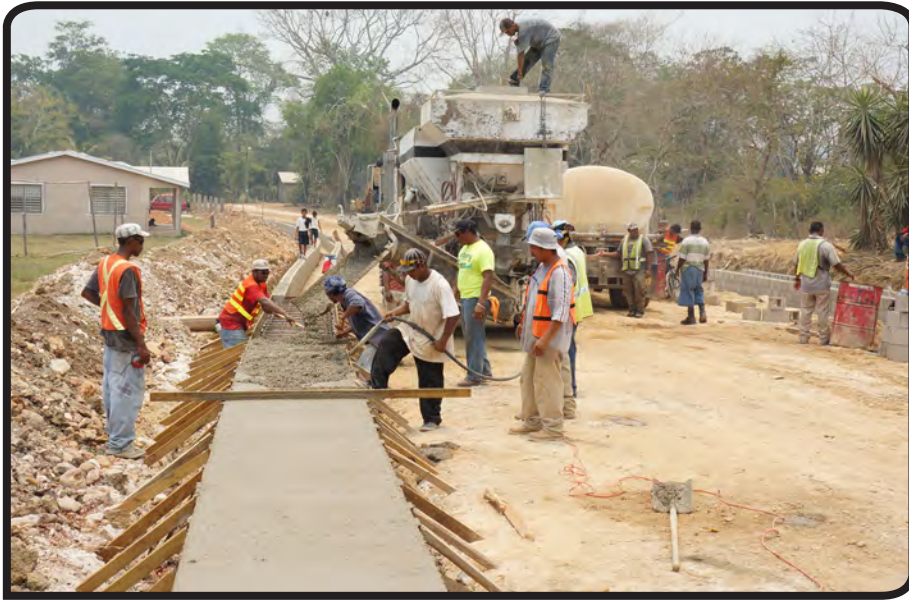
Much-needed Employment created by the Project

The western limit of the San Ignacio-Santa Elena Bypass project is at the junction of Benque Viejo Road with the