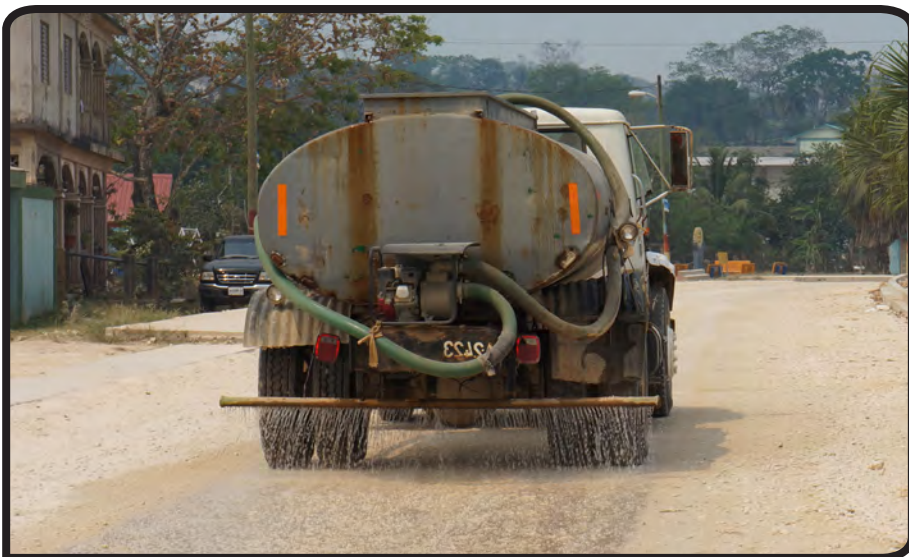
A Water-truck wetting La Loma Luz Boulevard

Ministry of Works. The works include a review of the pavement design, to determine different design scenarios for undercut situations, drainage and intersection design.