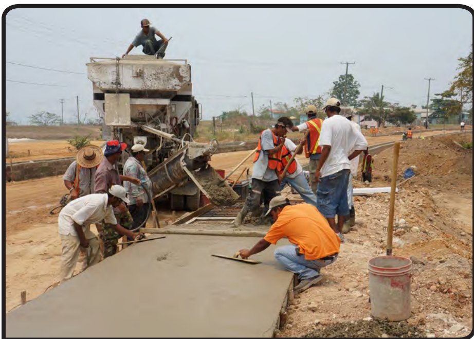
A number of skilled workers preparing another sidewalk-drain

high-level bridge crossing of the Macal River will have a steel composite deck with reinforced concrete piers located on each side of the river channel, and reinforced concrete bank-seat abutments at each end of the bridge. The piers and abutments will be founded on driven steel H piles. The steel composite bridge deck will be fabricated in steel with improved atmospheric corrosion properties (weathering-steel), and will be assem-