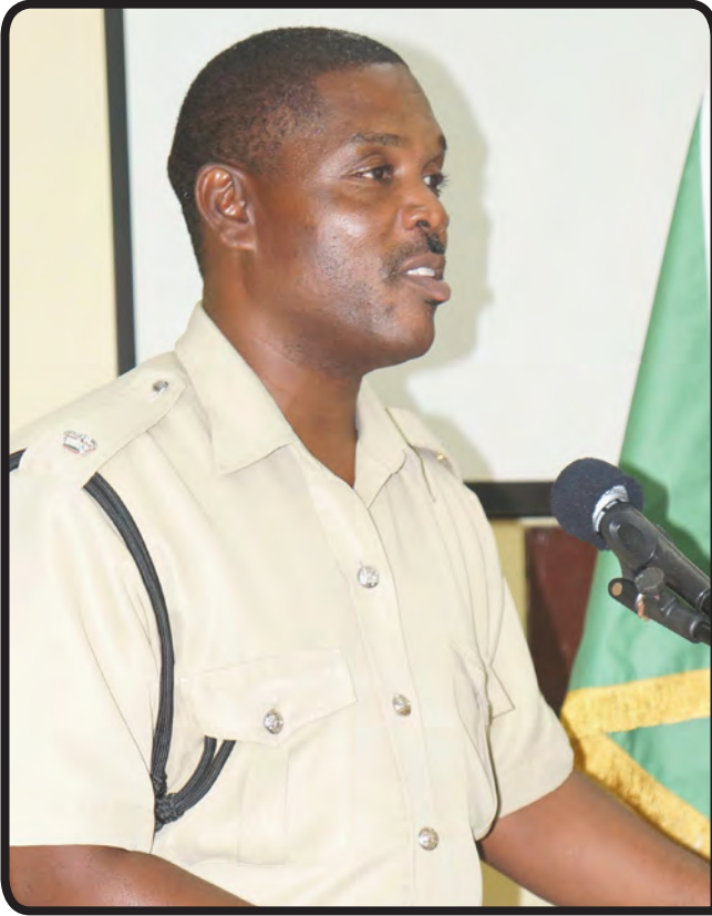
Superintendent of Police Lynden Flowers Commandant of the National Training Academy

officers of the Belize Police Department who attended a one-week training course for Adjudicators and Presenters, mainly officers involved in tribunals within the Belize Police Department.