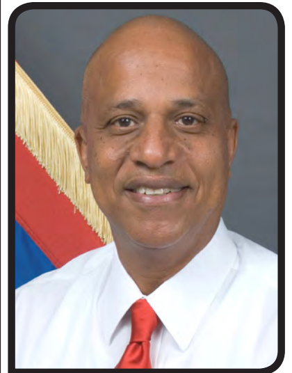
Hon. Dean Barrow Prime Minister of Belize

Belmopan. May 17, 2013. The Office of the Prime Minister informs that the Hon. Dean Barrow, Prime Minister of Belize, will be out of the country from Saturday, May 18th to Thursday, May 23rd.