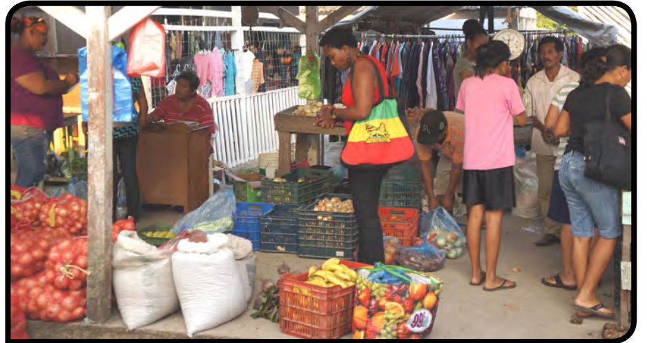
Market-shopper seeking best deal on fruits and vegetables

that, utilizing the almost unlimited space that the show-ground offers, they were accommodating over 150 vendors, which includes around 50 vegetable