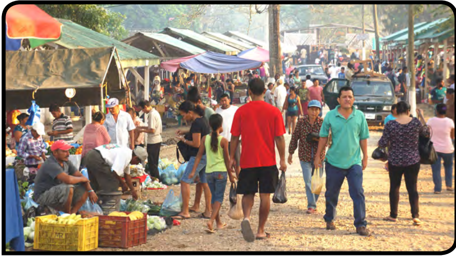
Shoppers flood the temporary market grounds

Block by block, the face of Belmopan is being transformed, thanks to the vision and determination of the Belmopan City Council, in concert with the Central Government, aided by grants from friendly governments and concessionary funding from multi-lateral international agencies.