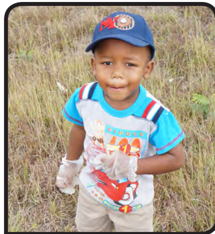
Youngest member of the Belmopan Cleanup Crew

limits on the Western Highway and Hummingbird Highways, leading all the way to