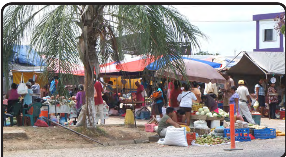
The Old Extended Market Grounds to be Rehabilitated