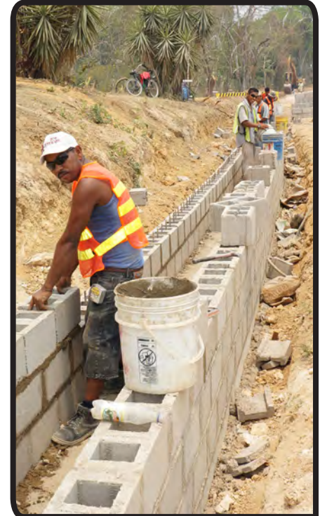
Employment for Skilled Workers

Additional design and investigation works have been conducted during the period to address issues raised as part of the high level review of the project design drawings. This has included a review of the design pavement, operational safety and capacity of intersec-