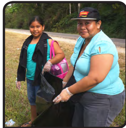
Daughter and Mother

It was the annual cleanup campaign, organized