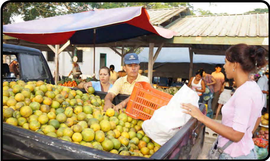
Vitamin D in abundance - a pickup-truck full of Citrus

Block by block, the face of Belmopan is being transformed, thanks to the vision and determination of the Belmopan City Council, in concert with the Central Government, aided by grants from friendly governments and concessionary funding from multi-lateral international agencies.