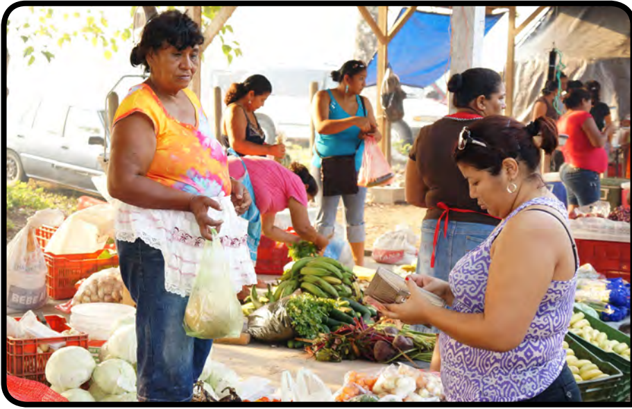
Money and agricultural produce exchanging hands

and on the opposite side of the Highway, which has for some time now been an added facility to show grounds. And, for the safety of all, there are traffic of-