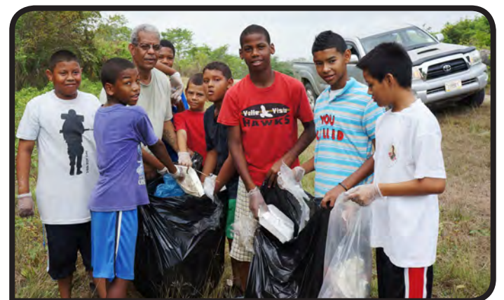
Young members led by exemplary senior

Sponsors included: the Embassy of Venezuela; Atlantic Bank Ltd; Embassy of Mexico; Papi's Home center; Builder's Hardware; Gallardo's Services; Western Regional Hospital; Bowen and Bowen Ltd.; Zeta Ice; Belize Audubon Society and Galen University.