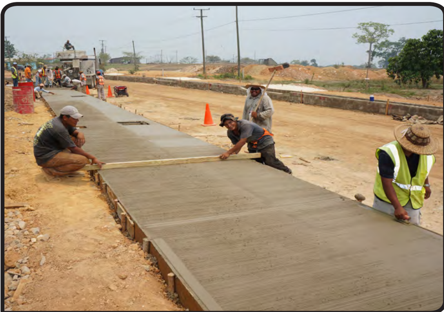
Employment for Skilled Workers

Continued from Page 20 demands of a rapidly growing municipality in the second most