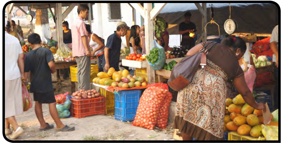
Another shopper getting her fresh fruits and vegetables