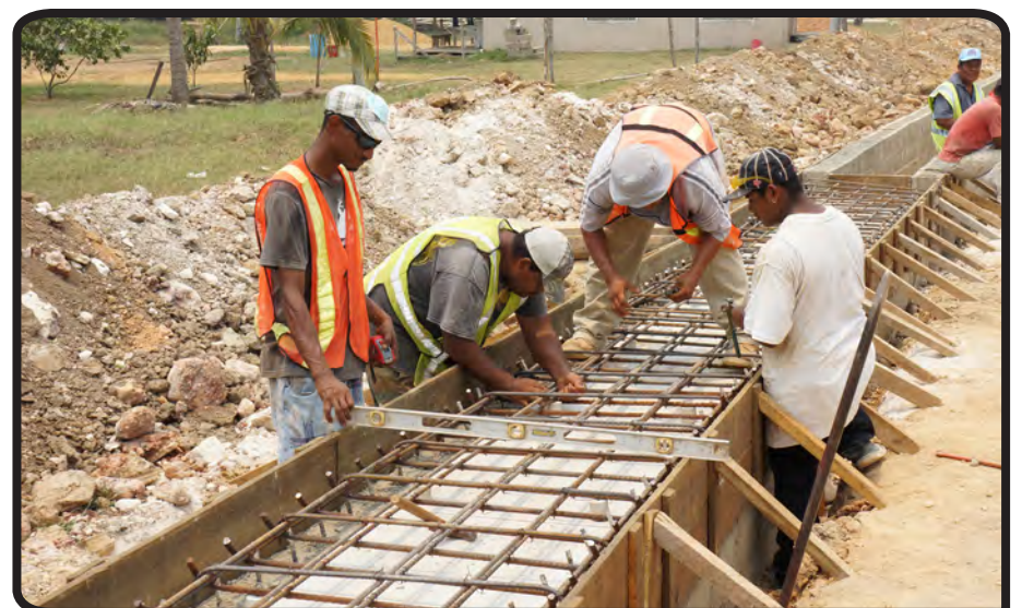
Preparing steel frame for a sidewalk-drain

throughout the length and breadth of the Nation of Belize.