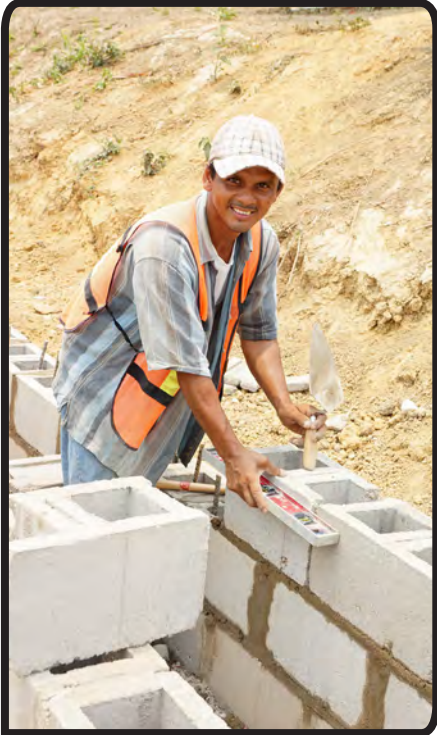
Another Skilled Worker

populous district in the country. The existing main crossing over the Macal River between Santa Elena and San Ignacio in the Cayo District, the Hawkesworth Suspension Bridge, was built in 1949. The Hawkesworth Bridge is a one-lane crossing, and a partial bridge inspection in 1996 revealed that the deck was in a poor state of repair. Furthermore, the bridge was carrying traffic loads exceeding the design loads, and the narrowness of the bridge and the steepness of the approach roads contributed to the congestion of traffic around the bridge in the center