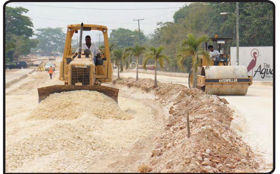
Bulldozer and Roller preparing re-shaping Loma Luz Boulevard

The Third portion of the Project, Lot 3, is the Branch Mouth Road Contract, which takes over and continues (on the San Ignacio side) from the new Bridge and connects with Joseph Andrews Drive, on which Sacred Heart College is located.