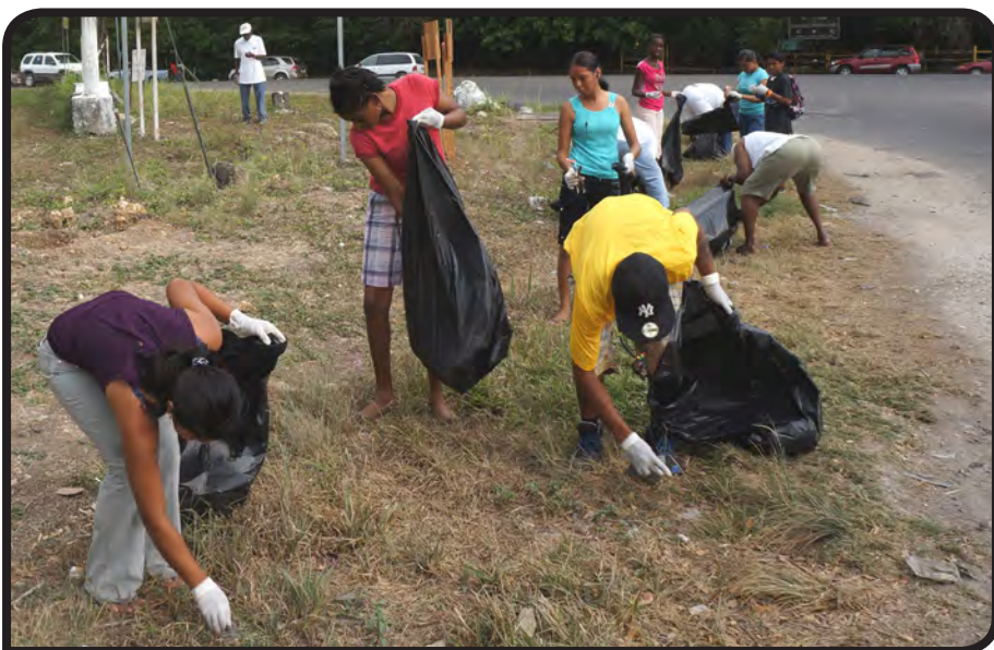
Massive Crew attacking garbage-ridden highway-shoulder

Klic Pre-School; Police Cadets; Belmopan Scouts; De-