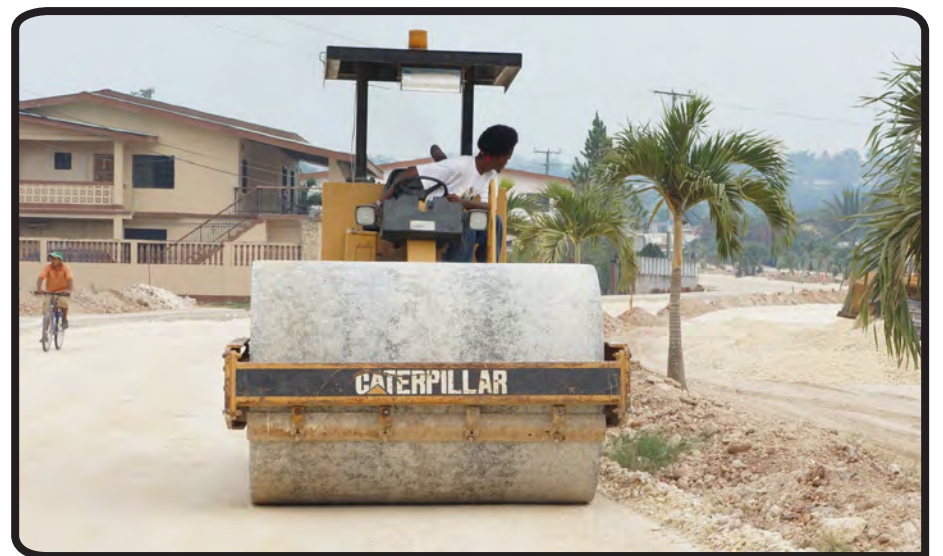
Heavy Duty Machinery Reshaping the new La Loma Luz Boulevard

tions, pedestrian and vehicular access, including access to adjacent properties and the extent of required land acquisition.