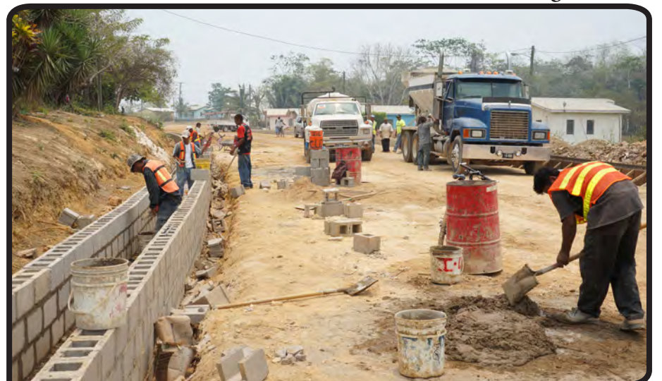
More work on sidewalk-drains for La Loma Luz Boulevard

The New Macal Bridge Project, also known as the San Ignacio - Santa Elena Bypass Project, comprises the improvement of approximately 3.2 Kilometers of existing highways in the twin towns of San Ignacio and Santa Elena, construction of approximately 1 km of new highway on embankment