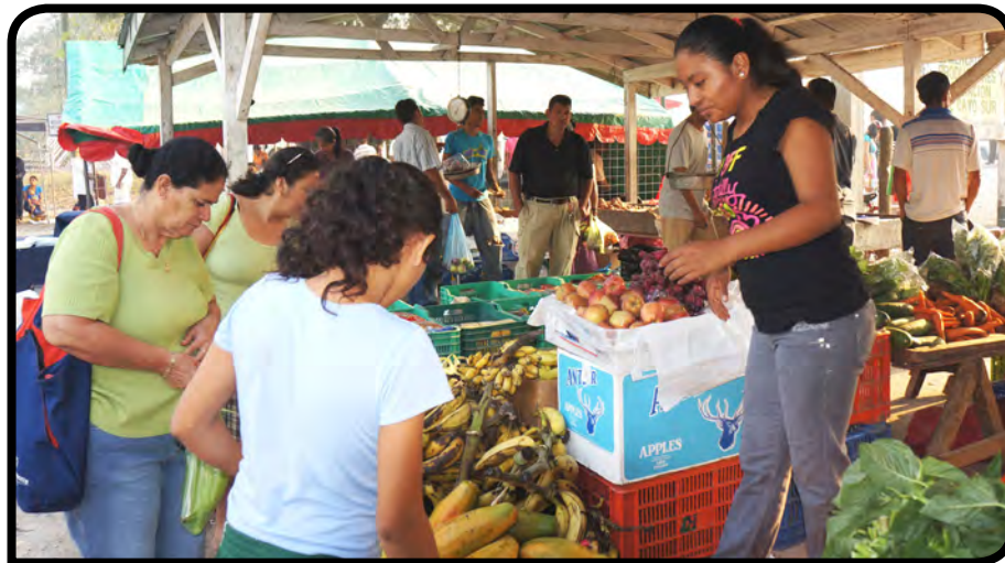
Young female vendor skilfully marketing her produce