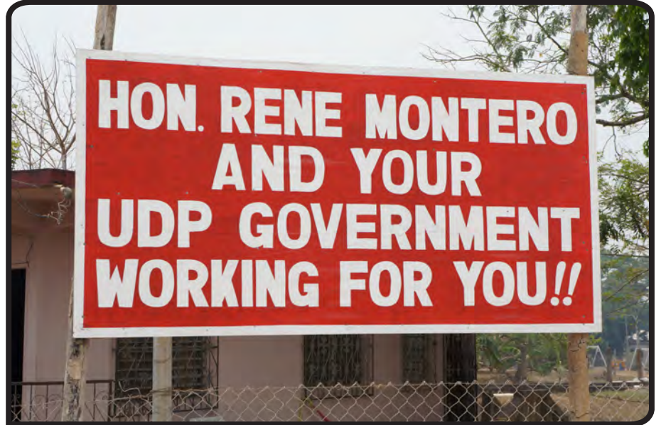
Sign at the Entrance to La Loma Luz Boulevard explicitly proclaiming the hard-work and commitment of the Government and Minister of Works/Cayo Central Area Representative Hon. Rene Montero

populous district in the country. The existing main crossing over the Macal River between Santa Elena and San Ignacio in the Cayo District, the Hawkesworth Suspension Bridge, was built in 1949. The Hawkesworth Bridge is a one-lane crossing, and a partial bridge inspection in 1996 revealed that the deck was in a poor state of repair. Furthermore, the bridge was carrying traffic loads exceeding the design loads, and the narrowness of the bridge and the steepness of the approach roads contributed to the congestion of traffic around the bridge in the center