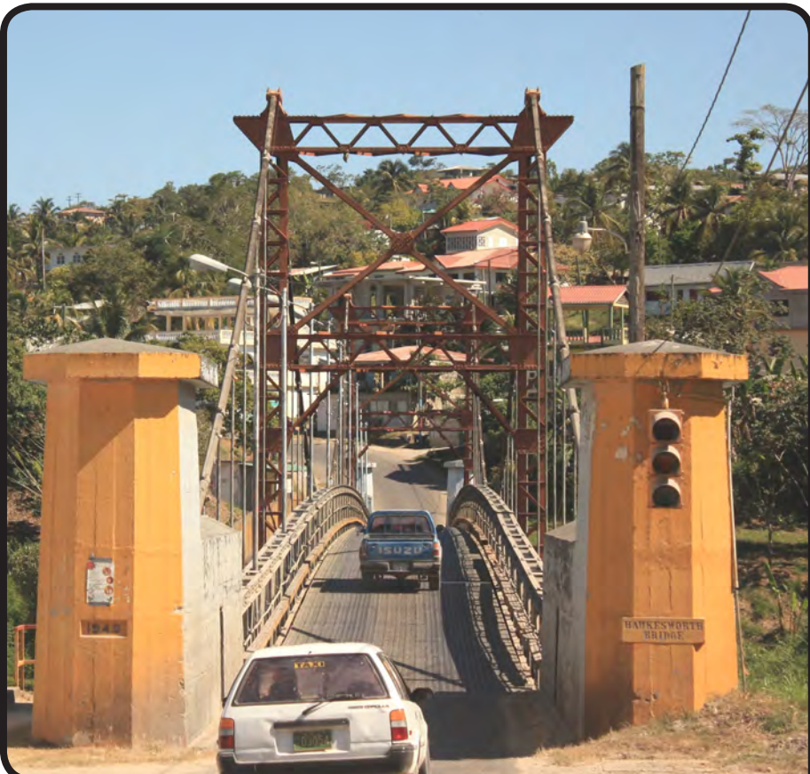
The Old Hawkesworth Bridge between San Ignacio and Santa Elena

pared documents on behalf of the Ministry of Works, including a Traffic and Economic Assessment (Halcrow, May 2010), an Options Appraisal Report (Halcrow, June 2010), and an Environmental Impact Assessment (Halcrow, July 2010). Detailed design of the selected option was conducted by Halcrow, and the construction phase of the project works is currently in progress.