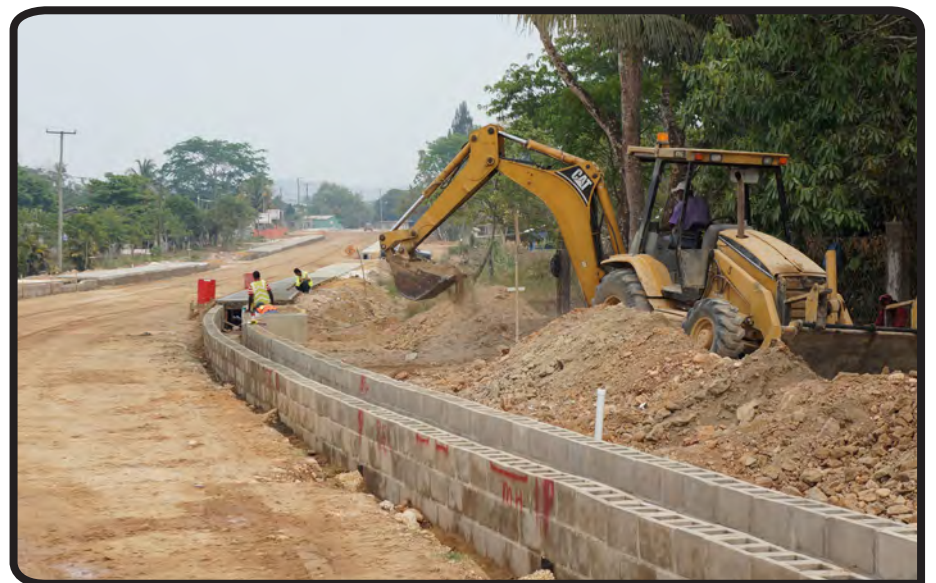
Heavy Duty Machinery working on La Loma Luz Boulevard

People and Country, how many roads could have been rehabilitated and upgraded; how many new bridges built and old ones replaced; how many schools established and expanded; how many water systems constructed and rebuilt; how many villages and communities electrified;