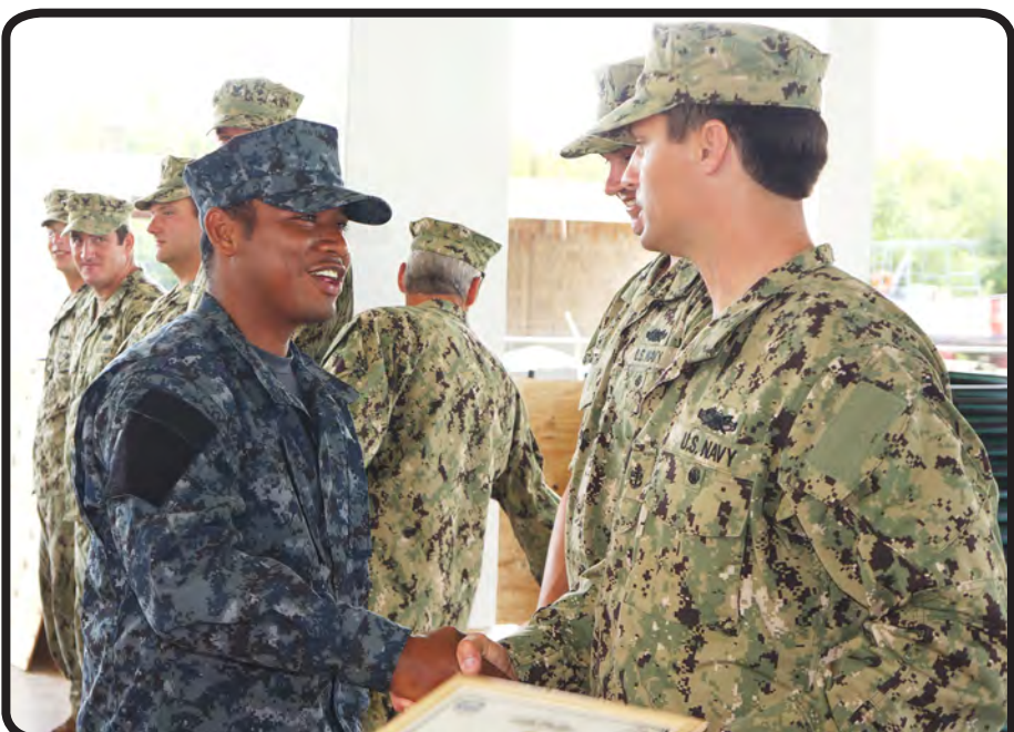
A member of the Belizean team receives his certificate

(ADU) of the Belize National Police Force, who all completed a five-week intensive Special