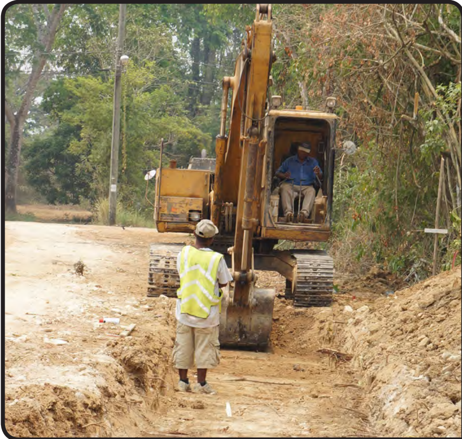
Excavating new drains near site of new Macal Bridge to be built

Continued from Page 19 the floodplain to the west of the Macal River, providing an all-purpose road with a 7.3 meter wide carriageway, plus one meter wide hard shoulders on each side.