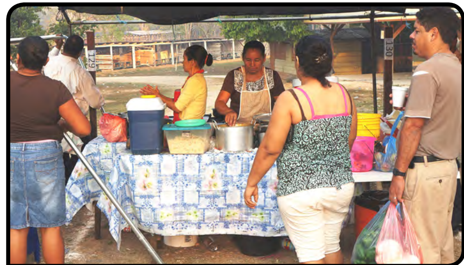
Hot Tacos and other Corn-Cuisine for Breakfast

at a total cost of around 2 Million Dollars, is being funded by the European Union (EU) under its Belize Rural Develop-