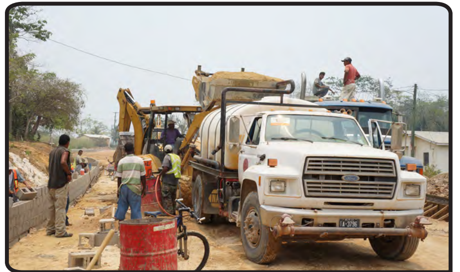
Loader, Water Truck and Dump Truck on La Loma Luz Boulevard

The Fourth and final portion of the project, Lot 4, is for the Rehabilitation and Upgrading of Joseph Andrews Drive, which re-connects with the San Ignacio - Benque Viejo Road, thereby completing the new loop.