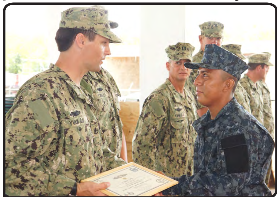
Another Belizean trainee receives his certificate

tion, Weapon-Handling Skills, and Waterborne Techniques. The keynote address at