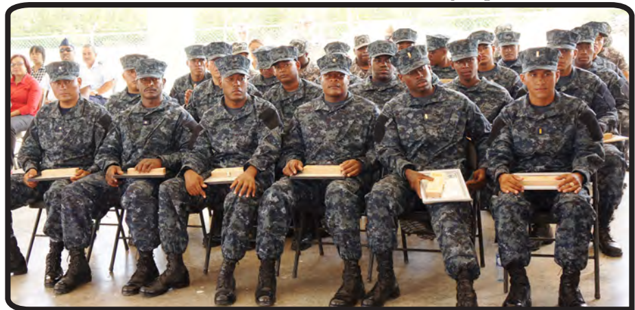
The Graduating Belizean Team Trained by the US Navy

Handling, Communications, Board Search and Seizure, Vectoring, Radar and GPS Opera-