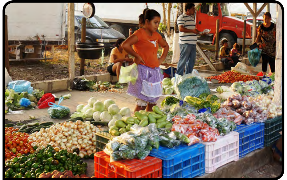
A vendor displaying her fresh, colorful and inviting produce

ceptable situation, particularly since it involves agricultural produce and food stuff for human consumption.