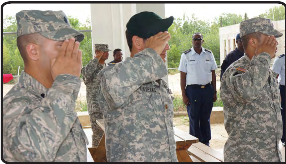
Other Members of the Team as the National Anthems are played

Completed is a significant milestone in the development of the Belize Coastguard Seal Team. This is the third evolution of training conducted by a special boat team