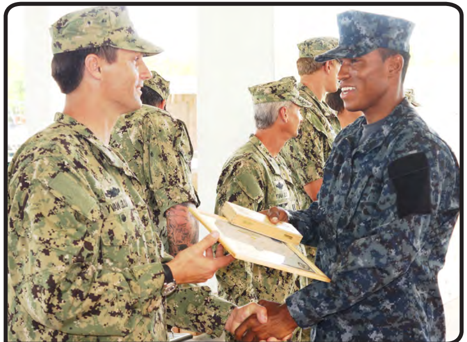
More smiles as a proud participant receives his certificate

The Graduation Ceremonies took place this morning