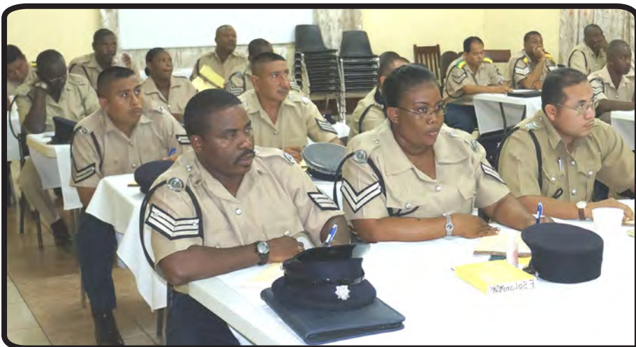
Participants in the Adjudicators and Presenters Course