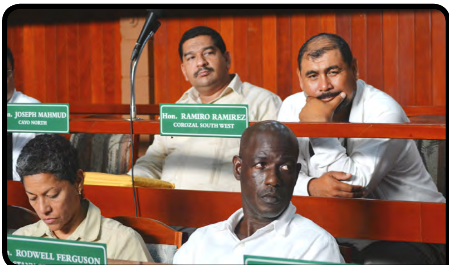
Opposition members listen to members of Government side speaking

This, Mr. Speaker, is the time of One Government, One People, One Belize (applause)!