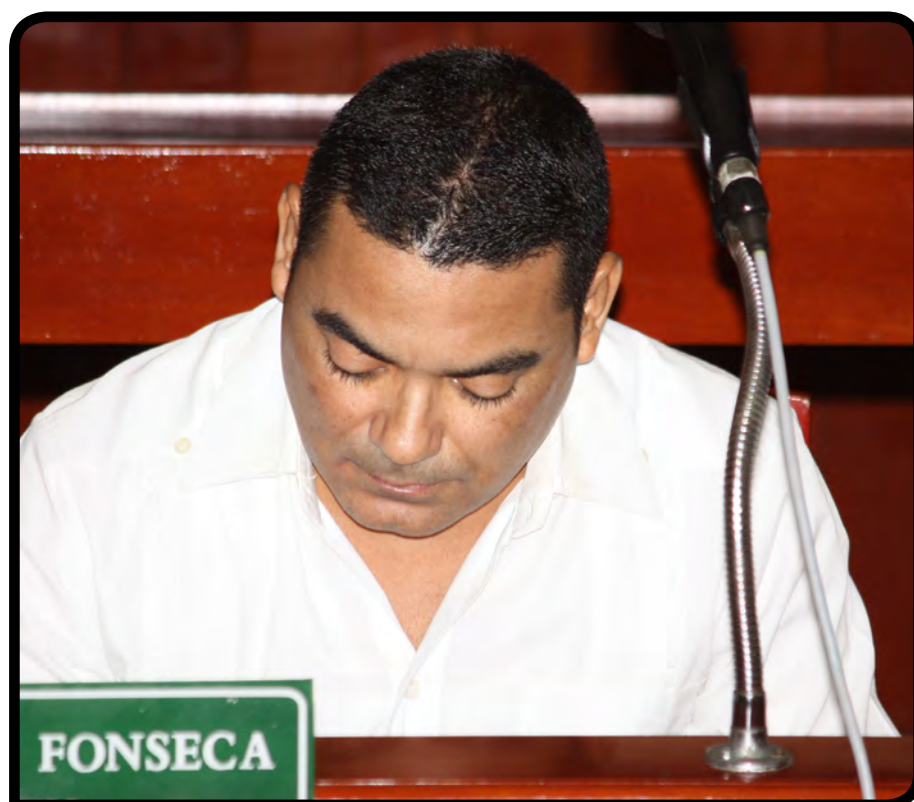
Hon. Francis Fonseca, Leader of the Opposition

And then, he starts talking about public debt; he spoke about the Public Debt. For the life of me, I can't understand these people over the