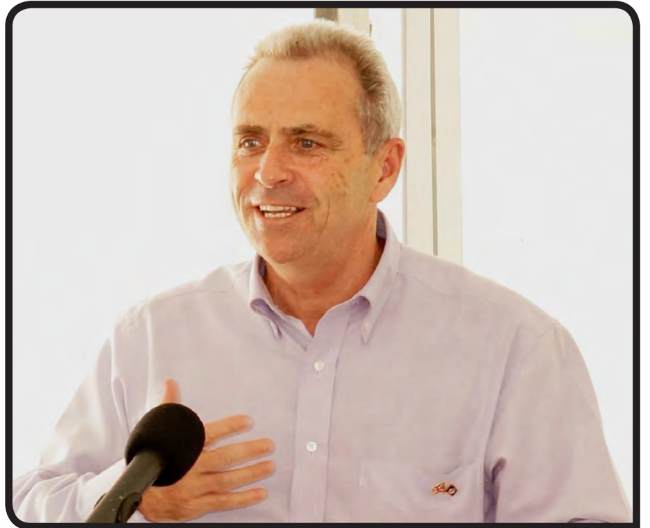
H.E. Pat Ashworth, British High Commissioner