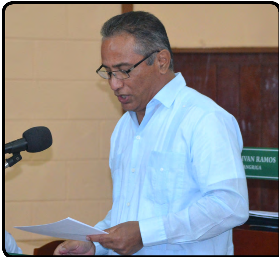
Hon. Johnny Briceno, Member for Orange Walk Central

Then, he talked about expenses at our Mission in New York. But these have gone up because there is finally a permanent representative in place, and because we also now have to pay our own rent for the Be-