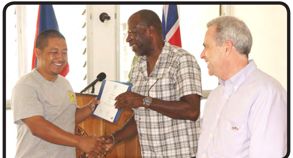
Participant receives certificate for successfully completing the Course