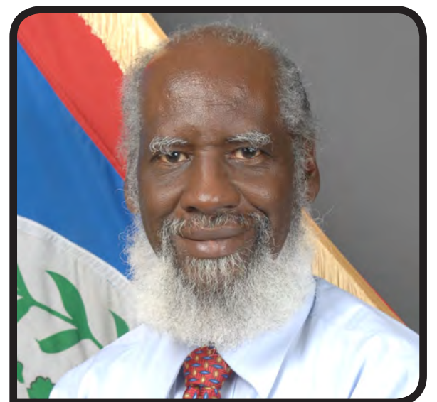
Hon. Wilfred "Sedi" Elrington Belize's Foreign Minister

O n March 26, 2013, the Government of Belize, through its Ministry of Foreign Affairs, issued the following self-explanatory Press Release: