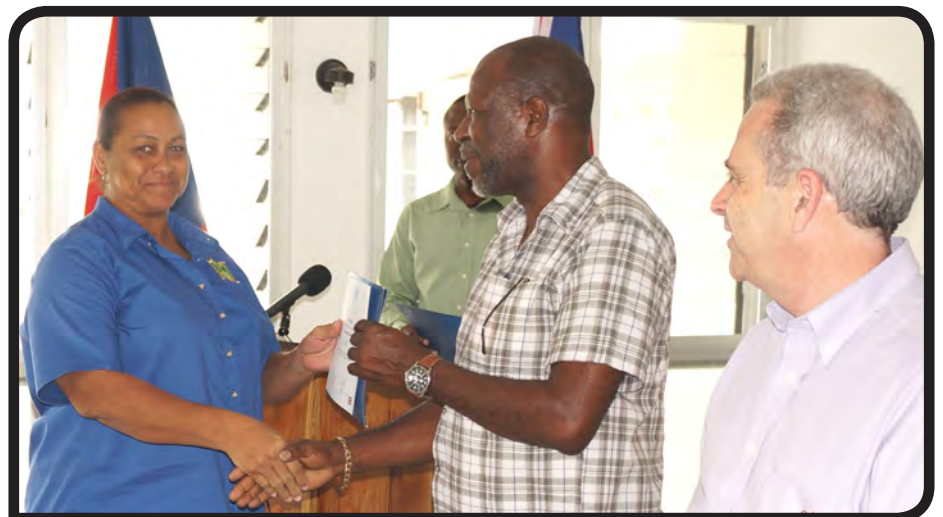
Participant receives certificate for successfully completing the Course