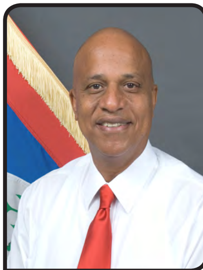
Hon. Dean Barrow Prime Minister of Belize

The Office of the Prime Minister informs