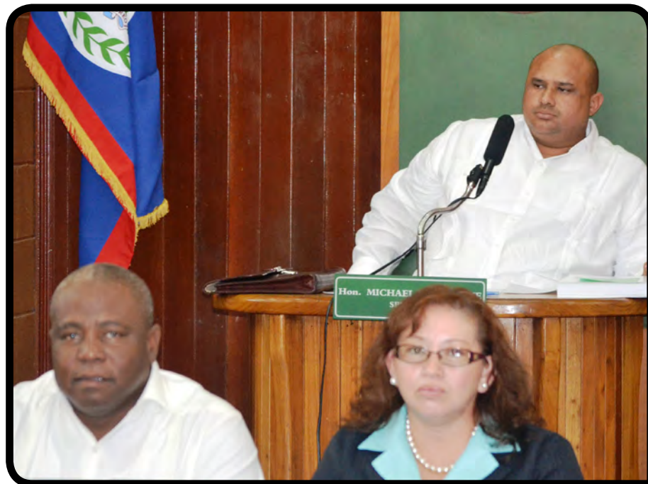
House Speaker, Hon. Michael Peyrefitte and National Assembly Staff

In the next few weeks, look out for the start of the an-