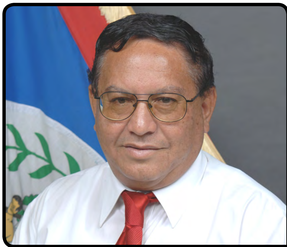
Hon. Rene Montero, Minister of Works and Transport Member for Cayo Central Division

The Southside Poverty Alleviation Project continues on schedule, with the first phase being completed in December of 2012, at a cost of approximately