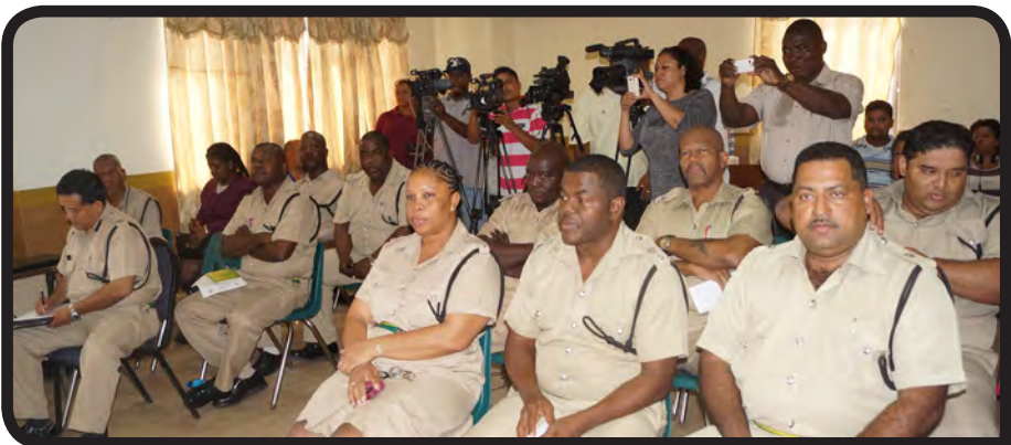
Senior Officers who command the various zones and branches countrywide

“To signal my commitment to the citizens, we also - this administration is serious about the issues of complaints against police