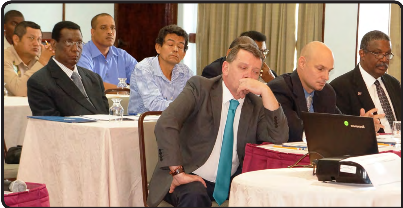
Participants and Invited Guests including Chief Justice and other members of the Judiciary

Chief Justice and other senior members of the Judiciary.