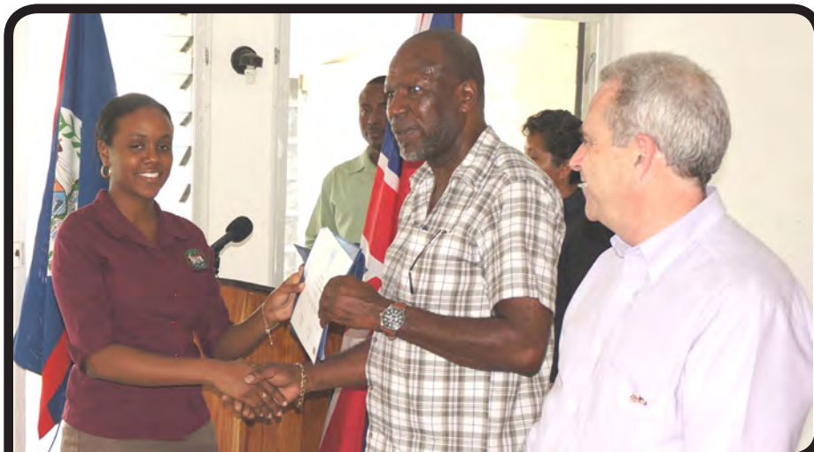
Participant receives certificate for successfully completing the Course