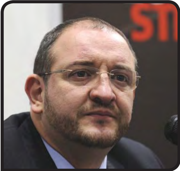
Luis Fernando Carrera Guatemalan Foreign Minister

Belize Government Rejects Guatemala's Proposals