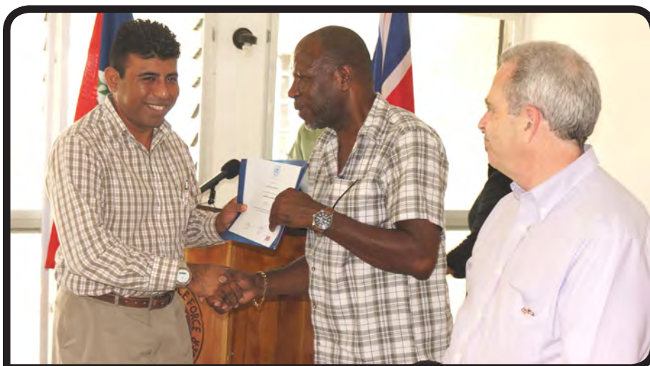
Participant receives certificate for successfully completing the Course

Room at the Belize Defense Force Compound at Price Barracks, Ladyville.