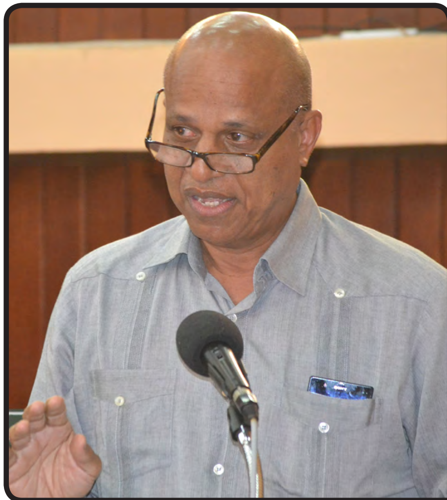
Prime Minister Hon. Dean Barrow in the National Assembly

I'm starting now with the Leader of the Opposition. Where he was concerned, Mr. Speaker, I recollect that after my own budget presentation, he was interviewed by Channel 7, and his comments were so perfunctory that it was reported to be shortest reaction to a budget speech from a leader of the Opposition ever. I, and I am sure other members of the public, saw the way the station framed it as being kind, because, in other words, in respect to the Leader of the Opposition, he was not