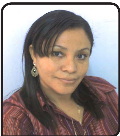
By Zelda Hill