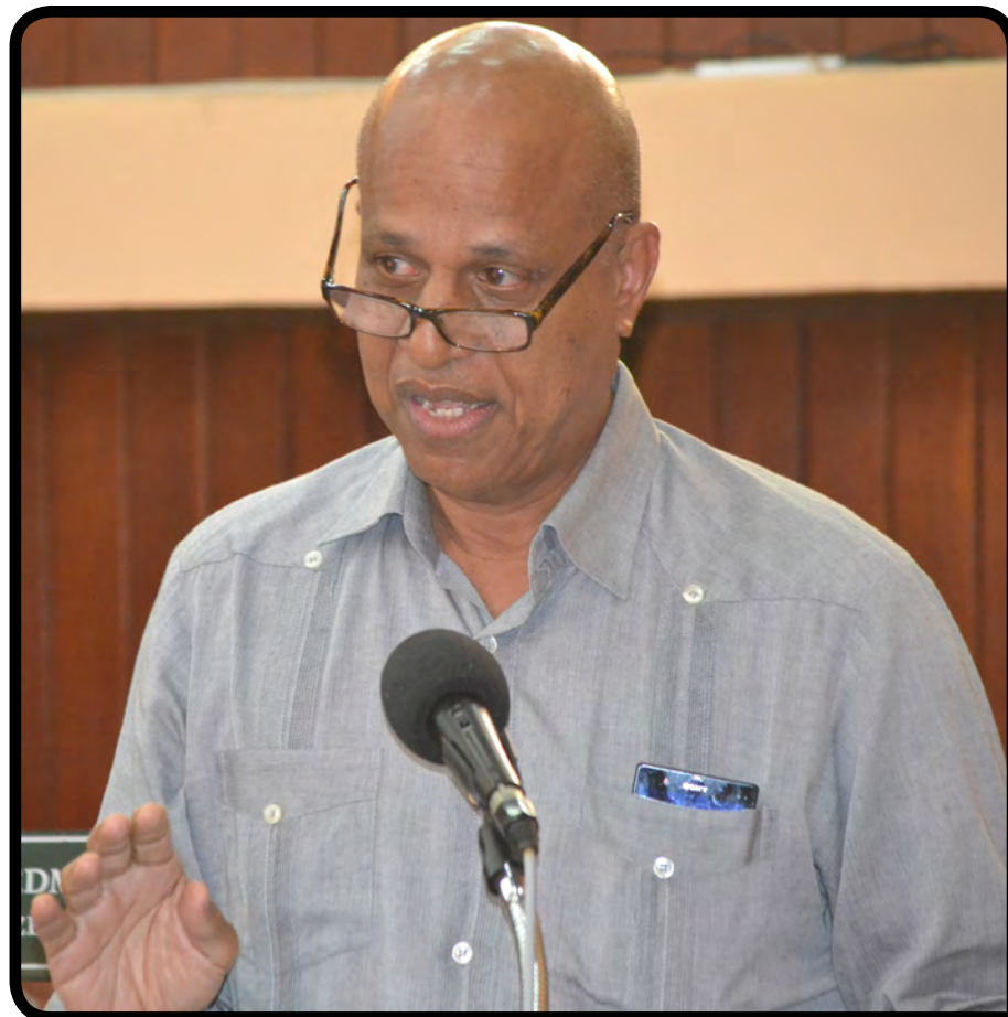
P.M. Hon. Dean Barrow, wrapping up the Budget Debate

So, Mr. Speaker, let me conclude by saying that what at times degenerated into a