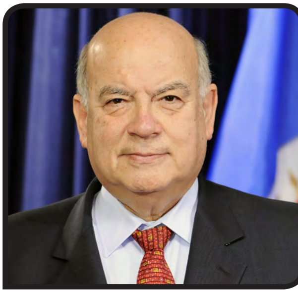
Jose Miguel Insulza OAS Secretary General,