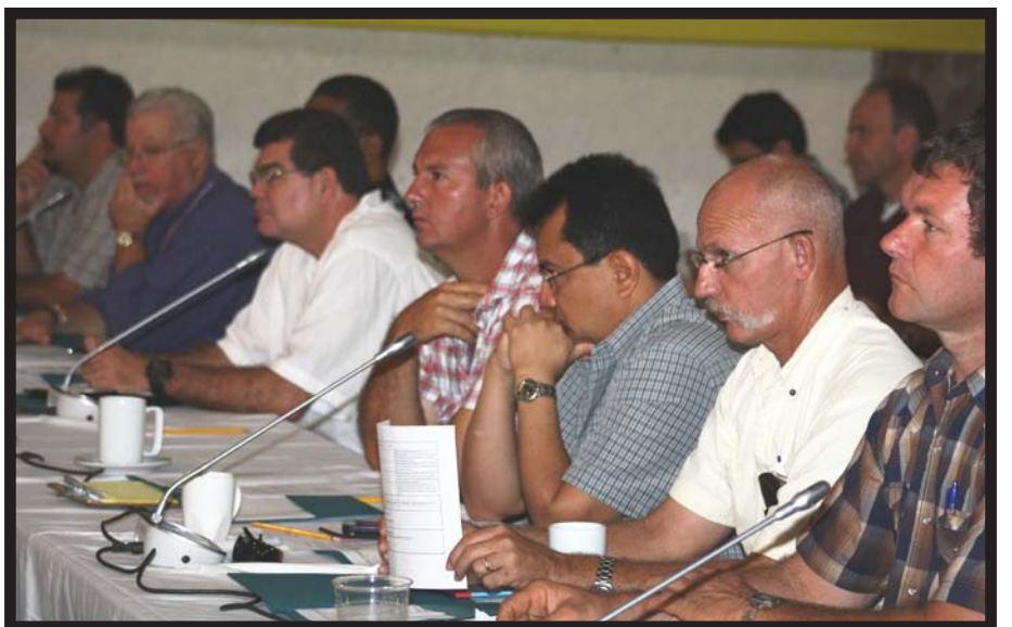
'Turning the Corner' Business Forum at Old Belize Resort Attended by P.M. Barrow and top Government Officials

The PM's final announcement was of particular interest to the private sector/business community. He prefaced the announcement by reiterating the fact that there is a need for an equal partnership between government and the private sector, by recounting that in this regard the right start was made late in 2011, and