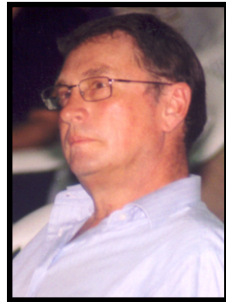
Lord Michael Ashcroft

The announcement by Prime Minister Dean Barrow in his 2012 New Year's address that the government is about to purchase and write off $17 Million worth of SSB House Mortgages is certainly welcoming news, especially to the 870 or so families that will benefit directly from the generous relief package.