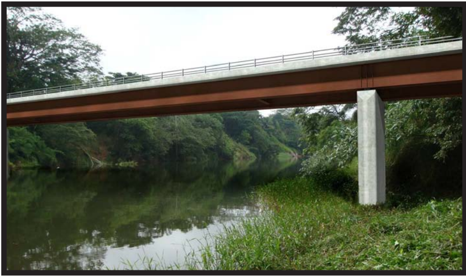
Virtual Reality - What the New Macal River Crossing in San Ignacio will look like when it is completed

The contract for the design and build component of the Solid Waste Management Project has also been signed; and it will see 14 million dollars spent between January and July in Caye Caulker, San Pedro, San Ignacio and Belize City."