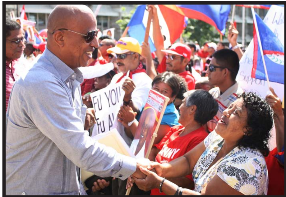
PM Barrow thanked by Belizean citizens for enshrining in the Constitution public ownership of essential utilities

ship, food subsidy and BOOST programs, and that the drop-in centers in distressed Belize City neighbourhoods will help with community development, social recovery and violence prevention."