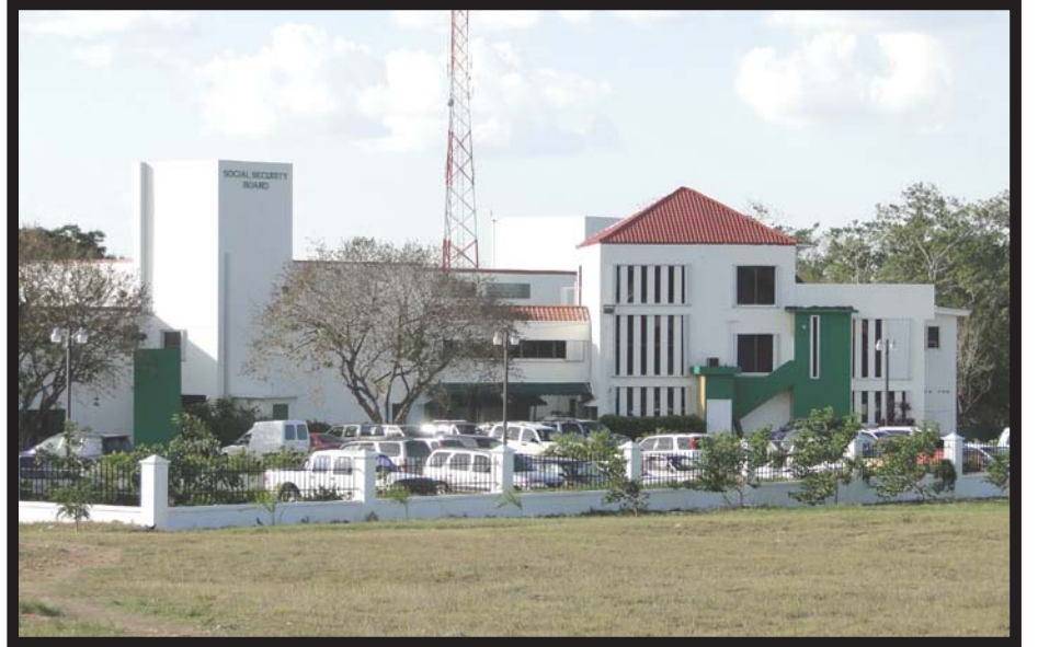
Social Security Board Corporate Headquarters in Belmopan

building lots to first time land-owners," the PM reported.