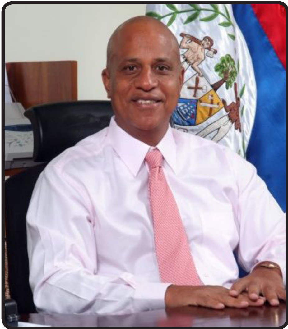
Hon. Dean Barrow, Prime Minister of Belize

recorded in 2010. It was the highest growth rate since the economic recession hit home, and signals that we have in fact weathered the storm relatively well, something even the IMF has conceded.