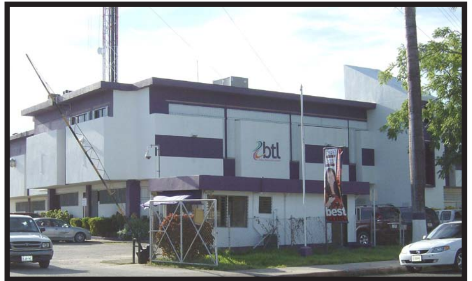
Belize Telemedia Corporate Headquarters

Meanwhile, on the Electricity side of things, the PM confirmed in his New Year's Address that rates are certainly and almost immediately going down, as BEL has already applied