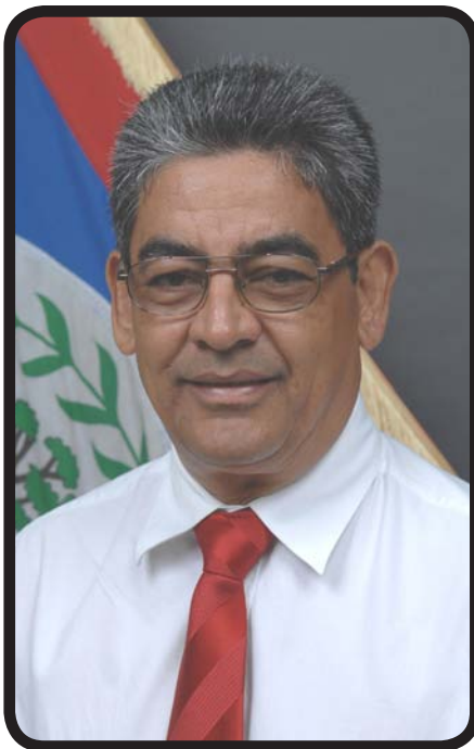
Hon. Gaspar Vega Vice Primer Ministro