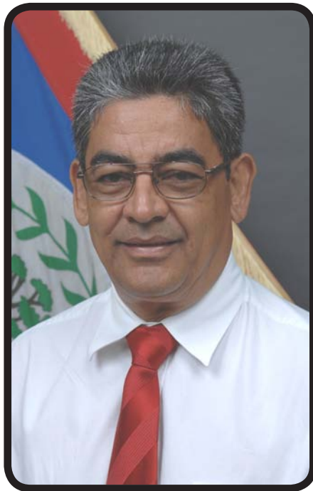
Hon. Gaspar Vega Deputy Prime Minister