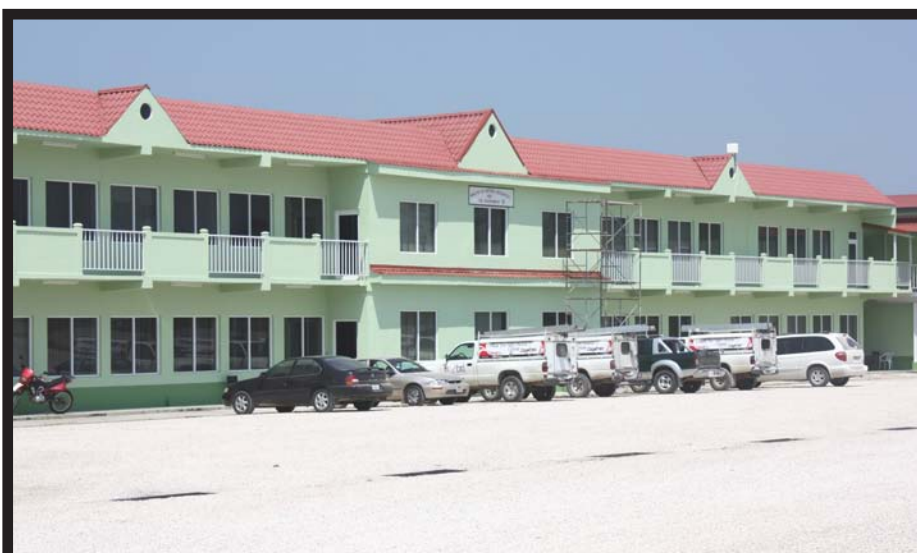
New Building Housing Lands and Survey Ministry and Department

"Every single registered surveyor in this country has now been contracted to work on the subdivision of the 4,709 acres identified by the Ministry of Lands for the allocation of