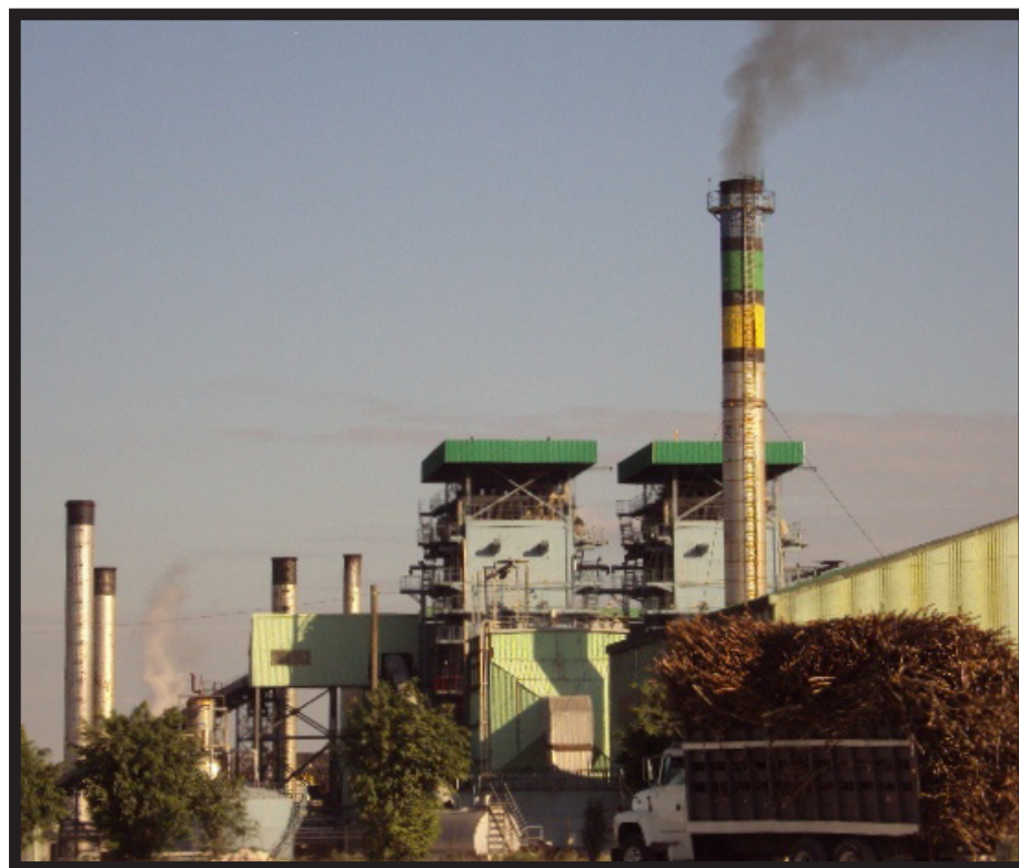
BSI Tower Hill Sugar Factory in Orange Walk

The main fact about Belize's Economic performance in 2012 is that