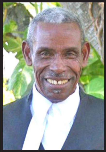
Hon. B.Q. Pitts Attorney General, also a recipient of the Queen's New Year's Honours