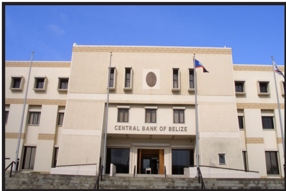
Central Bank of Belize