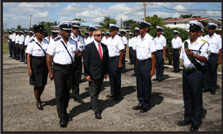
Police Passing Out Parade