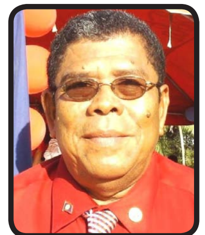
Simeon Lopez Belmopan Mayor