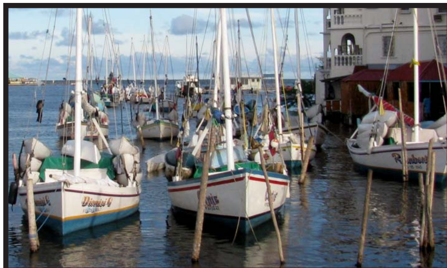
Fishing Boats in Belize City

particularly inspiring presentation, one most befitting the occasion, as New Year's is a time, like no other, for renewal and hope. Yet, the vision outlined by the Prime Minister was, as he put it, not newborn as the year itself, 2012.