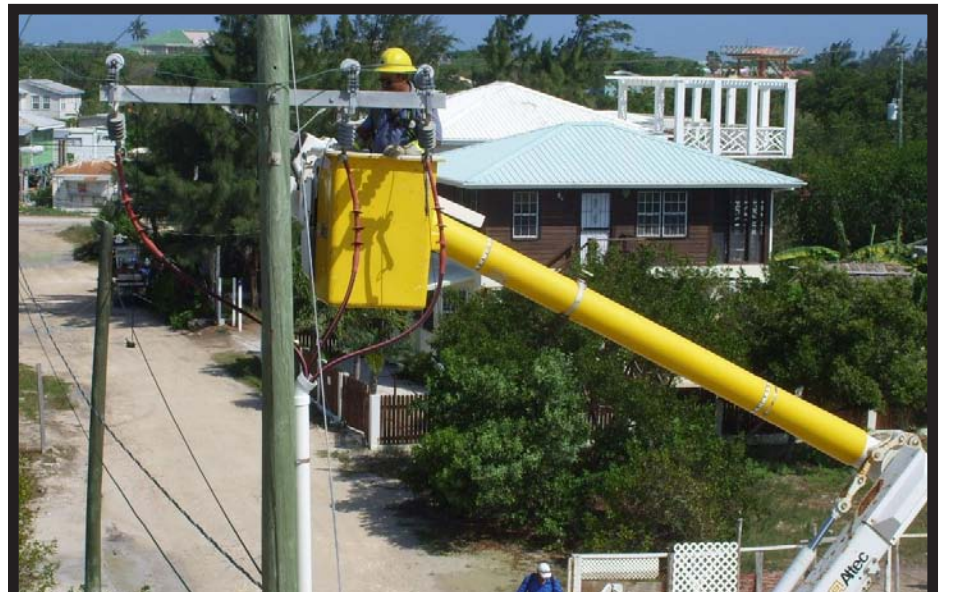
Belize Electricity Limited Technicians at Work