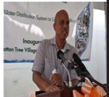
Hon. Dean Barrow, Prime Minister of Belize

The Cotton Tree Water Distribution System culminates the first phase of a project that aims to improve the quality of water supply to some 400 households in the three villages of Cotton Tree, St Mathews and Franks Eddy, located along the Western Highway near Belmopan. This project will connect all three communities through a main transmission line from BWS' Water Treatment Plant in Belmopan. This Plant, which already supplies Belmopan, Roaring Creek and Teakettle, has been upgraded to provide adequate supply to all areas.