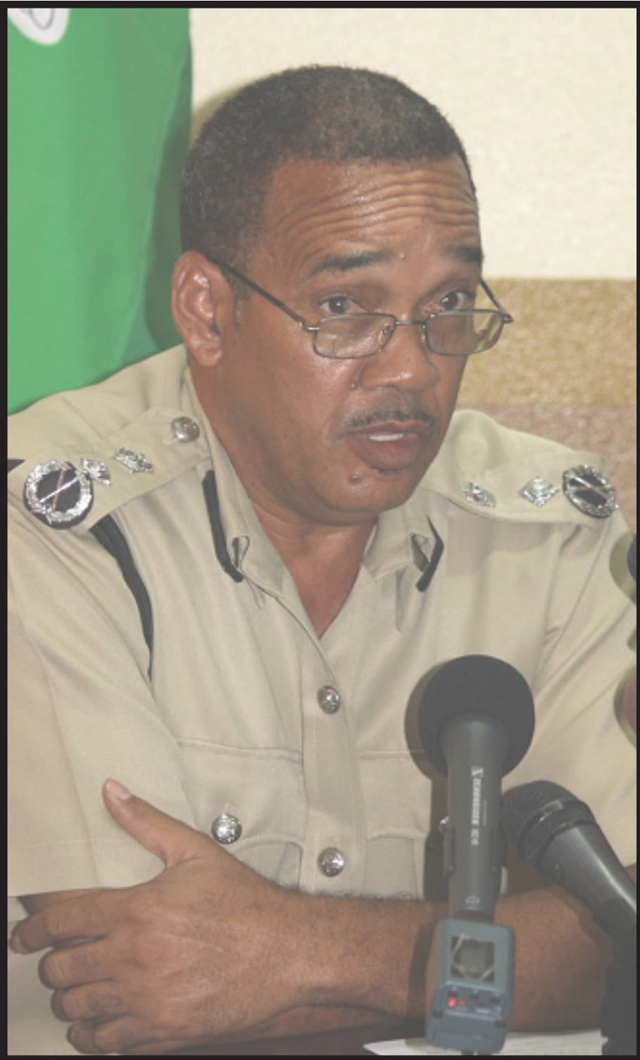
Police Commissioner Crispin Jeffreys