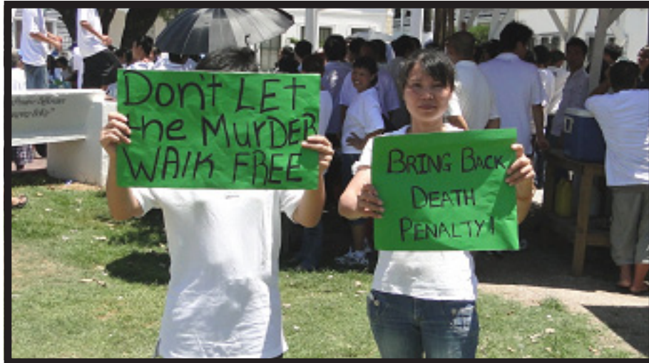
Monday's Protest by Chinese Belizeans in front of Supreme Court

The Ministry of Works and its Minister have employed over a thousand youths from the south-side of Belize City. This single