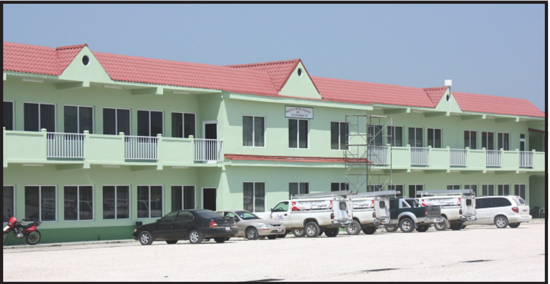
New Lands Department Building on Zenia Street, Cohune Walk

More Office Space, Better Parking, Better Service