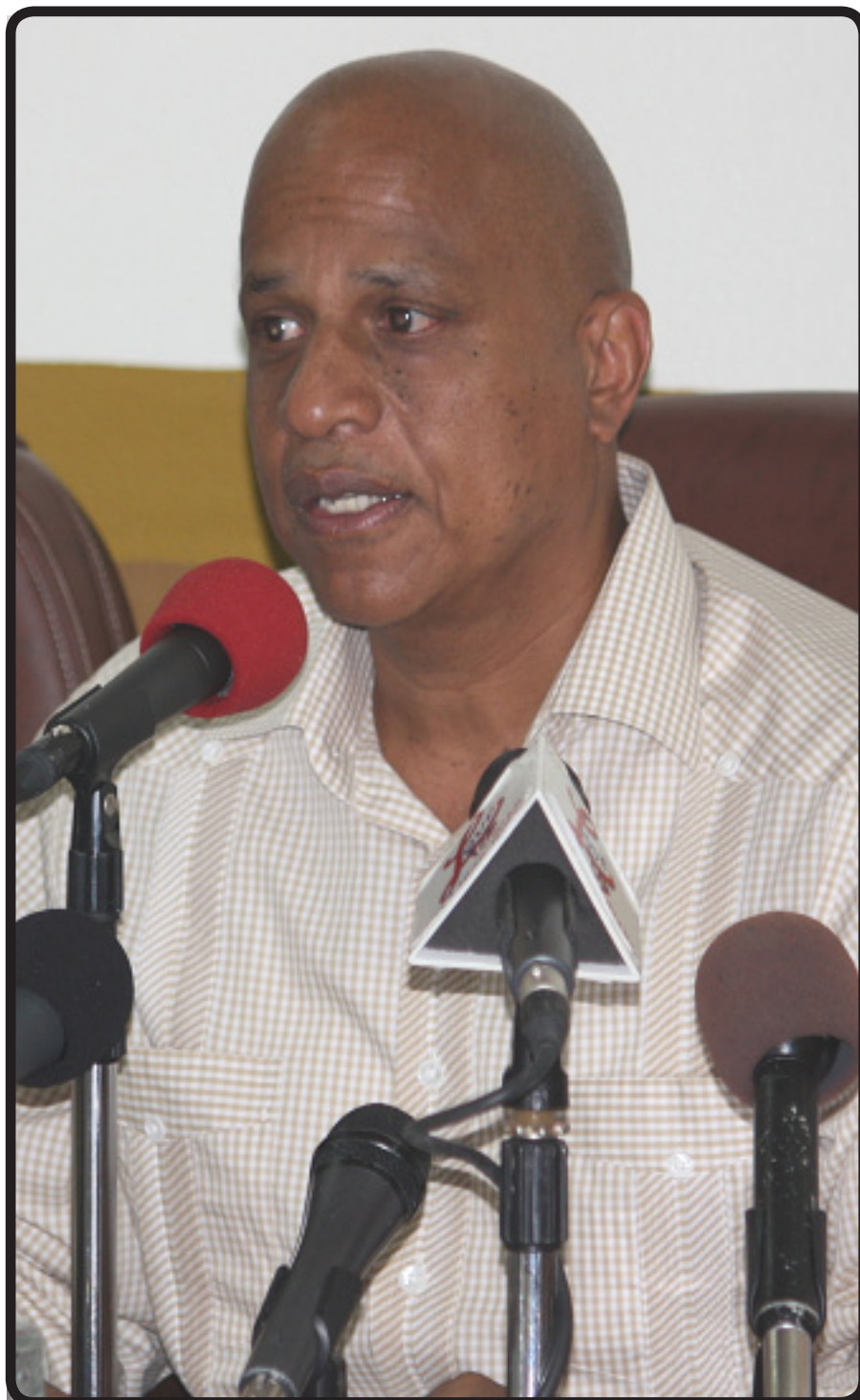
PM Dean Barrow outlines Plan of Action

Out of that session held yesterday, I received a memorandum of the strategy