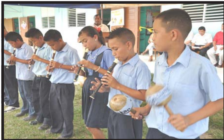
Students delivering their version of "Waka Waka" at the ceremony

The largest portion of the project included the replacement of the asbestos roof with a new pre-painted galvalum roofing, installation