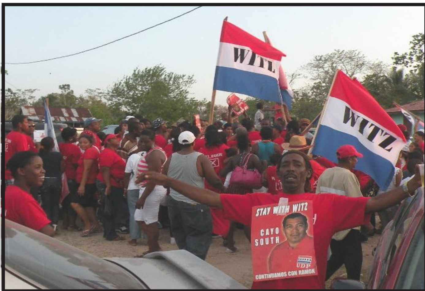
Ramon Witz supporters celebrating the victory