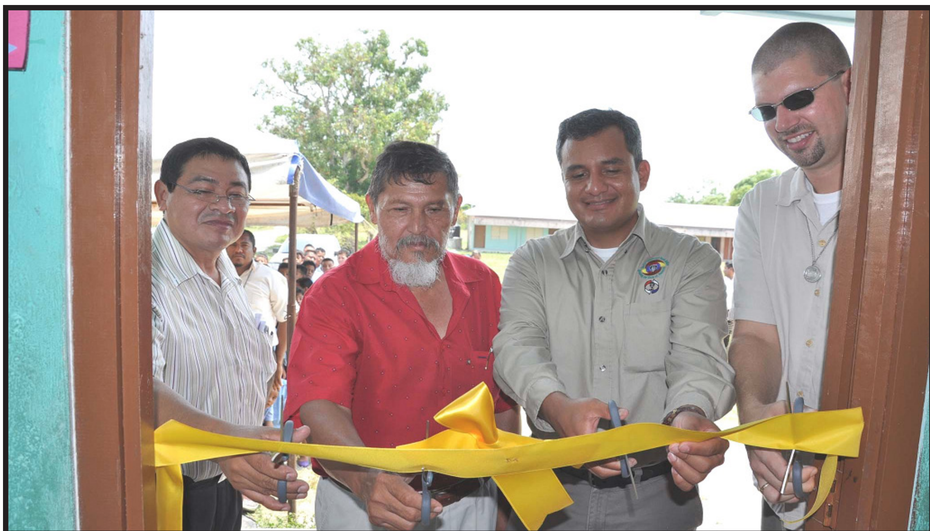
The Symbolic Ribbon Cutting