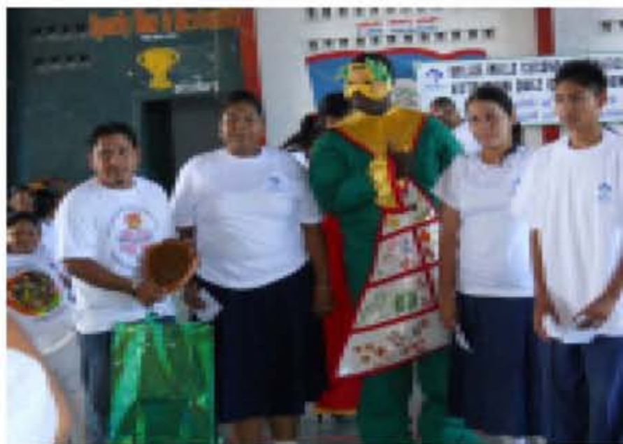
Third Place winners, Corozal Pinals, Sarteneja Cornerstone Presbyterian Academy

The Ministries of Education and Health in collaboration with the Pan American Health Organization (PAHO) and UNICEF has concluded the first phase of hosting the annual National ADM Secondary School Nutrition Quiz Competition. We congratulate all the winners as they proceed to the National Finals of the Secondary School Nutrition Quiz Competition scheduled for May 12 th 2011 in Belize City.