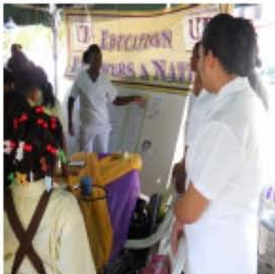
Ministry of Health Fair for TB Day held at ITV/ST, Belize City

Tuberculosis (TB) Day on March 24 th under the theme, On the move against TB: Innovate towards Action .