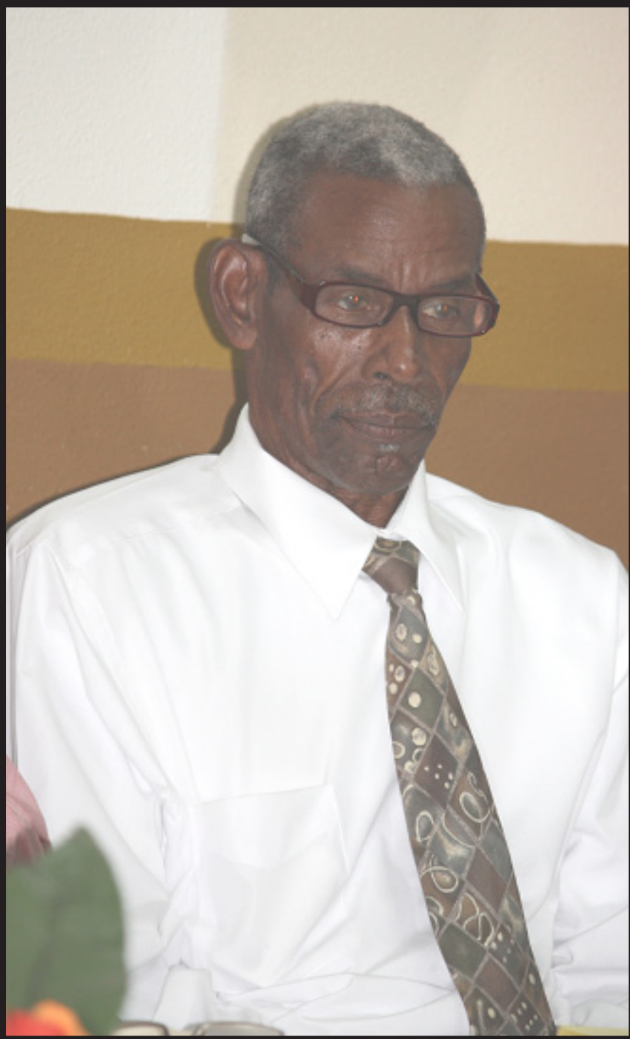
Attorney General Hon. Bernard Pitts