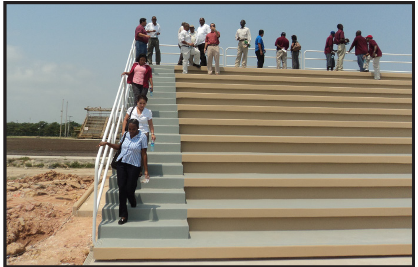
Field visit of expansion works underway at Marion Jones Stadium

Phase 1 was the construction of the perimeter fence, Phase 2 and 3 involve the upgrading of the football pitch, the outdoor beach volleyball court, the construction of the running track and surfacing of the cycle track. The running track will soon be completed since on