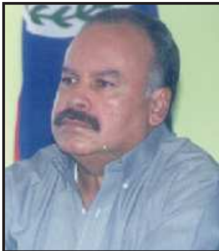
Ralph Fonseca, the man who ran the country's finances, first as Minister of Budget, then as Minister of Finance