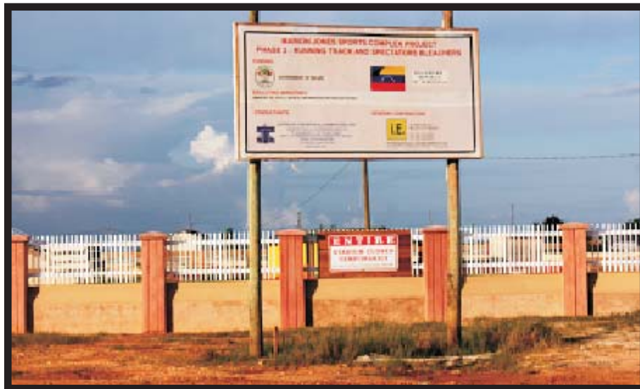
Phase Two of Marion Jones Sports Complex Project

In other sports news, the interdepartmental dominoes tournament continues in Belmopan every Tuesday and Thursday. The venue has been changed from the Belmopan Civic Center to the Police Training School Compound Canteen. Teams are competing fiercely for the grand two thousand dollars ($2000) prize. Leading the race at present is the combined Fire/Fisheries Departments' team closely followed by the Belize Defence Force.