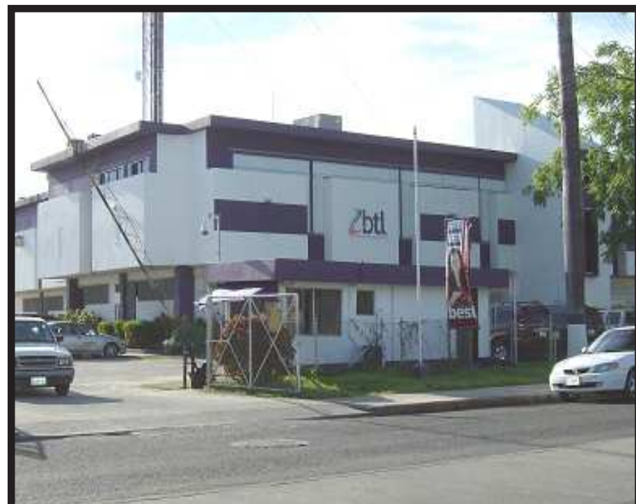
Belize Telemedia Corporate Headquarters in Belize City

It was the last administration led by Musa and Fonseca, remember, which immediately upon returning to office in 1998, began making good on its