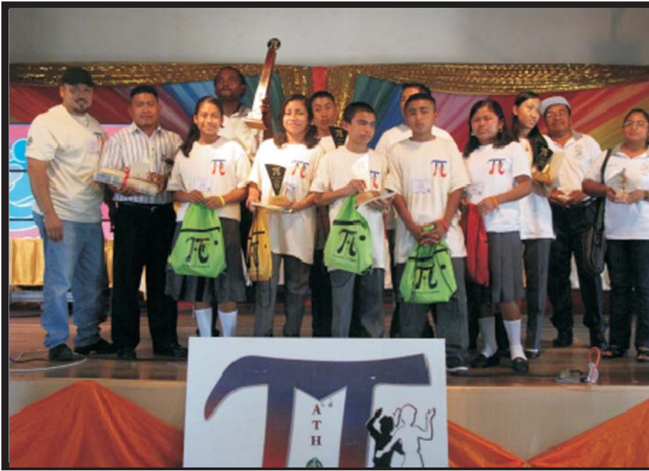
Southern Regional Champions from Julian Cho Technical High School of Toledo

The pitch is feverish—and that's no exaggeration—as the 2011 Math Olympiad, sponsored by the Social Security Board, has our young and bright Belizean minds blazing with figures and challenging computations.