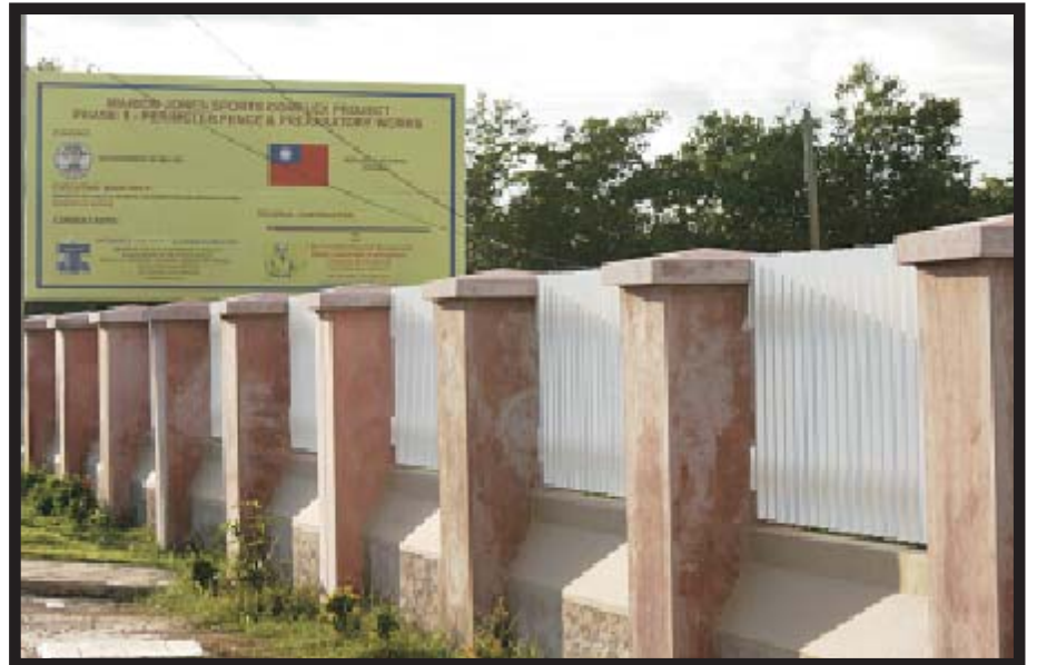
Phase One of Marion Jones Sports Complex Project

The facility is presently completely closed to the public since works are also being carried out on the outer track used by citizens to do daily exercise and the loose material