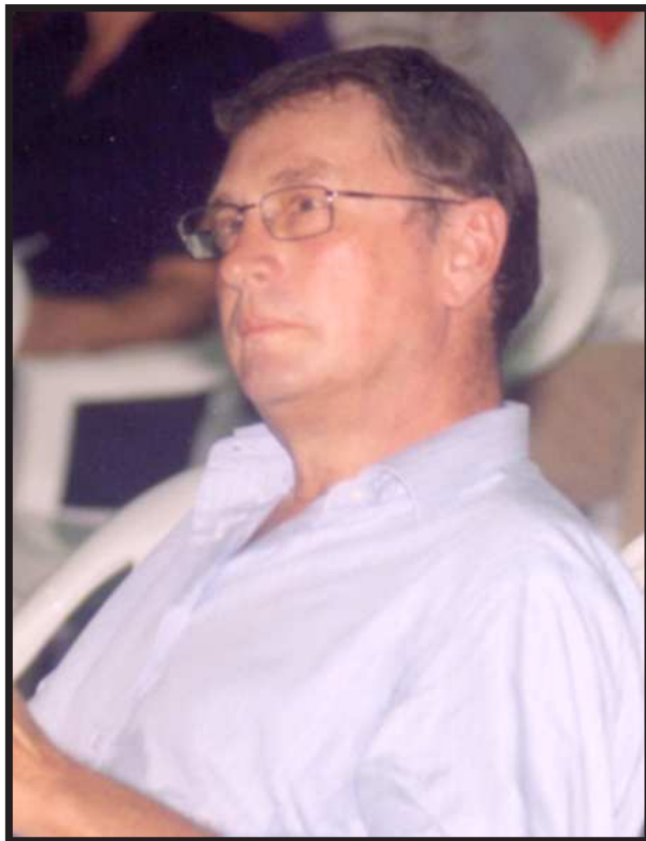
Lord Michael Ashcroft

Going back a little further still, those Articles of Association were put in place back in 1987 when BTL was created under the previous UDP Administration led by none other than Doctor Manuel Esquivel, and when the man