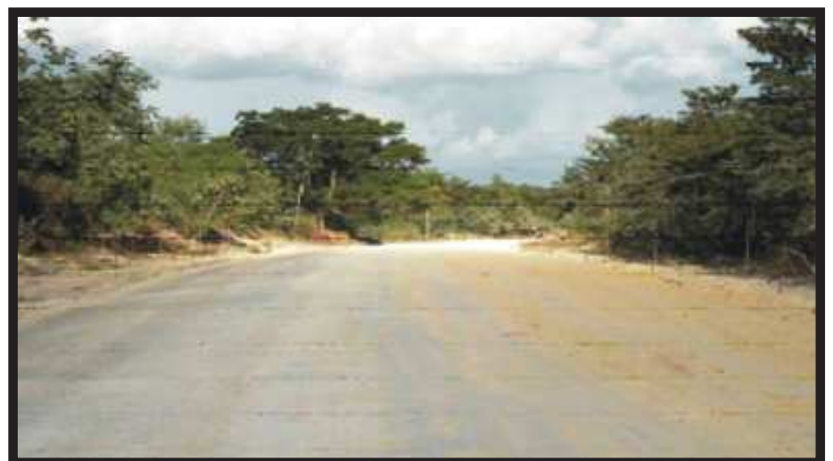
The entire project is for the paving of the road from Orange Walk Town all the way to Blue Creek