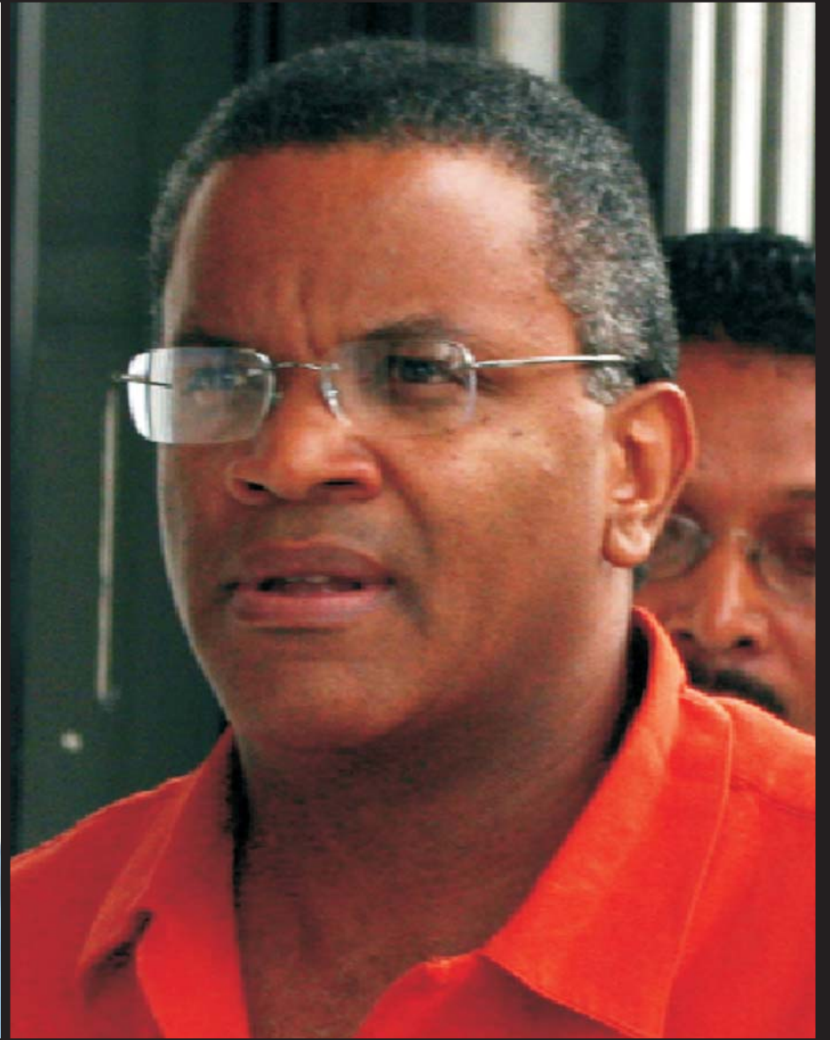
Paid Ashcroft Defender

For a few pieces of Silver these PUP Lawyers are prepared to sell out their Country