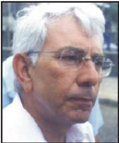
Said Musa, the man who carried the name of Prime Minister when the National Debt got out of hand