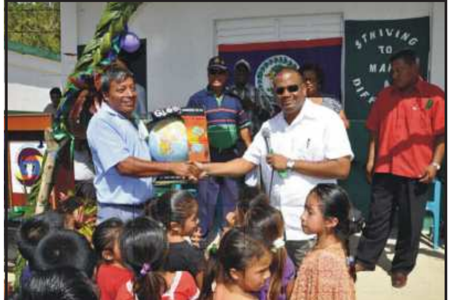
Hon. Patrick Faber in the midst of happy teachers and students

New school buildings which will address the educational needs of children in San Vicente and Hope Creek Villages in the Toledo and Stann Creek Districts respectively, were officially inaugurated last week. The total cost of both projects is approximately $1.3 Million and will benefit some 446 students.