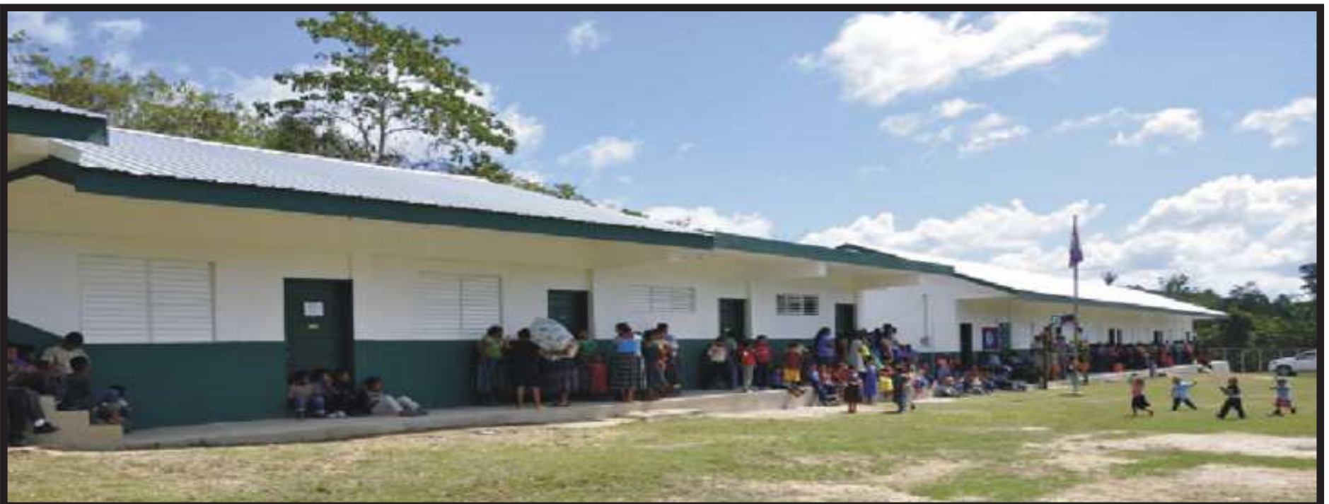
Newly Constructed School Building in San Vicente, Toledo