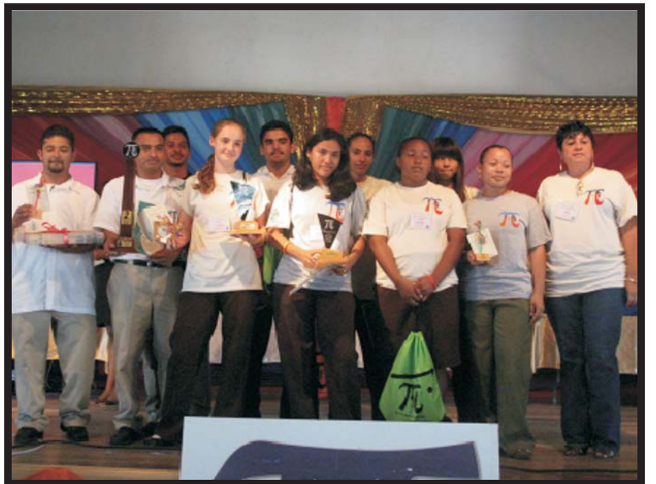
Southern Regional Sub-Champions from Independence High School, Stann Creek