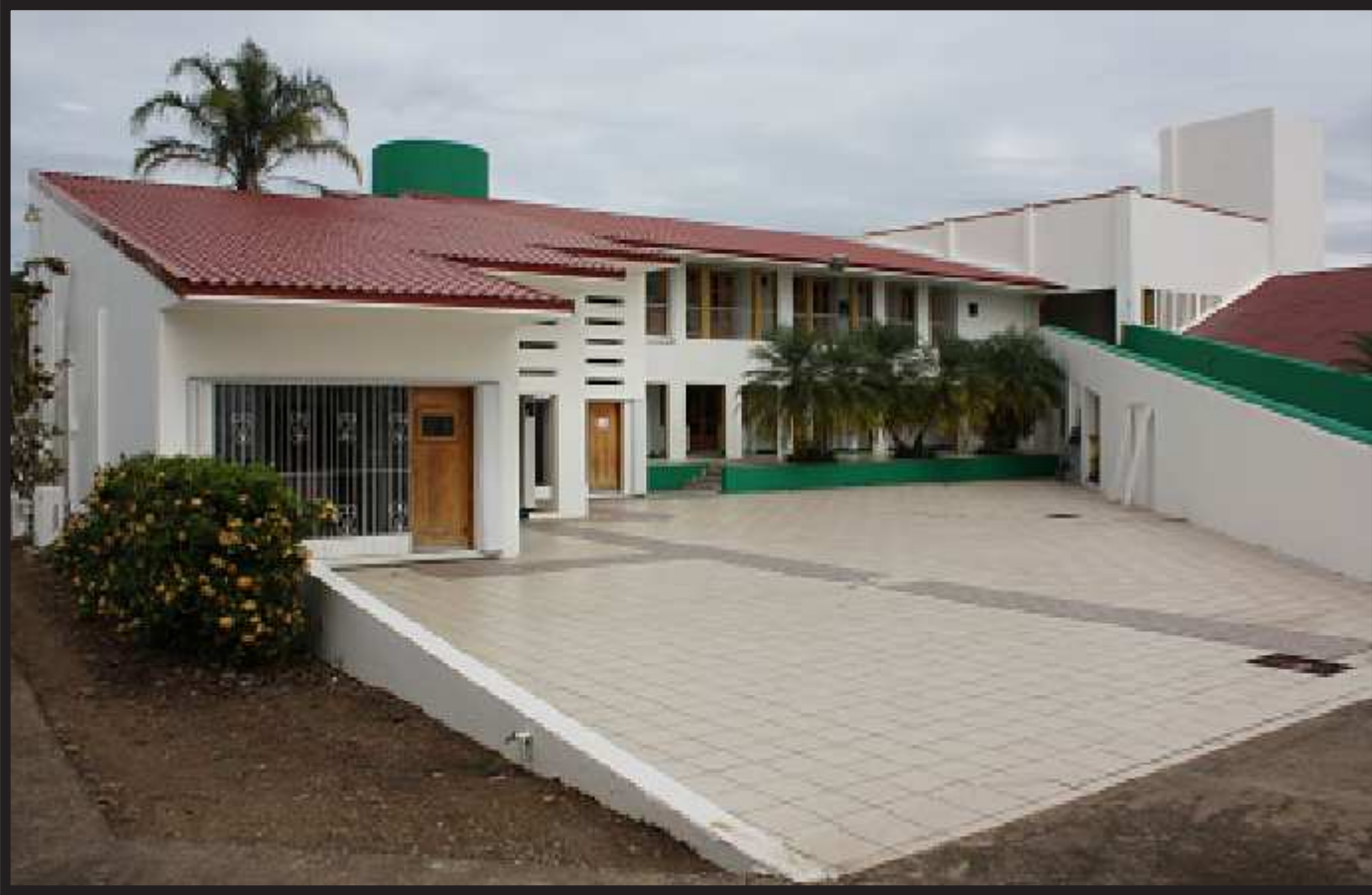
Social Security Headquarters in the Nation's Capital, Belmopan