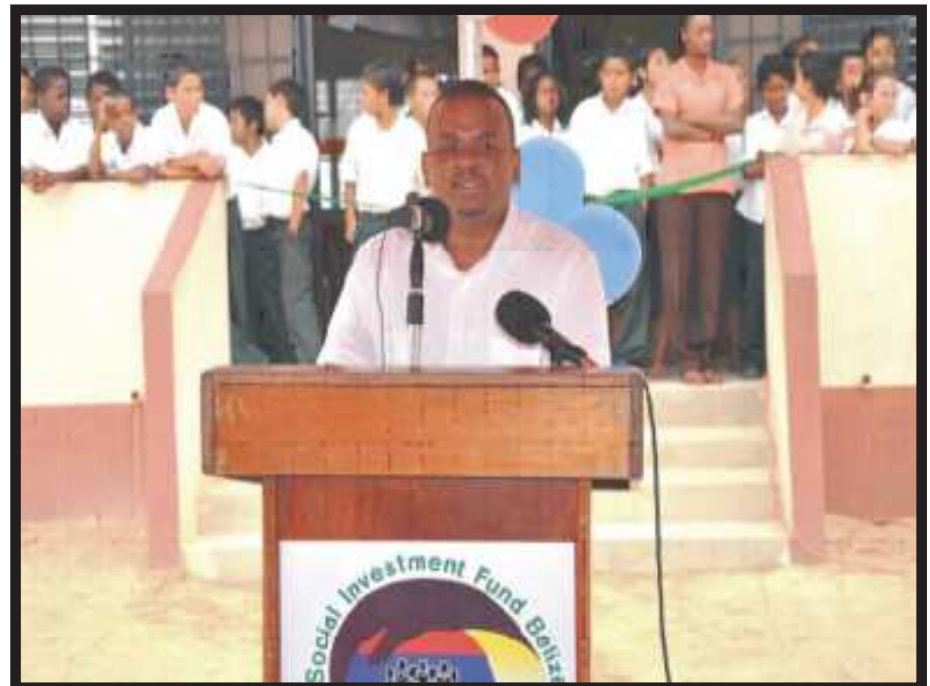
Hon. Patrick Faber Delivering address at Hope Creek

located 40 miles northwest of Punta Gorda Town near the Belize/Guatemalan border and 5 miles from Jalacte Village. The village was established around 1986 by farmers from Jalacte and surrounding areas. San Vicente has a population of 329 inhabitants.