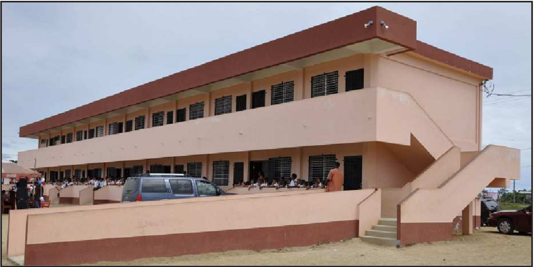
The Spanking New, Spacious School Building at Hope Creek, Stann Creek