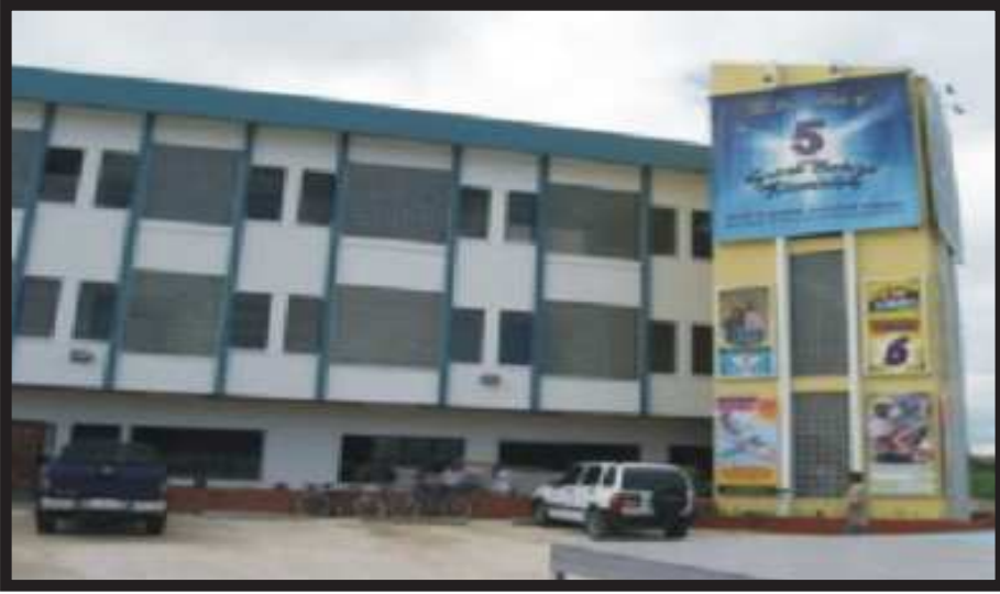
Channel Five, owned by Ashcroft and openly Anti-Belizean, is still being patronized by BTL with thousands of dollars in ad campaign