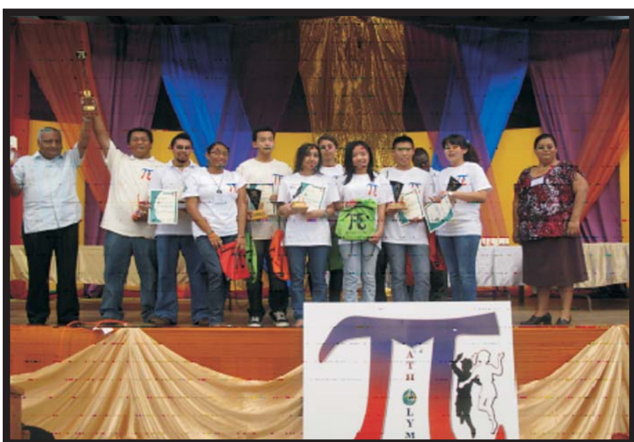
Western Regional Champions of Belize Christian Academy

proud sponsors of the Belize Math Olympiad, said in a media release, it acknowledges the exceptional support from all participating high schools and invites everyone to support, encourage and enjoy the remaining competitions.