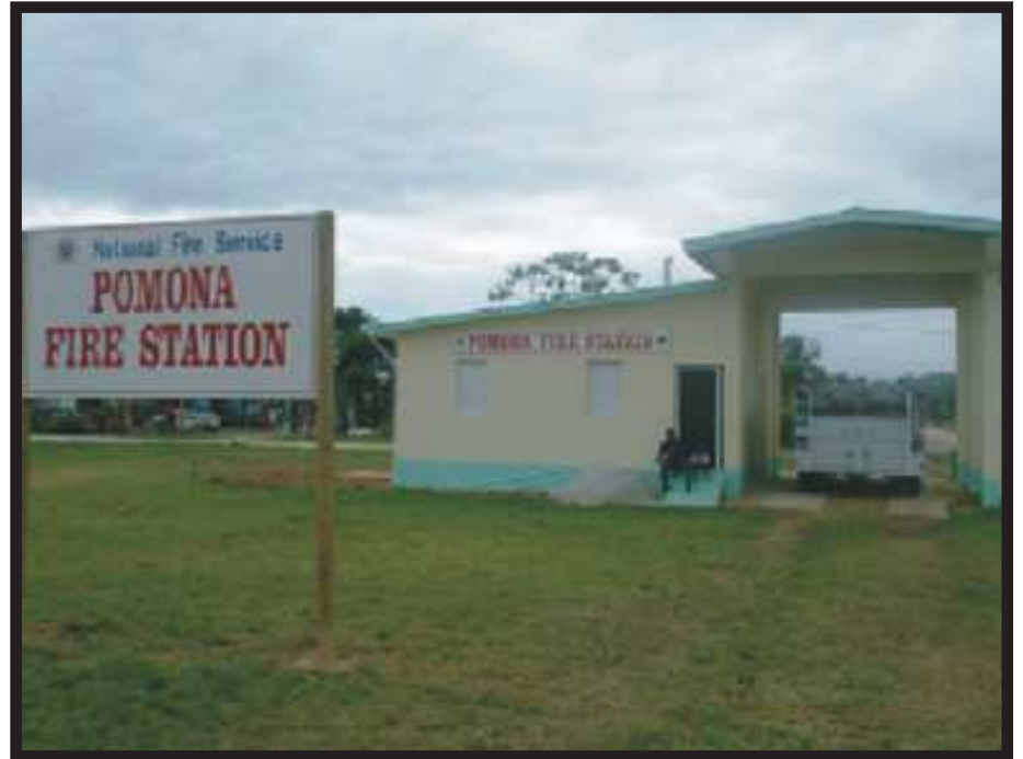
A model for many more to come, according to Minister of National Emergency Management and Fire Department and Area Representative for Stann Creek West Hon. Melvin Hulse. This Fire Station at Pomona in the Stann Creek Valley was officially inaugurated last Wednesday, February 9, 2011