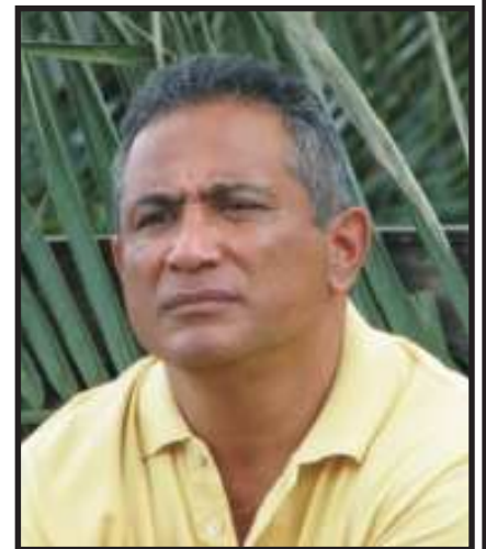
Johnny Briceno, was Musa's Deputy Prime Minister, now wants to be Prime Minister