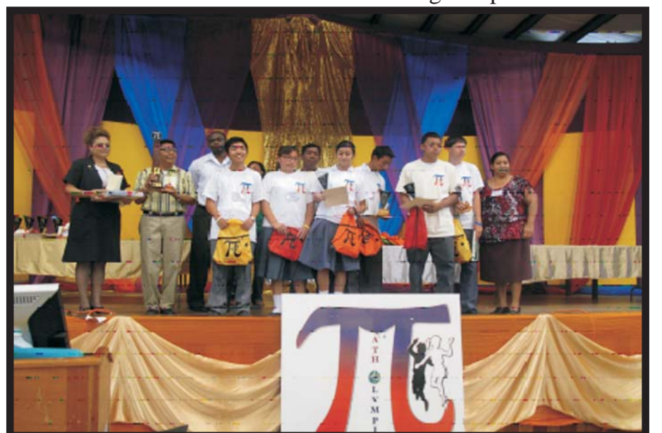
Western Regional Sub-Champions from Sacred Heart College, San Ignacio

On the morning of Wednesday February 9 th , the Sacred Heart Parish Hall in Dangriga was filled to capacity as seven high schools from the South competed for the title of the 2011 Southern Regional Champion.