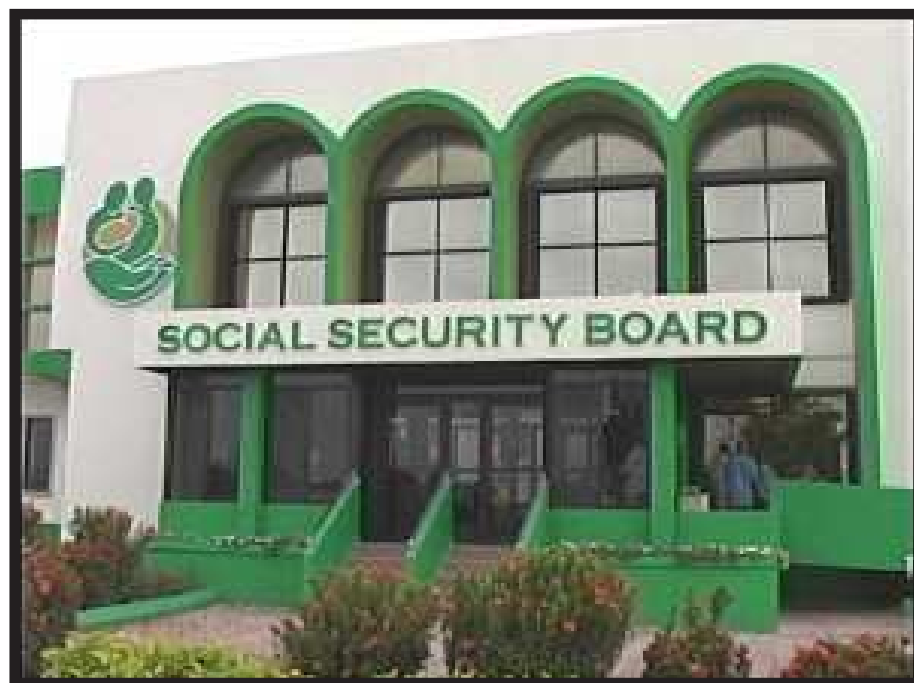
Social Security Offices in the Old Capital, Belize City