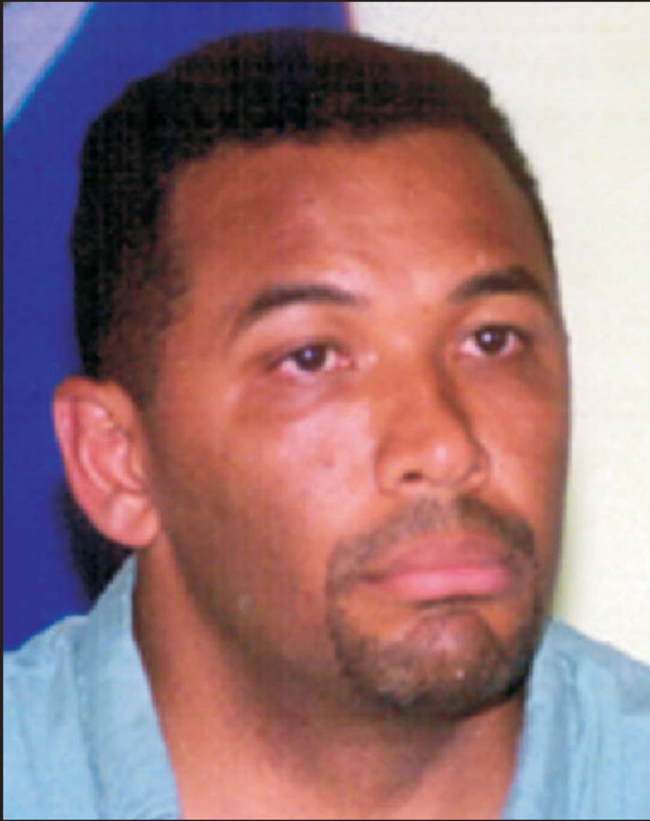
Paid Ashcroft Defender